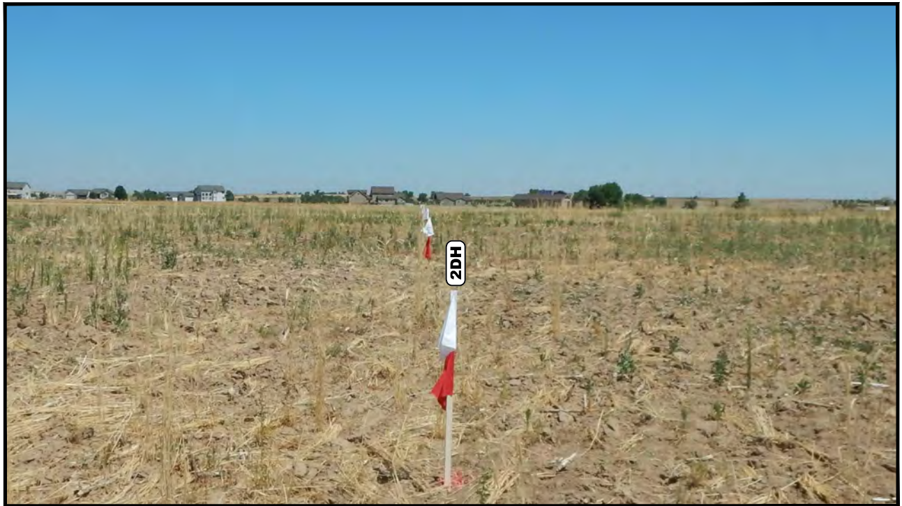
PHOTO: VIEW OF LOCATION STAKES