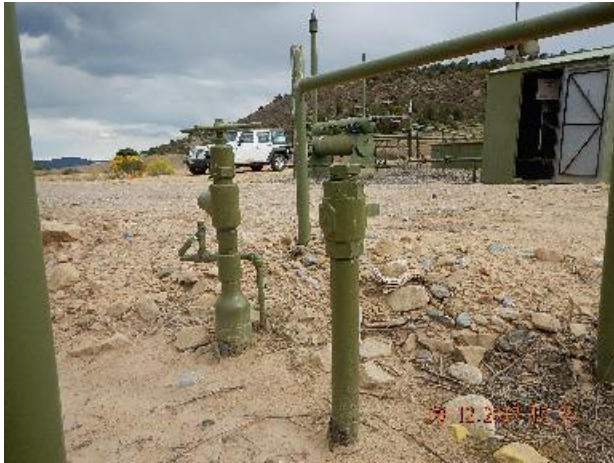
Photo 9: Closer view of group of (3) risers N side of meter run shed.