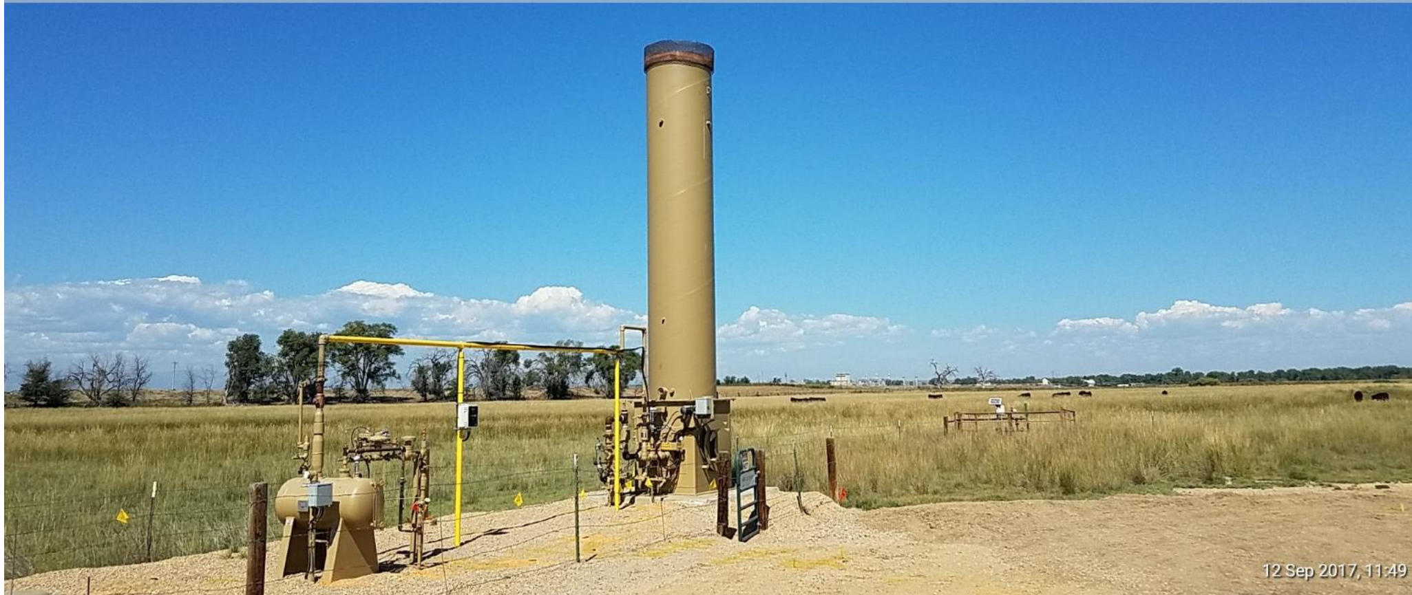
Emission Control Burner Location Number: 317978

BRG: 134.2° LAT: 40.213168 LON: -104.853889