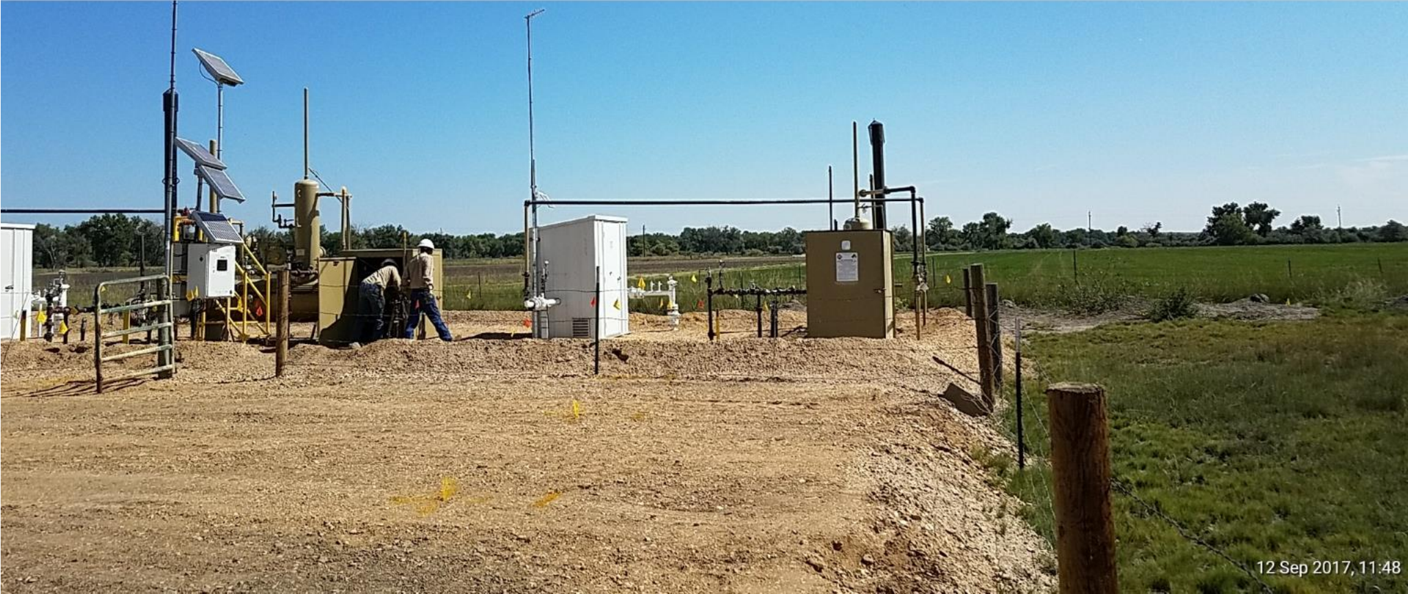
Separators Location Number: 317978

BRG: 217.4° LAT: 40.213016 LON: -104.853916