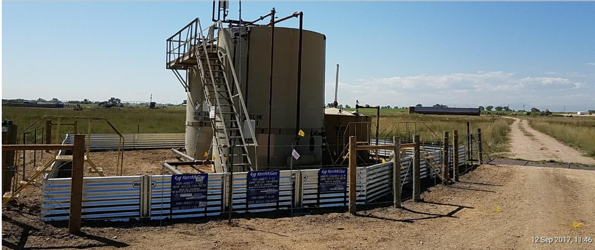
Tank Battery Location Number: 317978

BRG: 36.6° LAT: 40.213072 LON: -104.853916