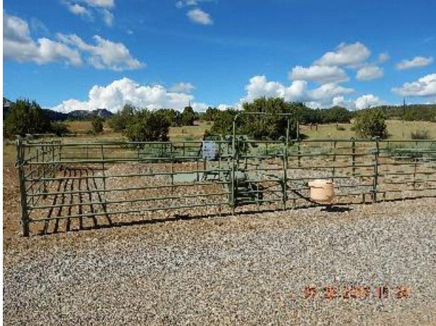
Photo 3: Produced water tank with labels and signage not visible from outside containment. Previous inspection.