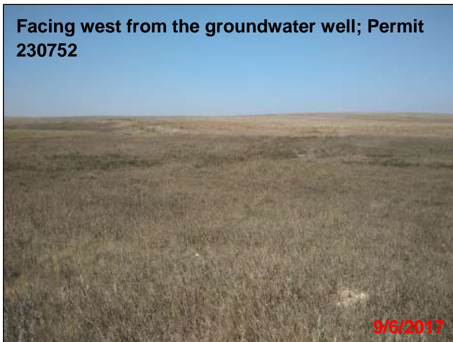
Facing west from the groundwater well; Permit 230752