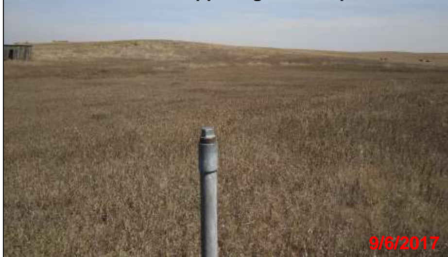
Facing north from the groundwater well; Permit 230752; Easy Come #1 well pad under construction in the upper right of the photo