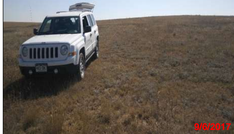
Facing east from the groundwater well; Permit 230752