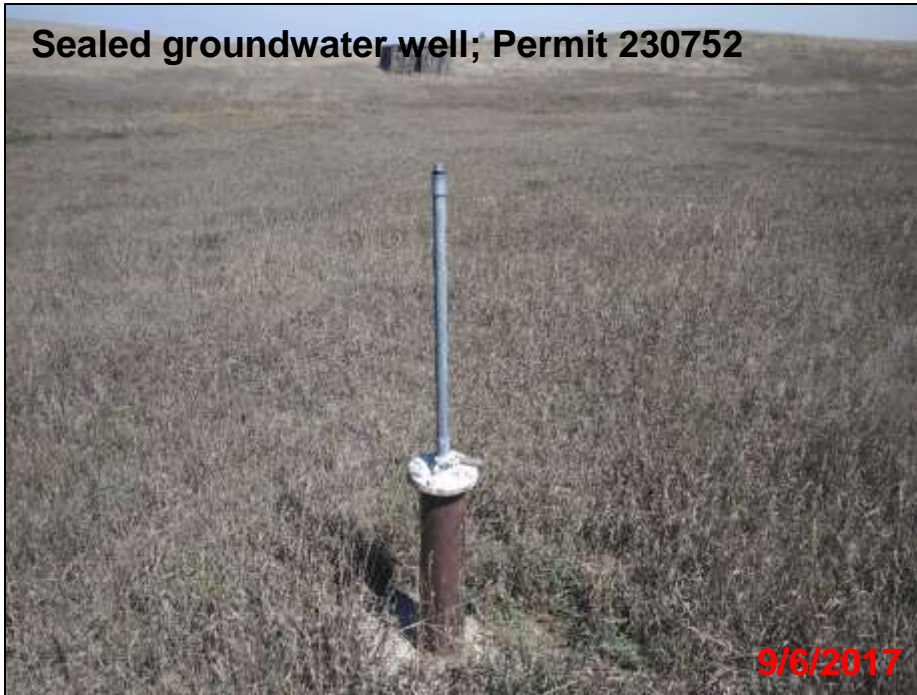
Sealed groundwater well; Permit 230752