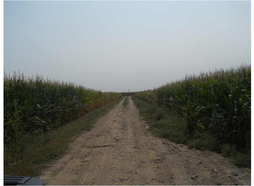
Access road to wellhead looking south from county road 54