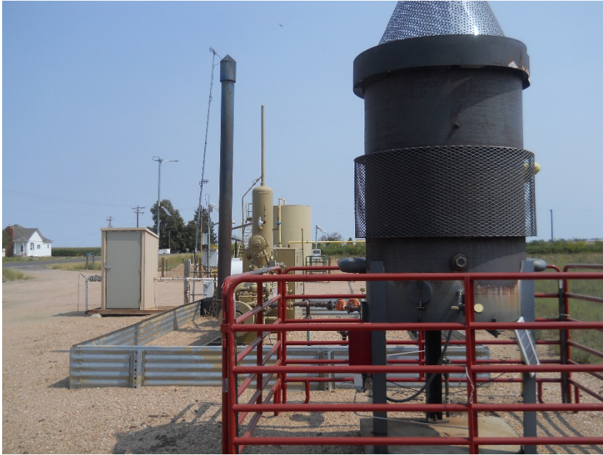
Battery looking east from west edge of location