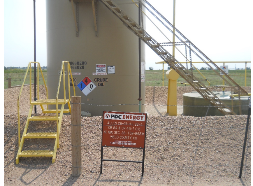
Tank battery looking south