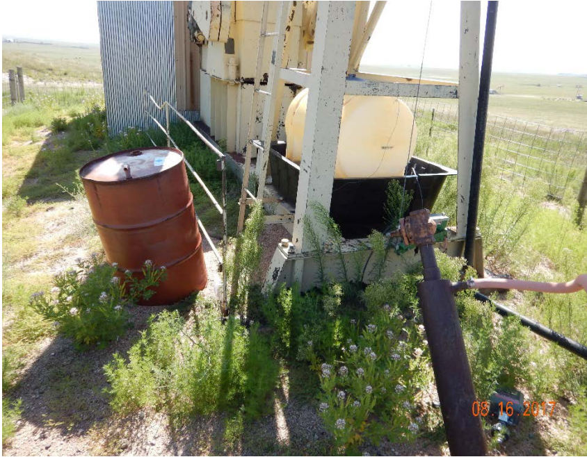
Photo 3 - Unlabeled 55-gallon drum lacking secondary containment and day tank beneath pumping unit with adequate secondary containment.