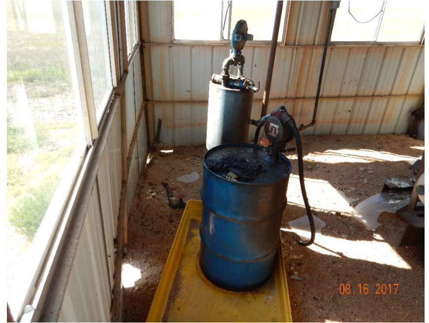
Photo 4 – Storage drum inside of shed with adequate secondary containment. Note: broken glass in background.