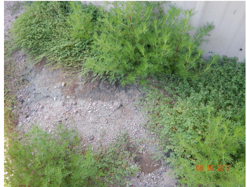
Photo 6 – Historical accumulation of asphaltic material outside of pump jack shed (1).