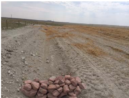
Perimeter Diversion Ditch with velocity check