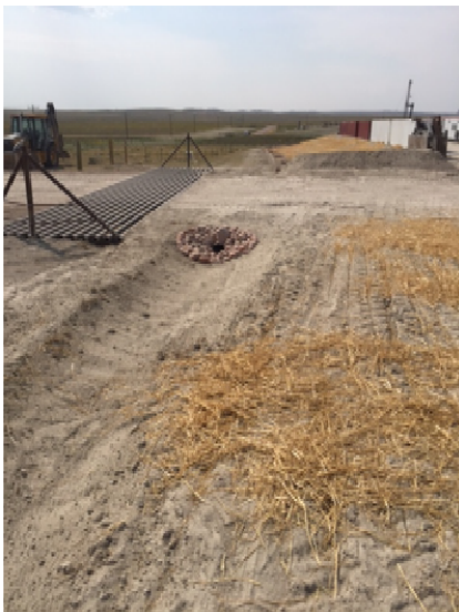
Culvert with inlet protection