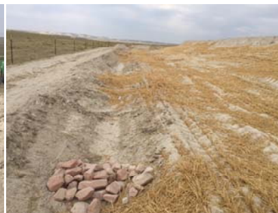
Perimeter Diversion Ditch with velocity check