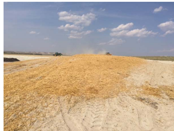
Topsoil pile has been seeded and straw mulched