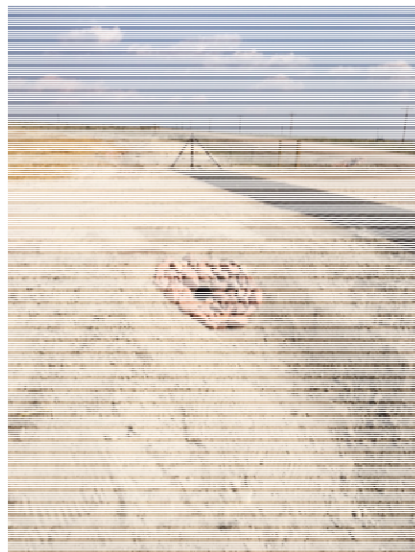
Culvert with outlet protection