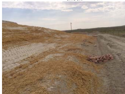
Perimeter Diversion Ditch with velocity check