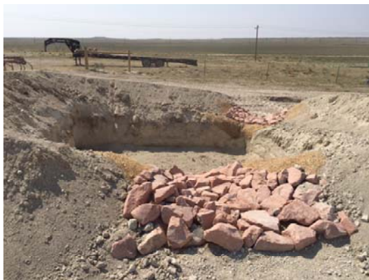
Sediment trap with inlet and outlet protection