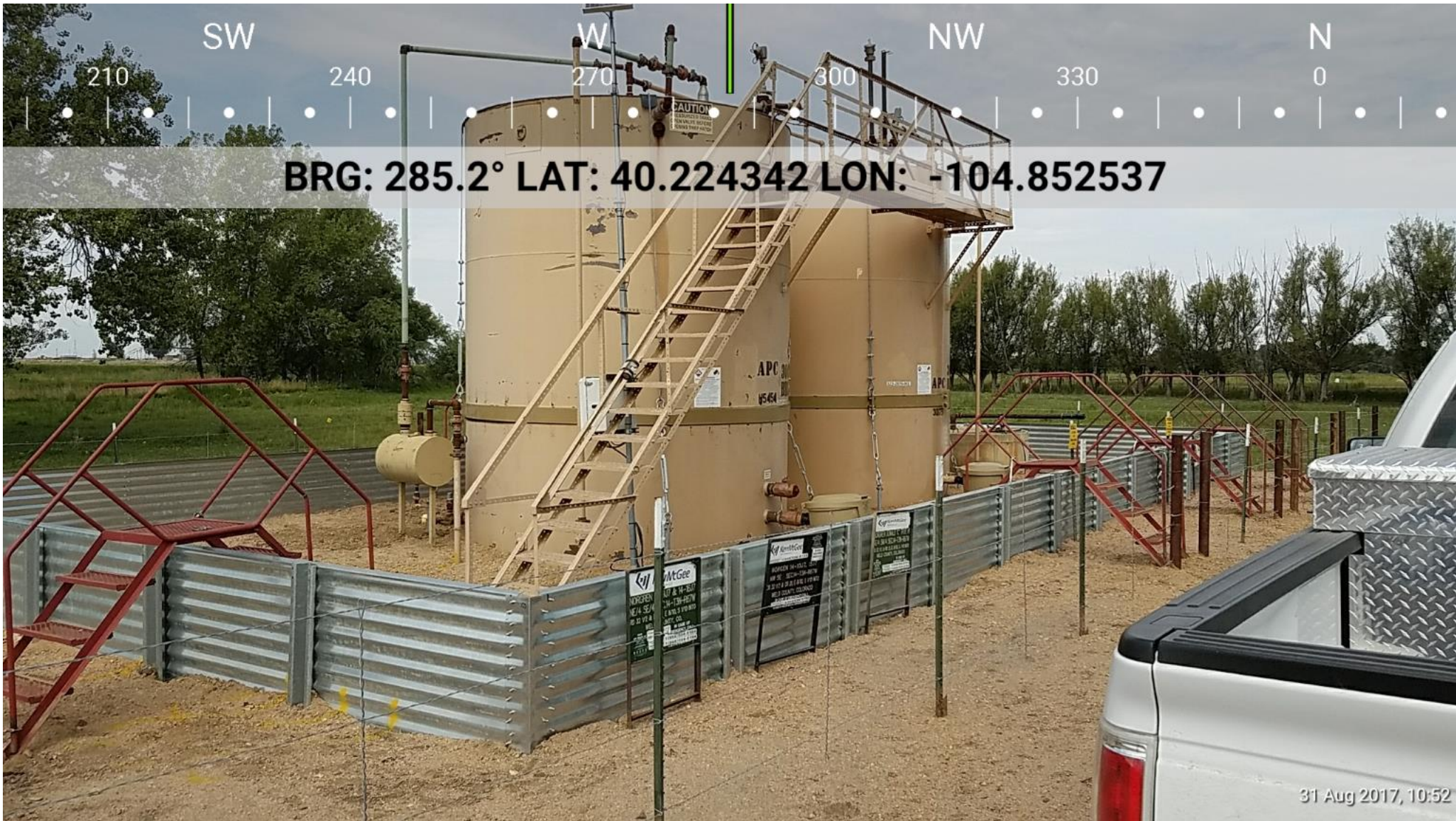
Battery Southeast Corner