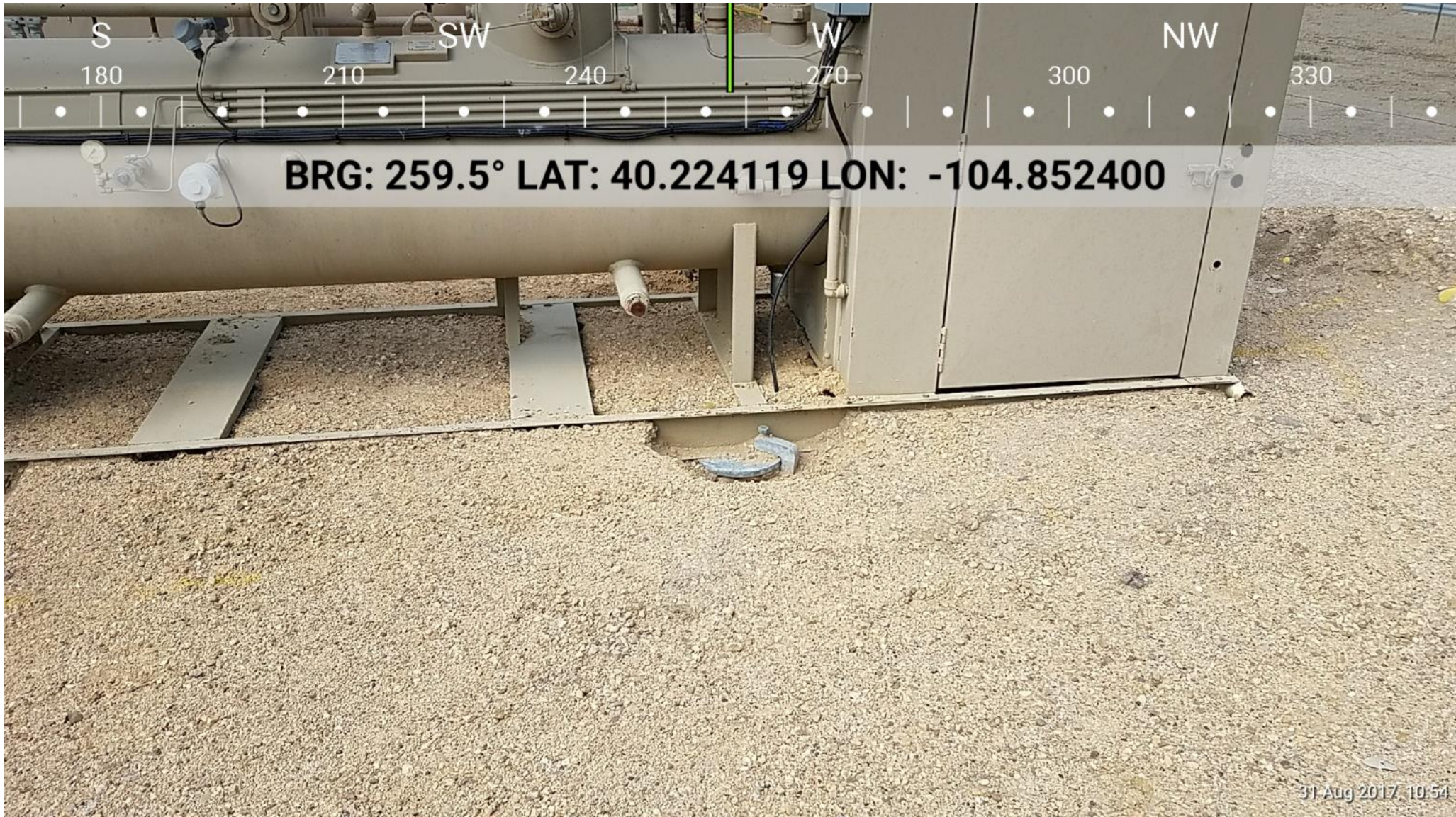
Separator Flood Anchoring Location Number: 330209