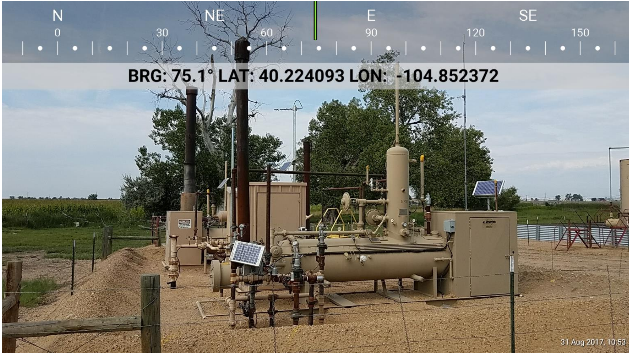
Separators Location Number: 330209