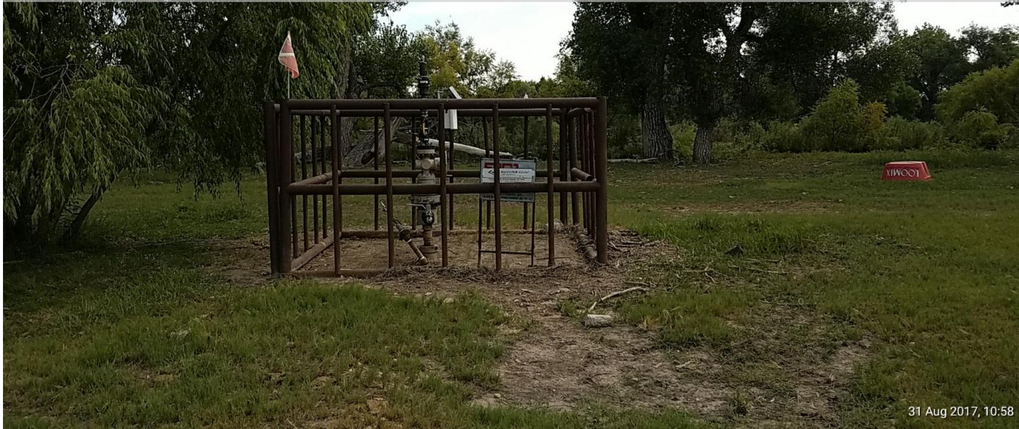
Wellhead Location Number: 330209

BRG: 151.1° LAT: 40.223122 LON: -104.851681