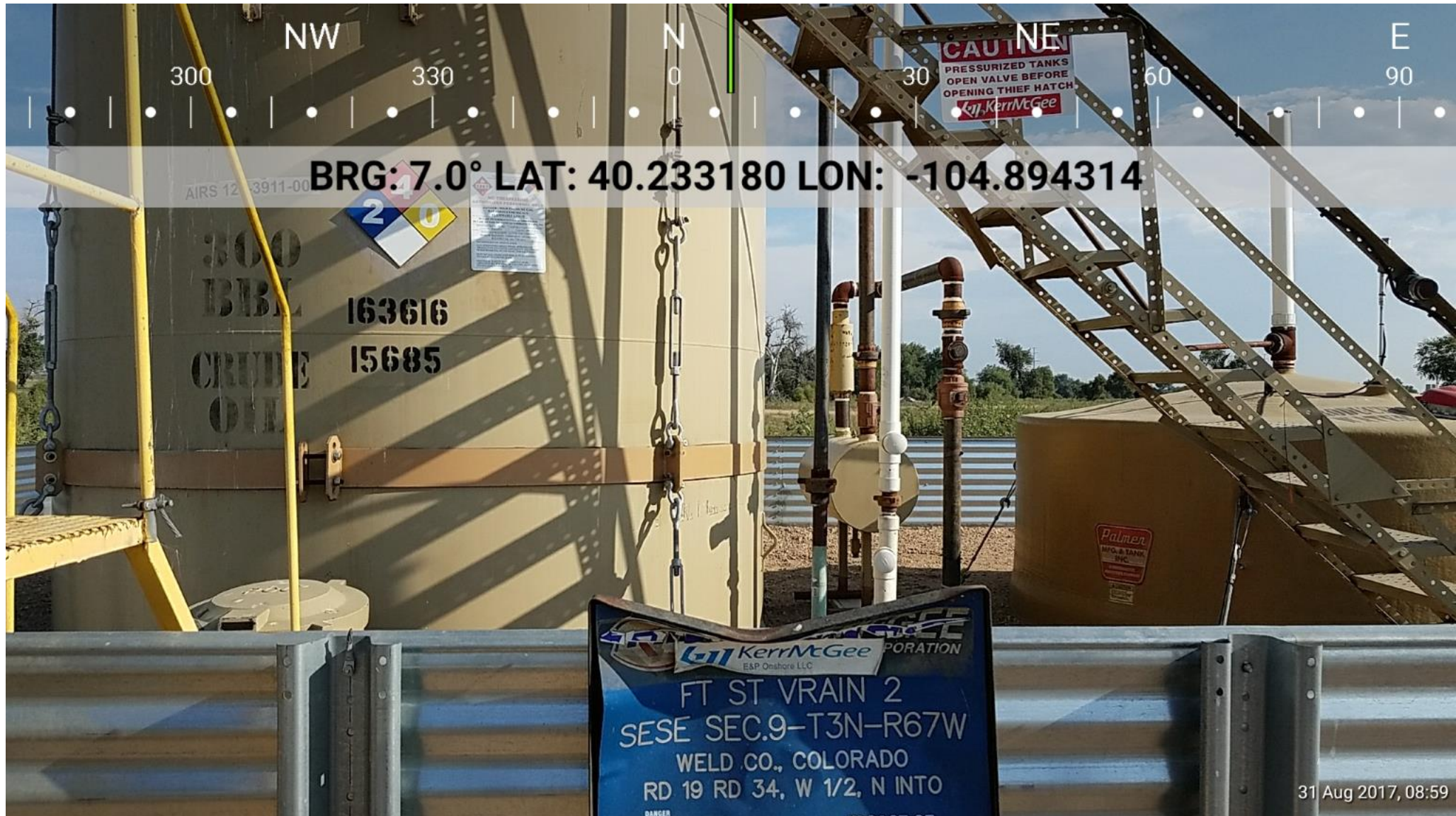
Flood Anchor Location Number: 318878