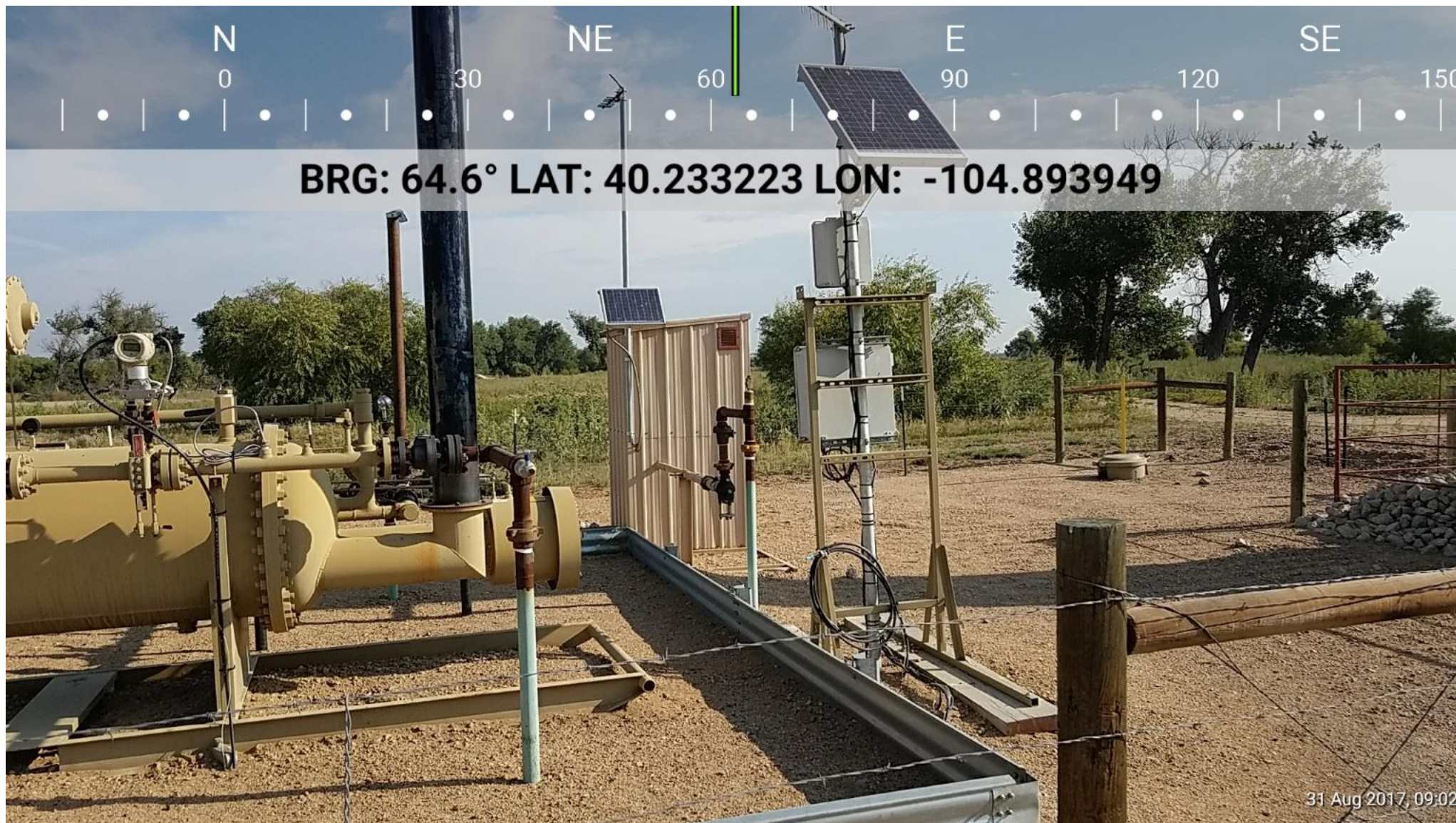
Gas Meter Run Location Number: 318878