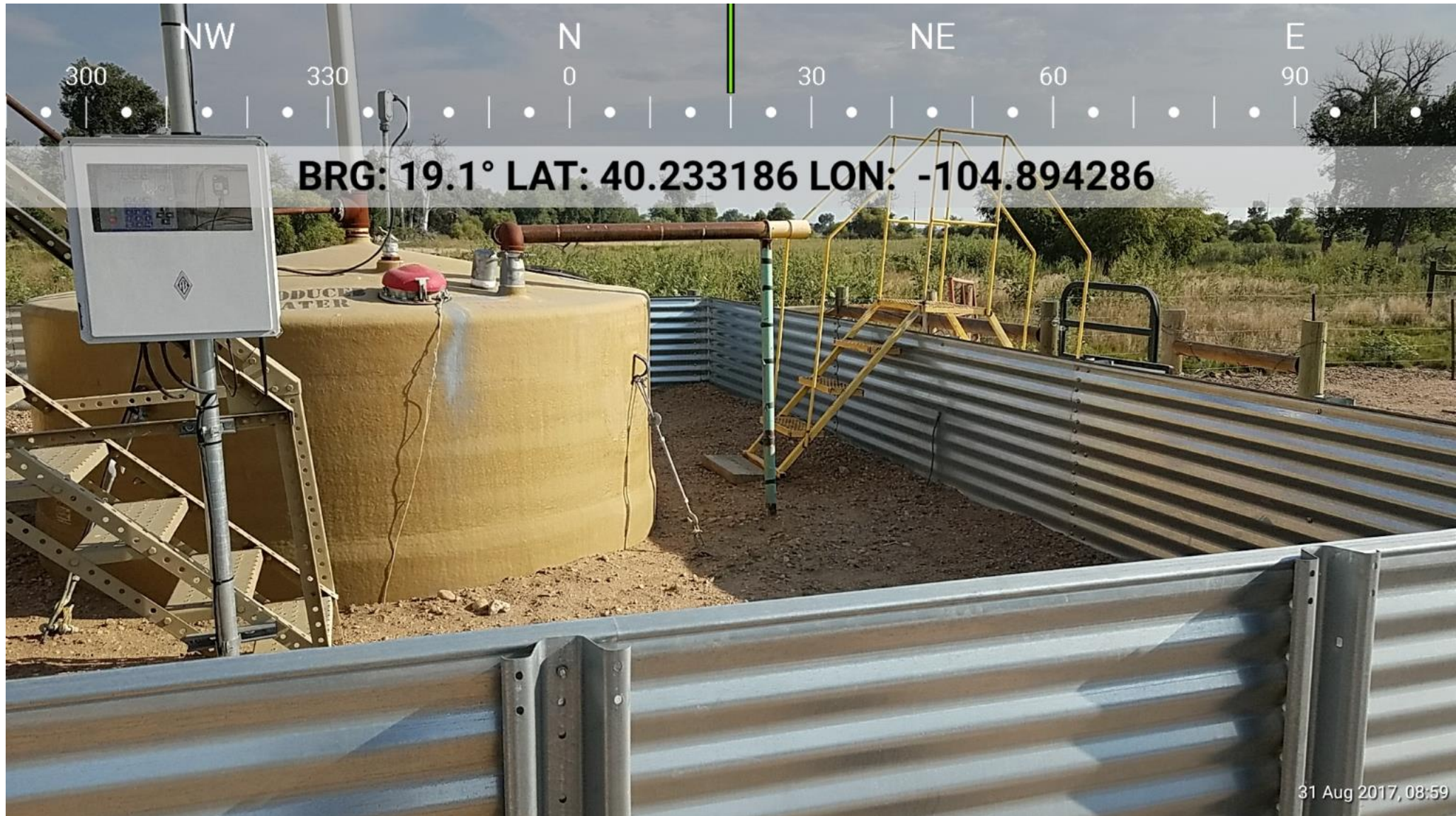
Produced Water Flood Anchor Location Number: 318878