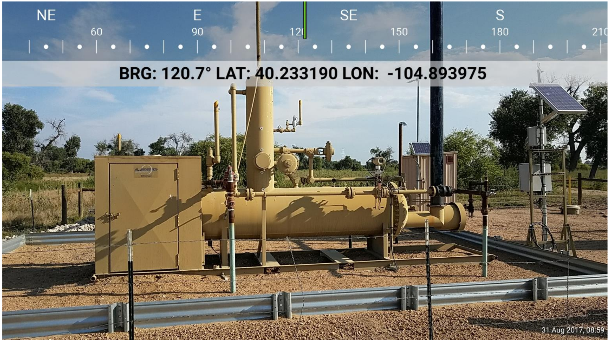
Separator and Gas Meter Run Location Number: 318878