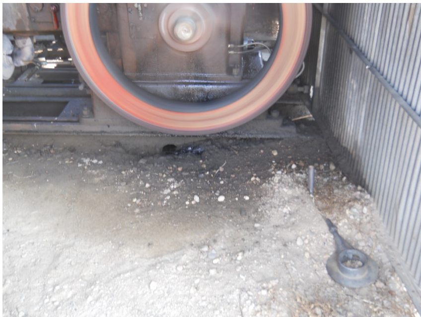
Stained soil around pump jack motor, south side