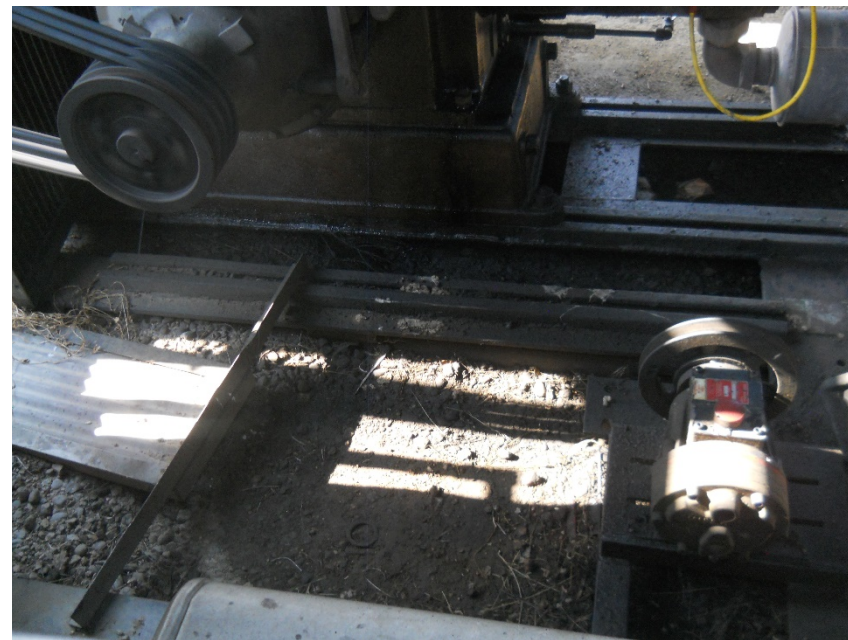
Stained soil around pump jack motor, north side