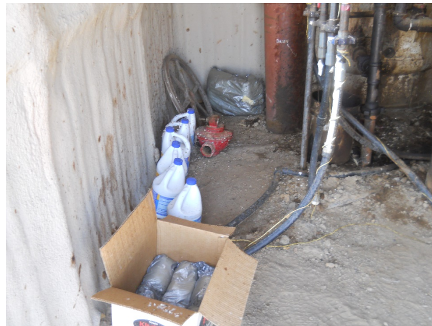
Trash inside of heater treater shed, east wall