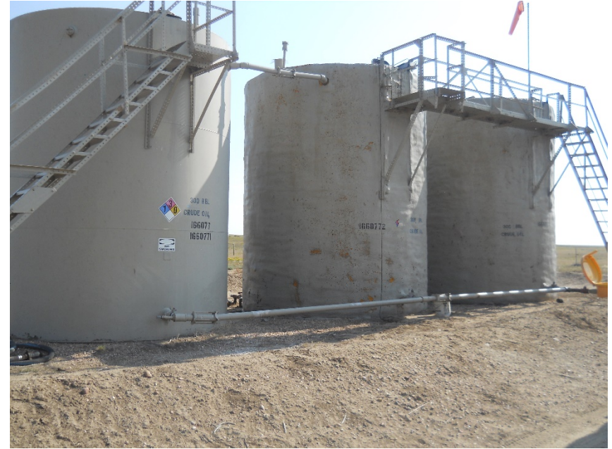
Crude oil tanks looking northeast. Middle tank and east tank need NFPA labels. Middle tank NFPA is not legible, east tank is missing label.