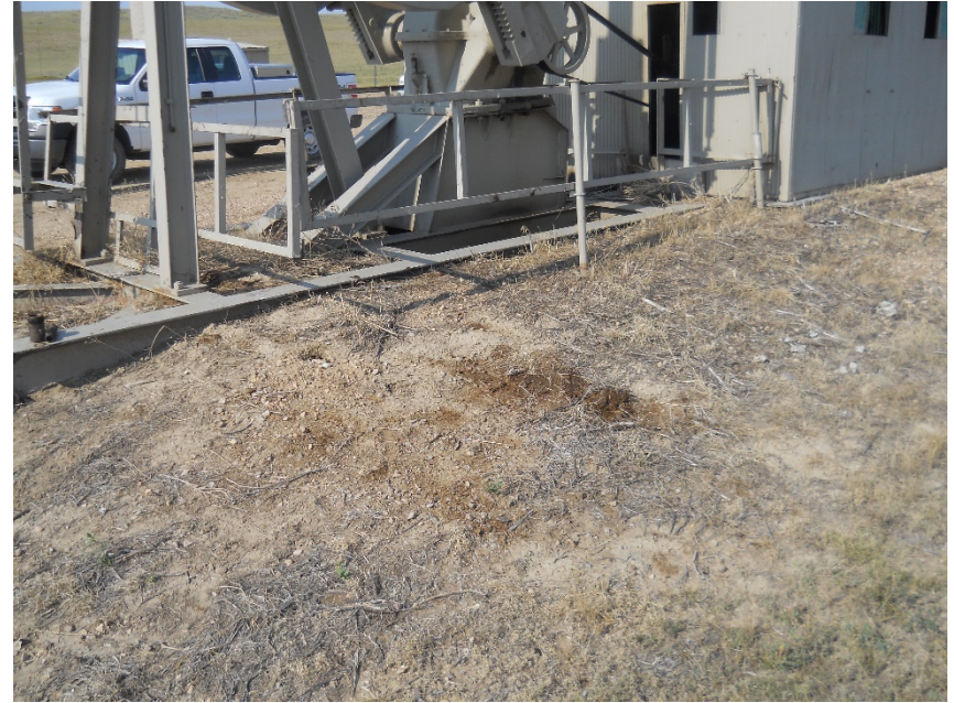
Stained soil north of pump jack