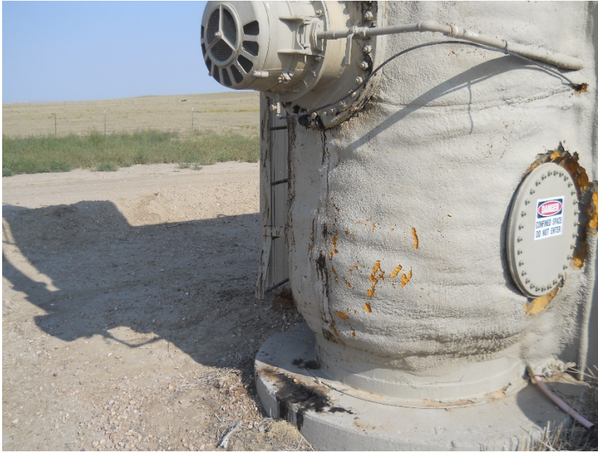
Heater treater fire tube gasket is starting to leak