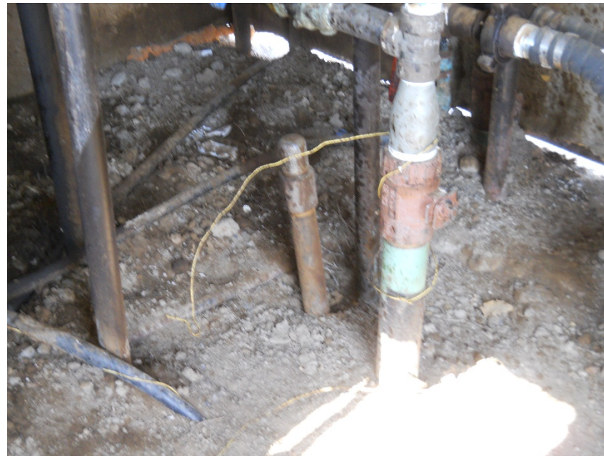
2" unused/unmarked steel riser in heater treater shed