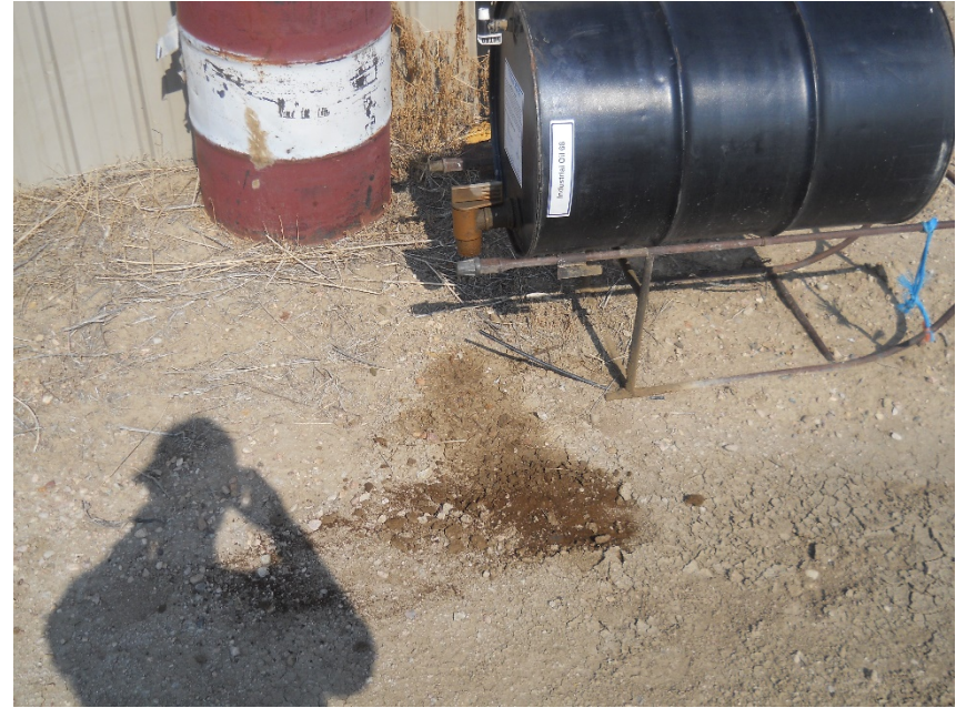
Stained soil from industrial oil container east side of heater treater shed