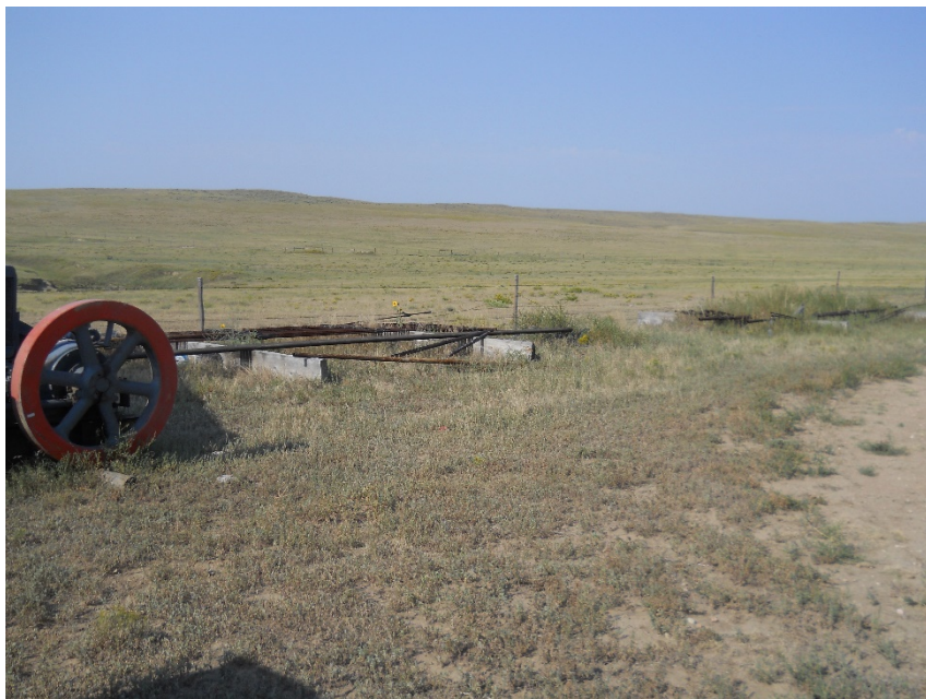
Unused pump jack equipment looking southwest