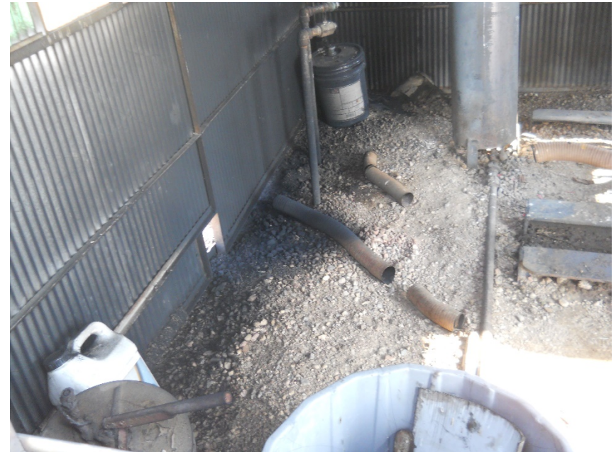
Stained soil inside of pump jack shed from pump jack motor, west side