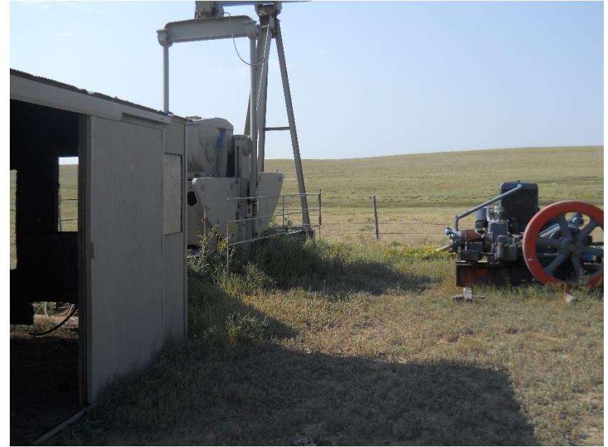
Unused pump jack and equipment looking south