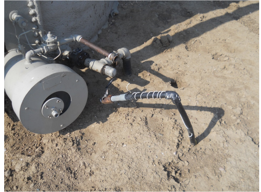
1" unused poly riser north side of middle crude tank