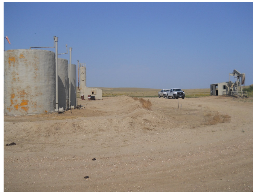
Battery looking west