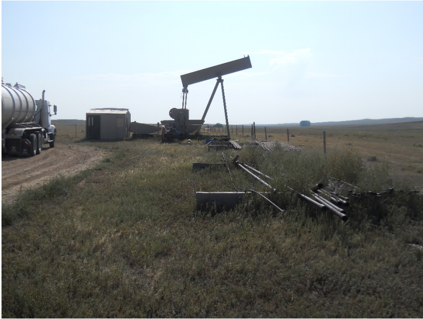
Unused pump jack and equipment on southeast perimeter of location, looking east