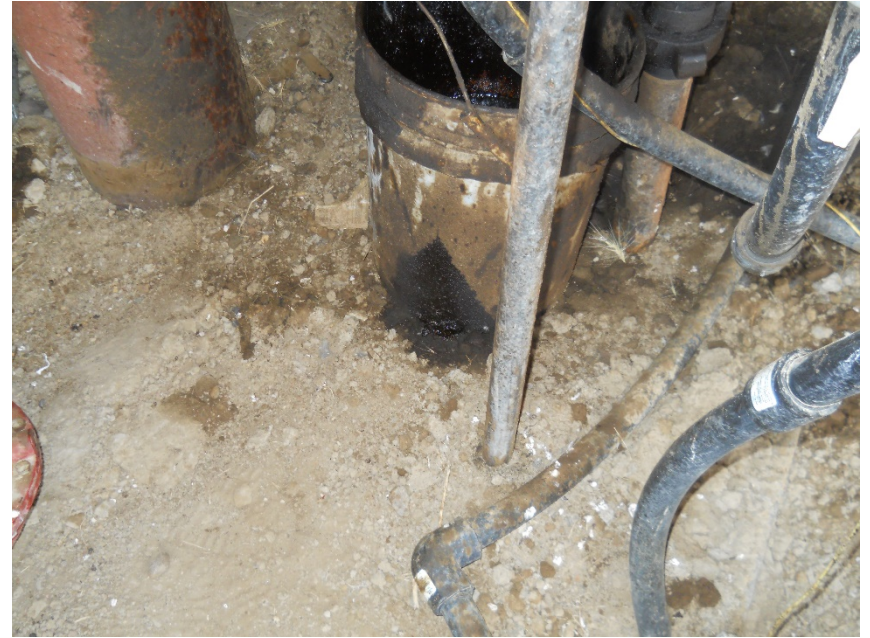
5 gallon bucket in heater treater shed, has a hole in it and staining soil