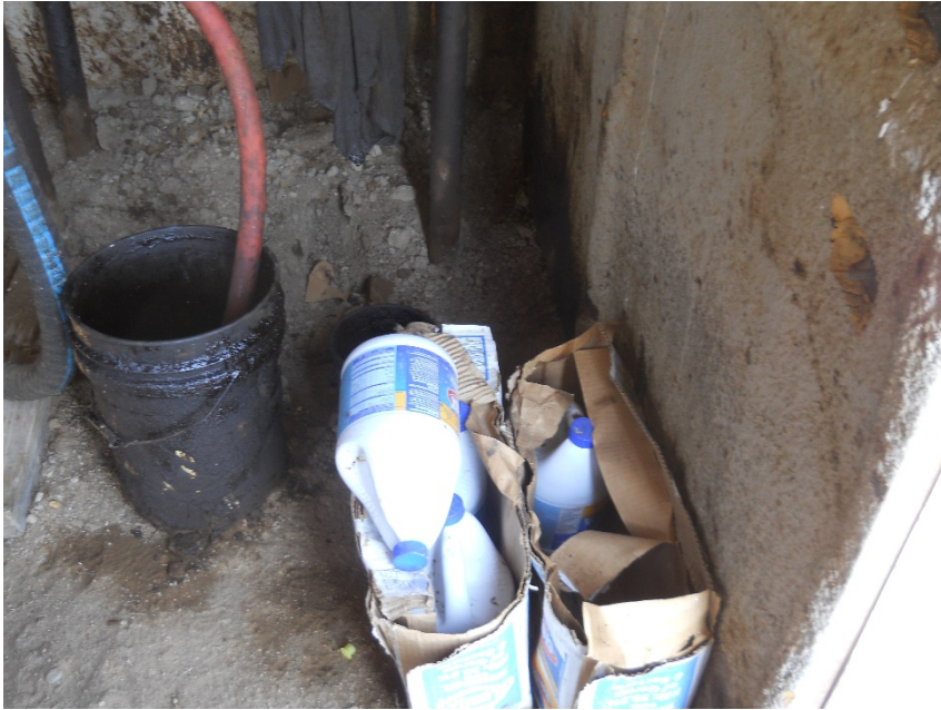
Trash inside of heater treater shed, north wall