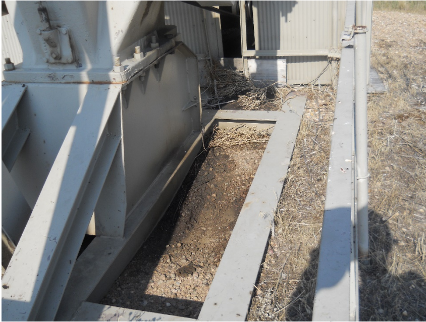
Stained soil in pump jack skid, north side