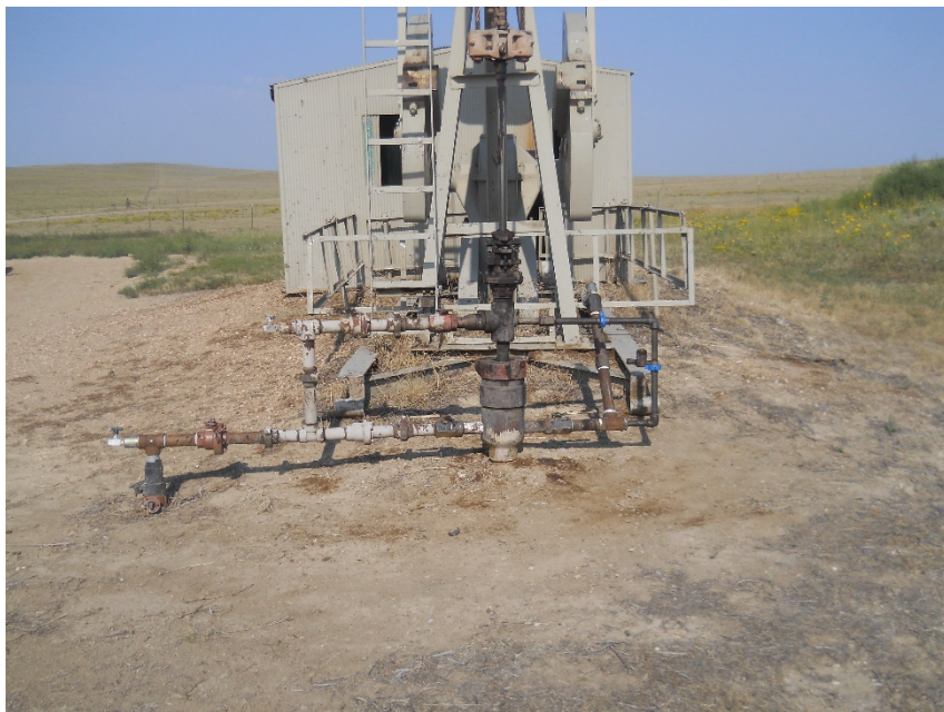
Stained soil around wellhead, looking west