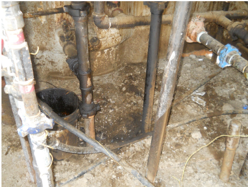
Stained soil in heater treater shed under oil dump