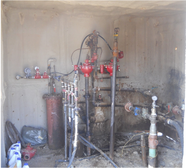
2" unused/unmarked steel riser in heater treater shed