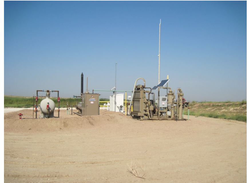
WEEDS AROUND LOCATION AND PRODUCTION EQUIPMENT