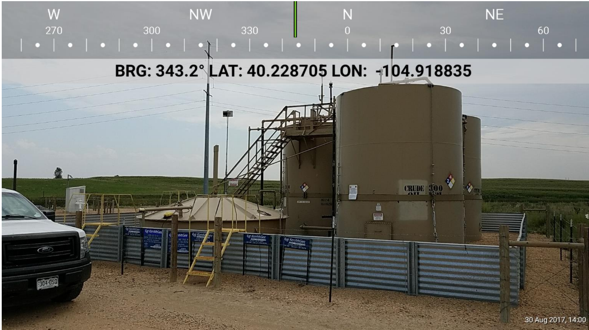
Tank Battery Location #: 332867