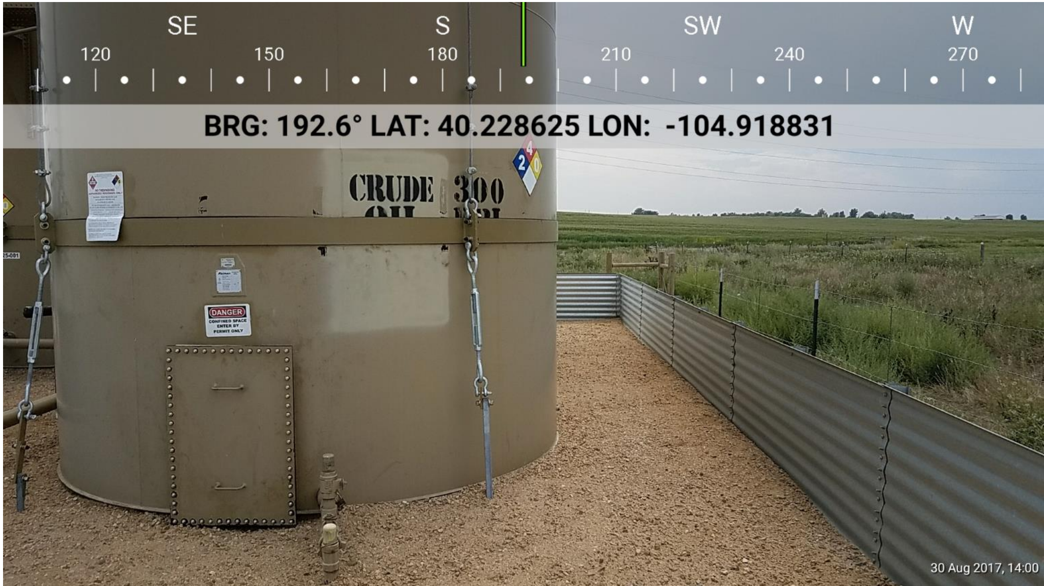
Flood Anchoring on Crude Oil Tank