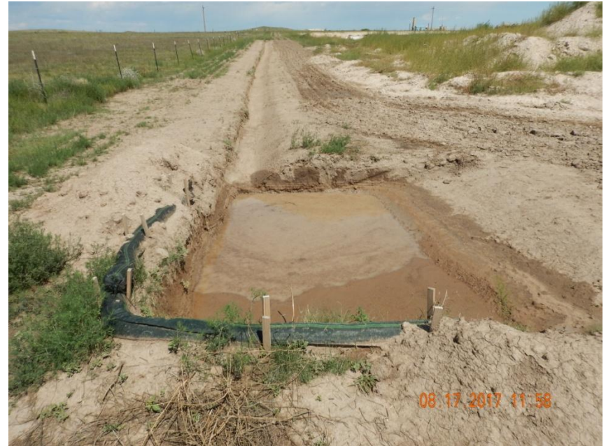
Photo 6. Photo taken from the southwest location, facing North. Appears the Operator has enlarged the sediment trap size and embankment berms. Also, appears the Operator has installed surface roughening along the southern and western areas. Embankment material and embankment construction does not appear to be sufficiently compacted.