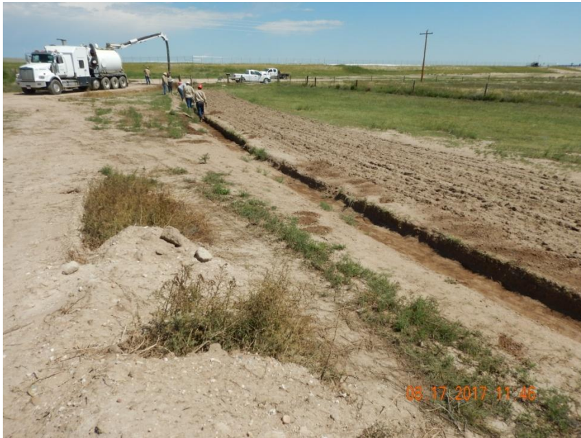
Photo 1. Photo taken from the eastern pad on top of the topsoil stockpile, facing North. Stormwater crew out cleaning perimeter ditches and cattle guard maintenance being performed as well.