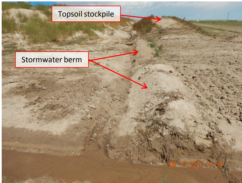
Photo 3. Photo taken from the southeastern location, facing North. Photo illustrates stormwater ditch and berm that was likely created from using topsoil material. The ditch has been installed to allow stormwater runoff to flow off the production pad into the stormwater management area.