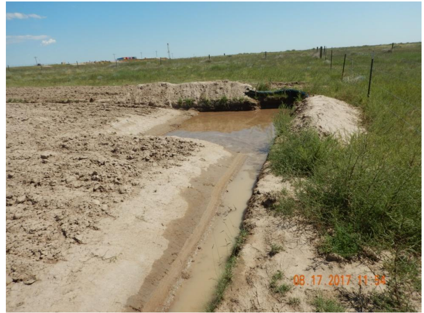
Photo 4. Photo taken from the southeast location, facing East. Appears the Operator has enlarged the sediment trap size and embankment berms. Embankment berms may have been built out of topsoil material.