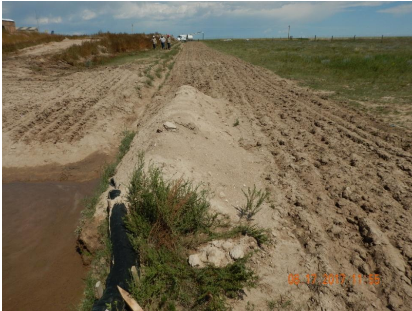
Photo 5. Photo taken from the southeastern location, facing North. Photo illustrates surface roughening installed along the eastern perimeter of the location. Embankment berms may have been built out of topsoil material.