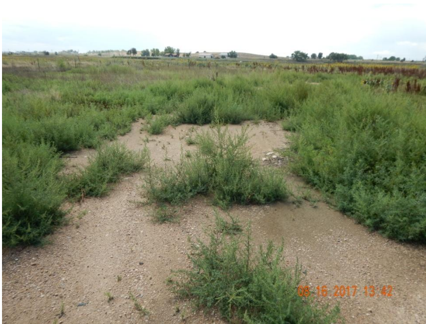
Photo 5. Photo taken from the eastern battery location, facing West. Weedy, annual vegetation (Kochia and Russian thistle) observed throughout the battery location. Photo further illustrates that reclamation activities have not been performed because gravel still remains.