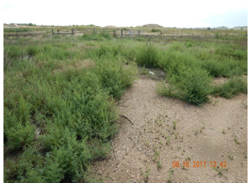
Photo 4. Photo taken from the eastern battery location, facing South. Weedy, annual vegetation (Kochia and Russian thistle) observed throughout the battery location. Photo further illustrates that reclamation activities have not been performed because gravel still remains.