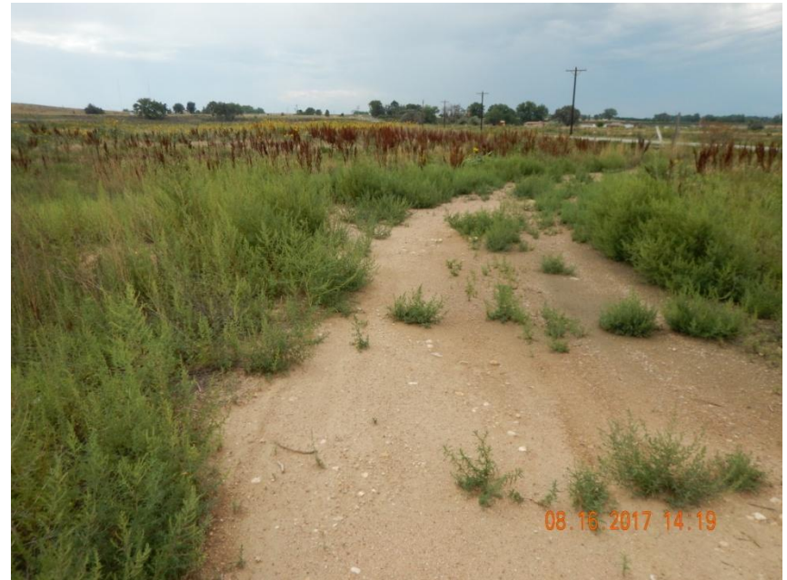
Photo 6. Photo taken from the central battery location, facing West. Weedy, annual vegetation (Kochia and Russian thistle) observed throughout the battery location. Photo further illustrates that reclamation activities have not been performed because gravel still remains from the access road.