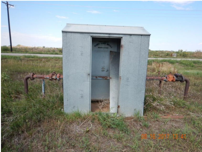
Photo 1. Photo taken from the eastern battery location, facing North, towards the meter shed. Comply with the Pipeline/Flowline NTO and/or the Reclamation Rule 1004.a to remove (regardless of ownership) all equipment.