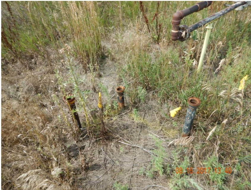
Photo 3. Photo taken of three (3) pipe risers that were previously mentioned in Photo 2.