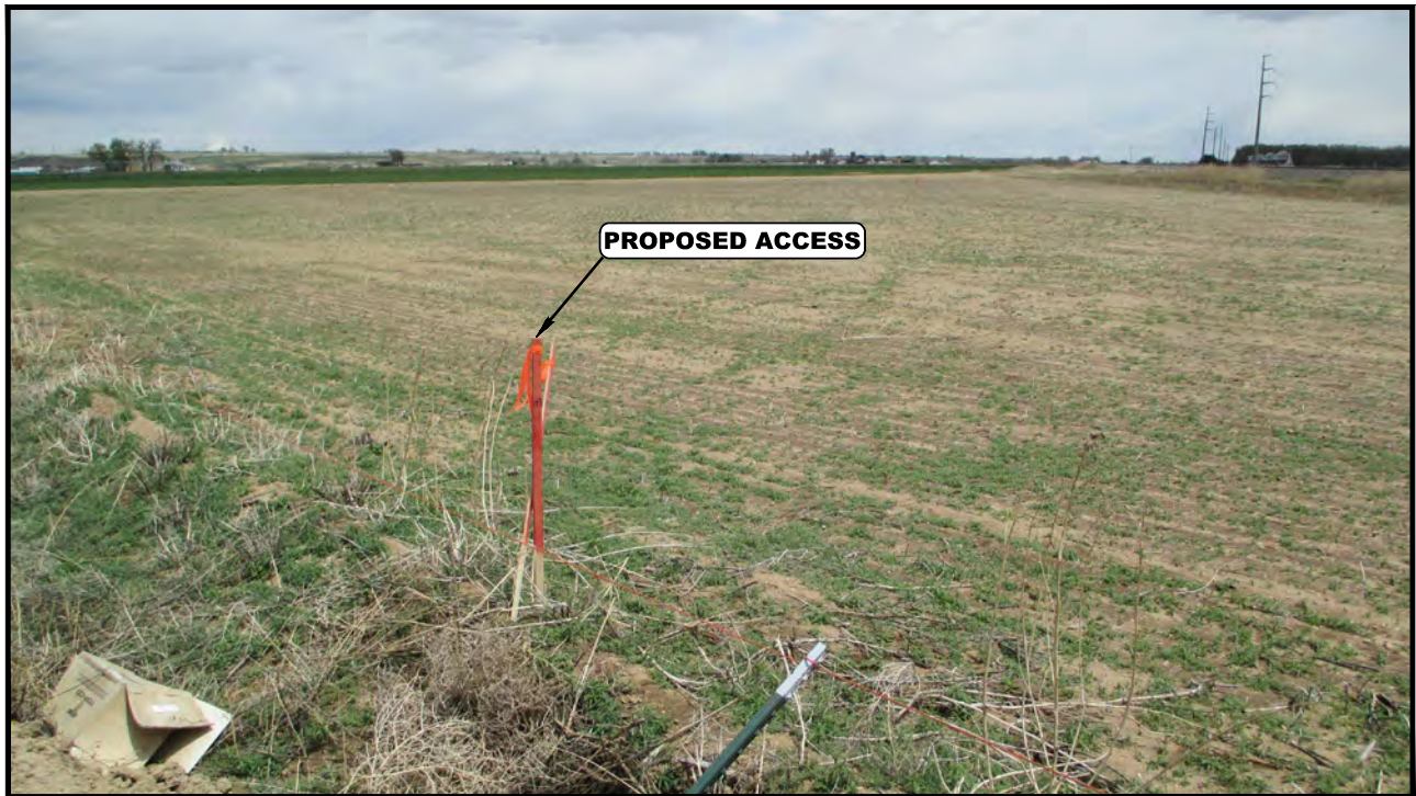
PHOTO: VIEW FROM BEGINNING OF PROPOSED ACCESS