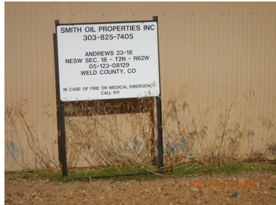
Photo 2: Photo taken from the east end of the battery facility. Photo shows the second sign for an active well this battery serves