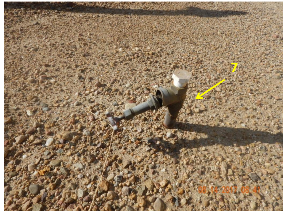
Photo 6: Photo taken from the central area of the battery facility. Photo shows risers at the battery. Inspection doc. #682502037 required operator to comply with reclamation requirements and the 2017 Flowline NTO to remove the risers. Riser seen here does not appear to be in proper function condition and needs to be removed.