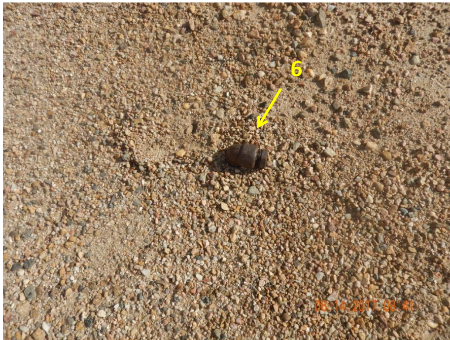
Photo 5: Photo taken from the central area of the battery facility. Photo shows risers at the battery. Inspection doc. #682502037 required operator to comply with reclamation requirements and the 2017 Flowline NTO to remove the risers. Riser seen here does not appear to be in use and will need to be removed.