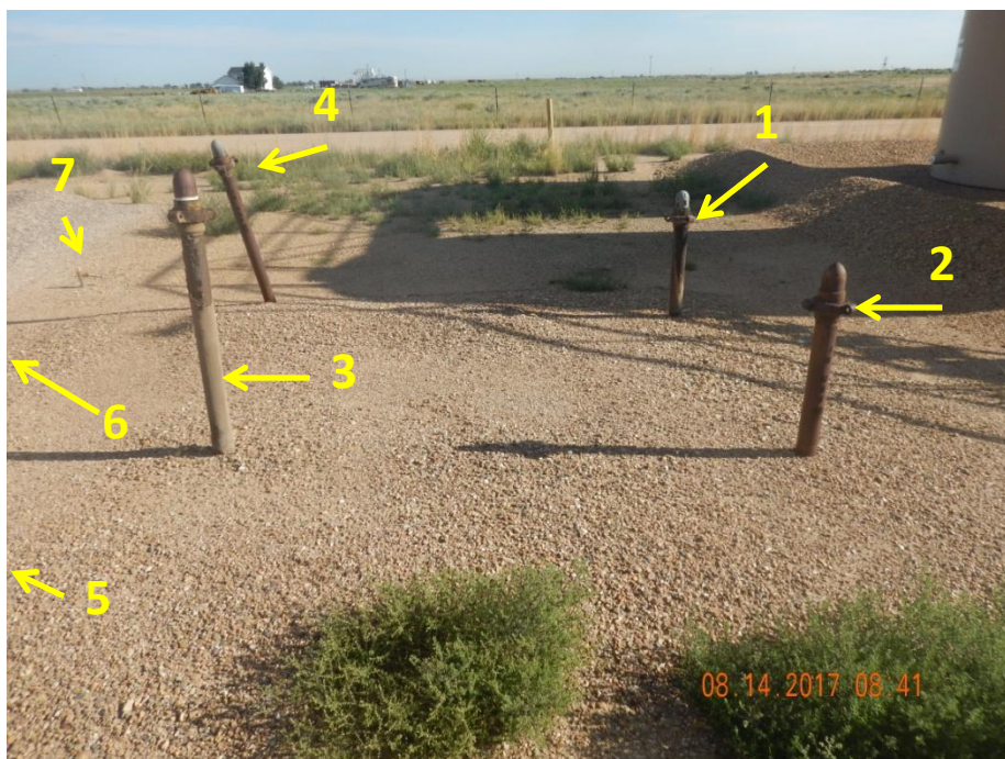
Photo 3: Photo taken from the central area of the battery facility, facing north. Photo shows risers at the battery. Inspection doc. #682502037 required operator to comply with reclamation requirements and the 2017 Flowline NTO to remove the risers. Operator appears to have only sprayed "In Use" on five (5) of the seven (7) risers visible (risers labeled 1-5). Risers labeled "In Use" will require pressure testing.