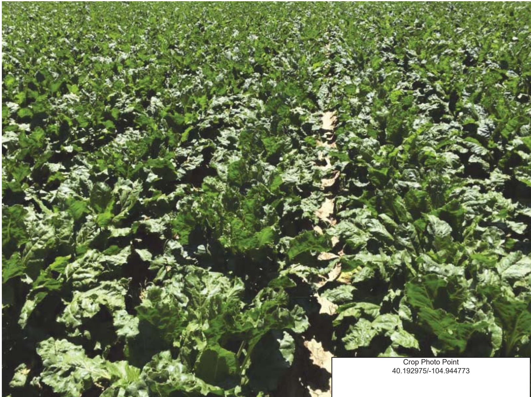
Crop Photo Point 40.192975/-104.944773