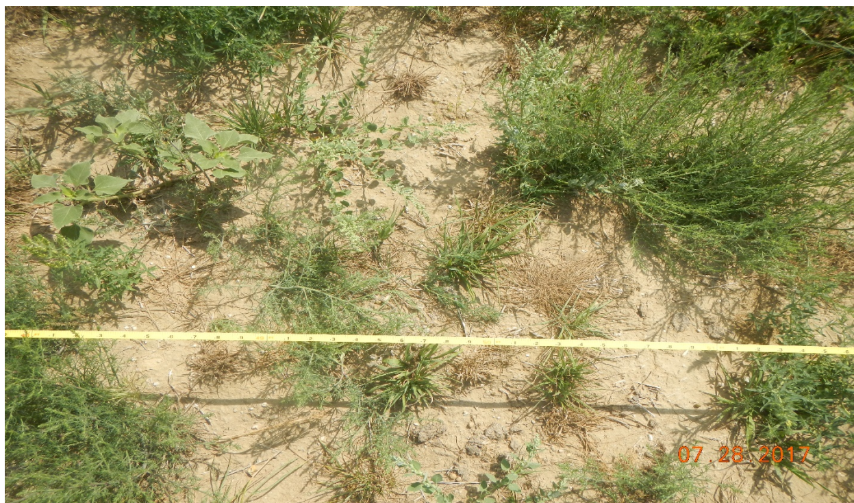
photo 2: Groundcover at the midpoint of vegetation transect at the location (Disturbed).