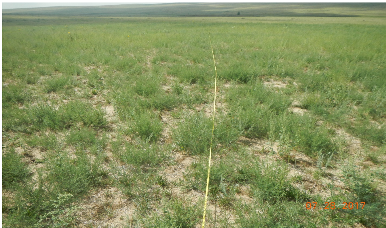
photo 3: Facing north at the end of vegetation transect at the location (Disturbed).