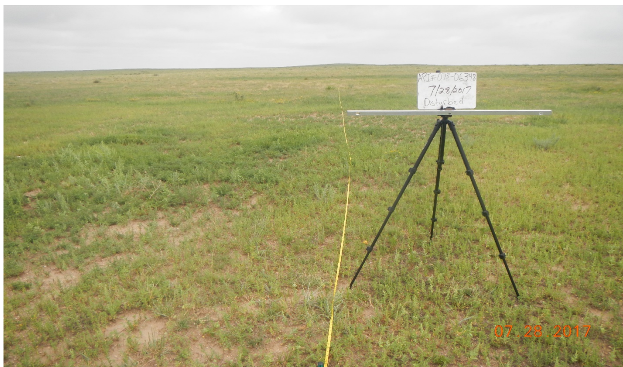
photo 1: Facing north at the beginning of vegetation transect at the location (Disturbed).