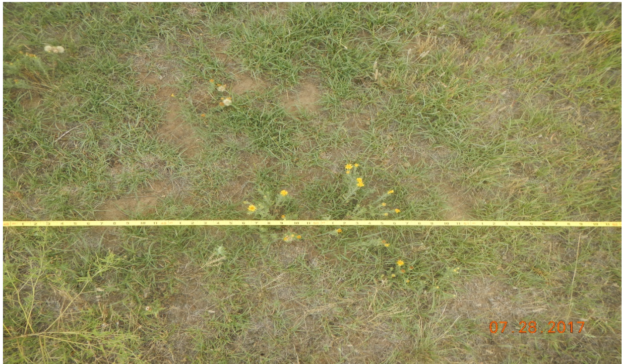
photo 5: Groundcover at the midpoint of vegetation transect off location (reference).