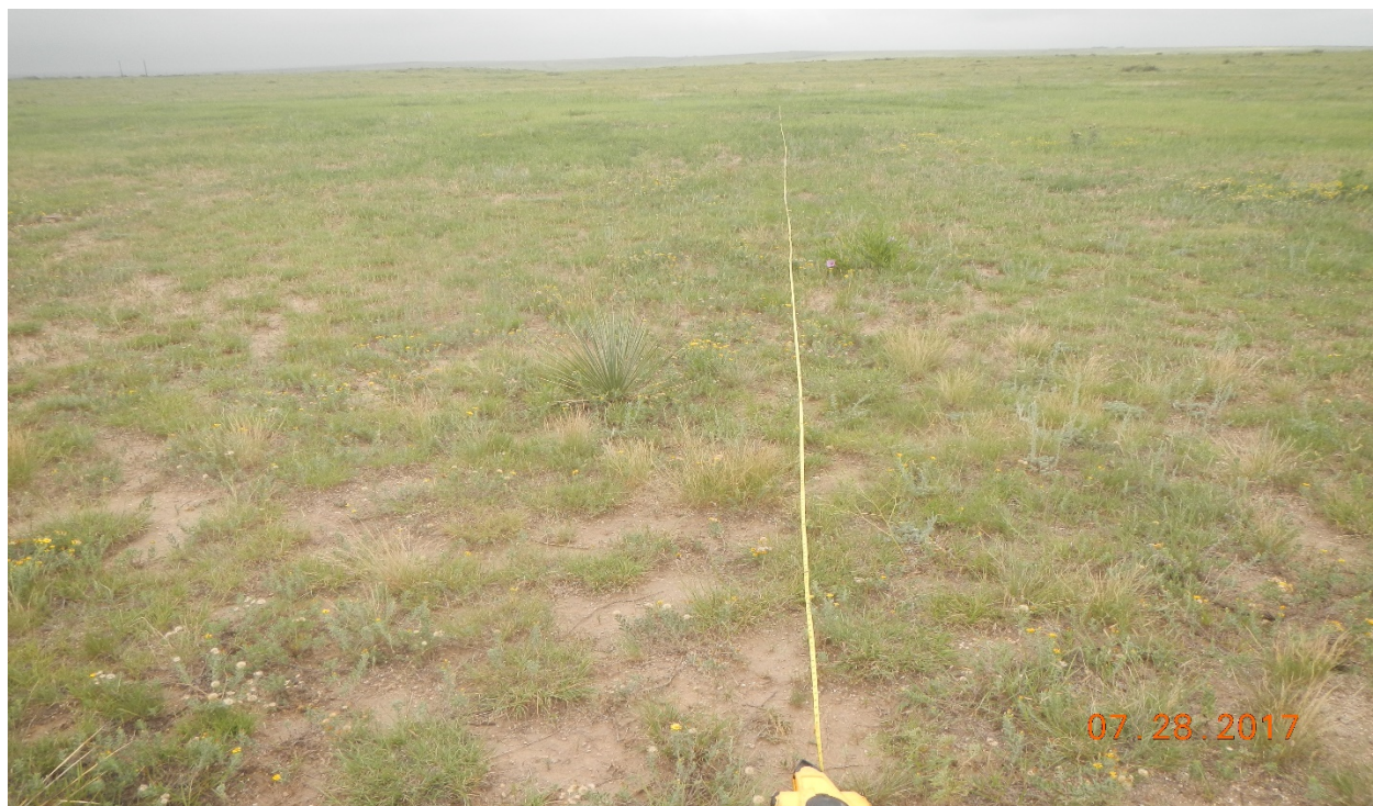
photo 3: Facing south at the end of vegetation transect at the location (Disturbed).