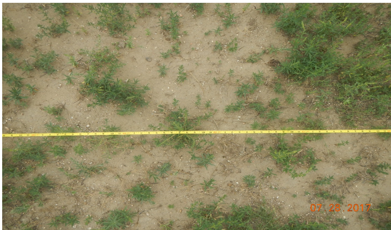
photo 2: Groundcover at the midpoint of vegetation transect at the location (Disturbed).