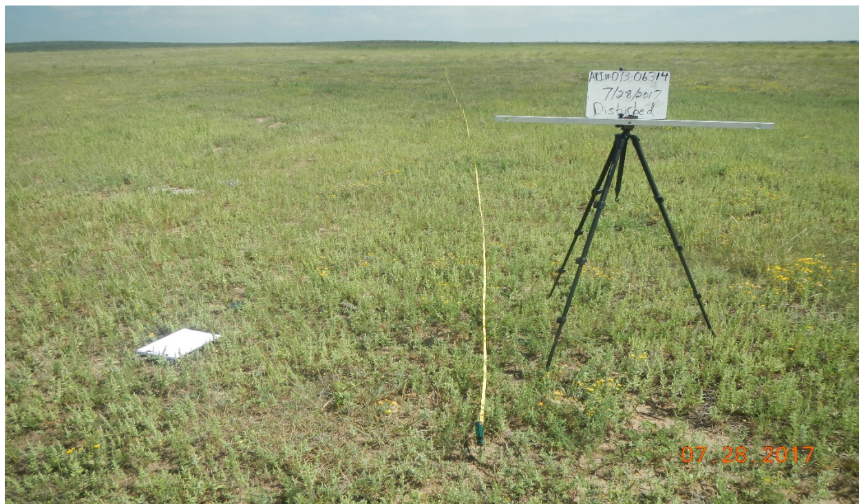
photo 1: Facing north at the beginning of vegetation transect at the location (Disturbed).