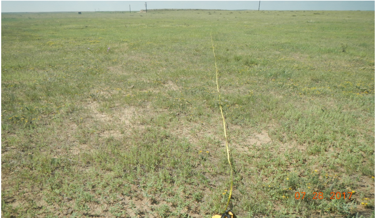
photo 3: Facing south at the end of vegetation transect at the location (Disturbed).