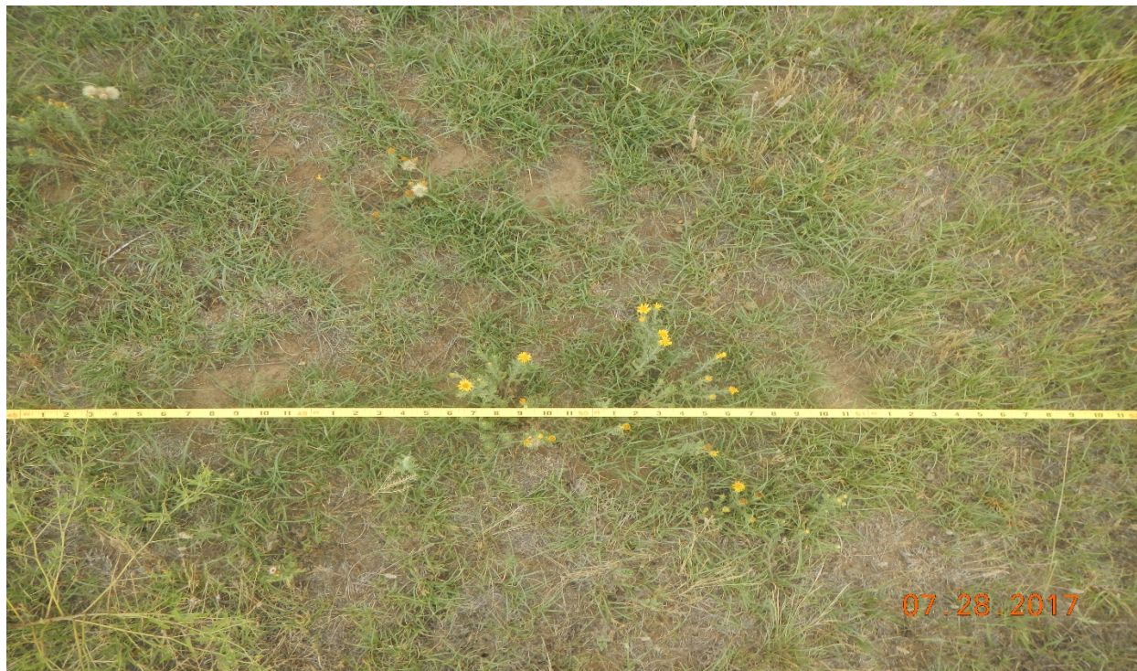
photo 5: Groundcover at the midpoint of vegetation transect off location (reference).