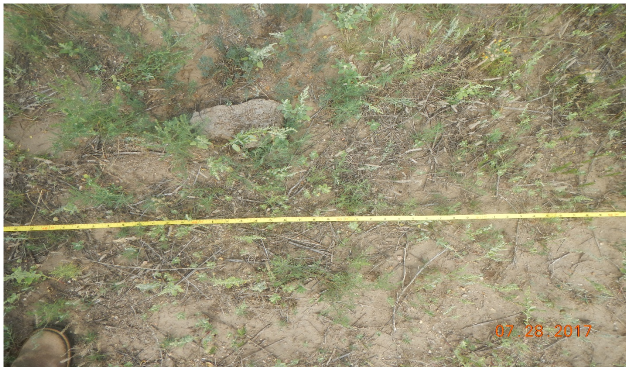
photo 2: Groundcover at the midpoint of vegetation transect at the location (Disturbed).