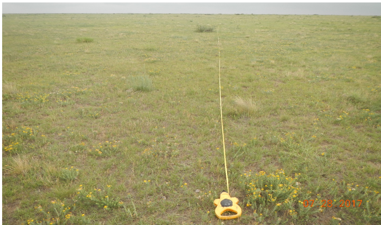
photo 6: Facing northeast at the end of vegetation transect off location (reference).