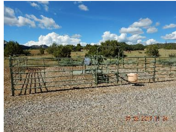
Photo 2: Produced water tank with labels and signage not visible from outside containment.