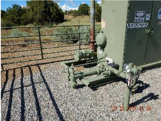
Photo 5: View of 1" line out of separator cabinet that ties into 1" to 2" swedge and into 2" line into ground.