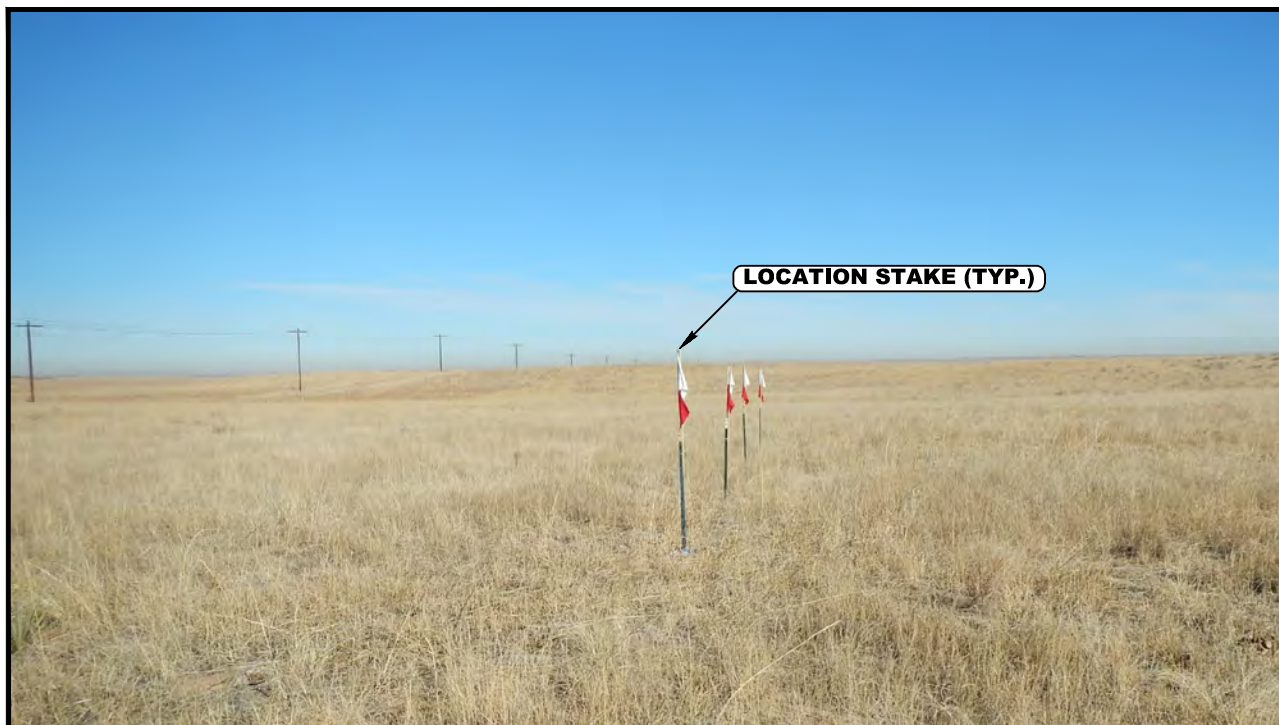
PHOTO: VIEW OF LOCATION STAKES