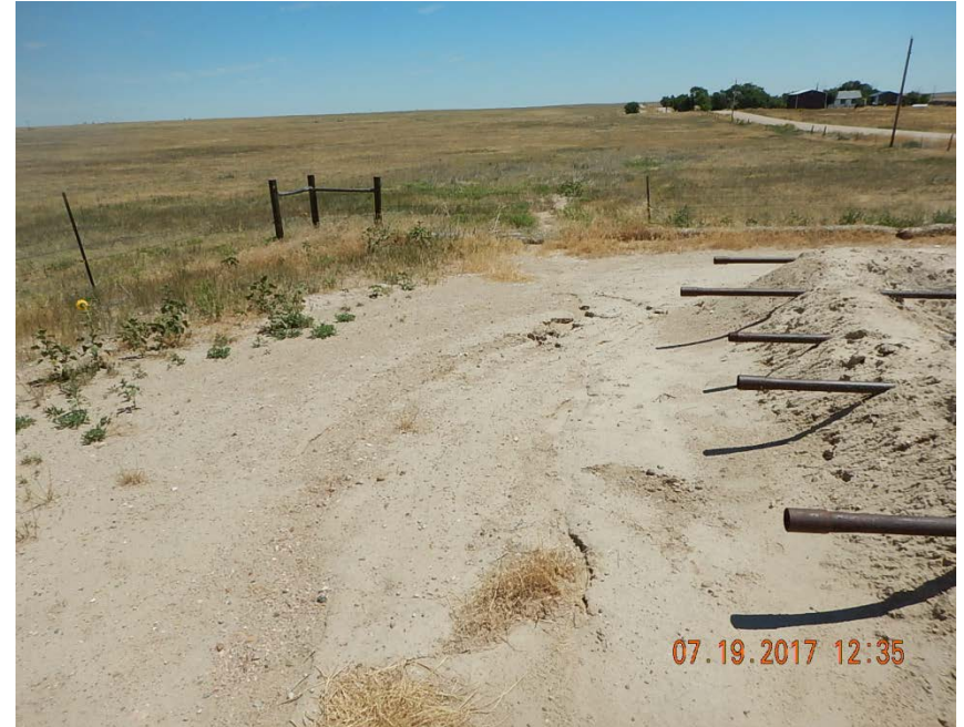
Photo 11: Stormwater erosion on N side of pit. Waddles put in place at NE corner of facility