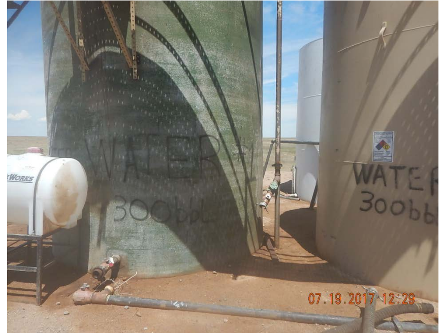
Photo 5: W tank (left) lacking placarding, E tank (right) now placarded