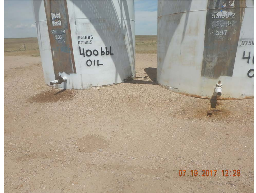
Photo 3: Stained soil at crude oil loadouts. E tank (right) is actively leaking