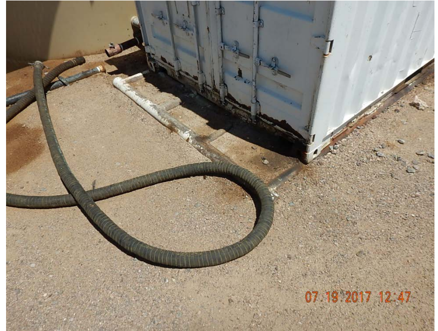
Stained soil at SW corner of pump house, unused equipment