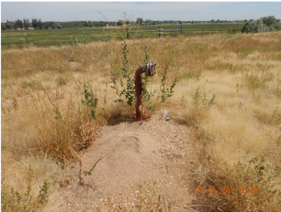
Photo 3: Photo taken from the former battery location. Photo shows riser remaining at location. COGCC rule 1004.a requires operator to remove all debris, abandoned gathering line risers, and flowline risers, and equipment within three months of plugging the associated facility. All work should have been conducted by 7/1/2008.