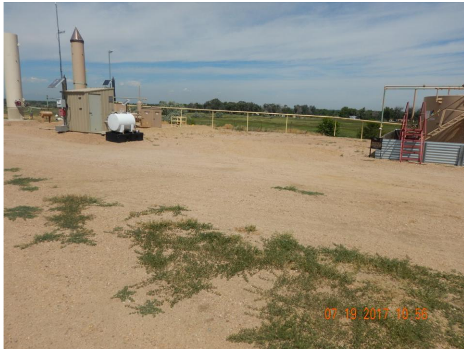
Photo 1: Photo taken from the well location, facing southwest. Photo shows the Dickens F-32 tank battery has been constructed at the well location.