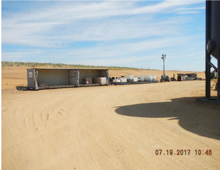
Photo 7 Chemical storage and secondary containment on north side of location from south