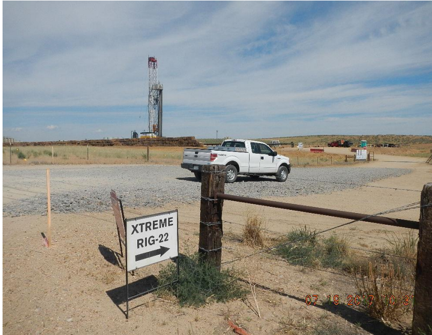
Photo 1 Signage, track pad at entrance from southeast