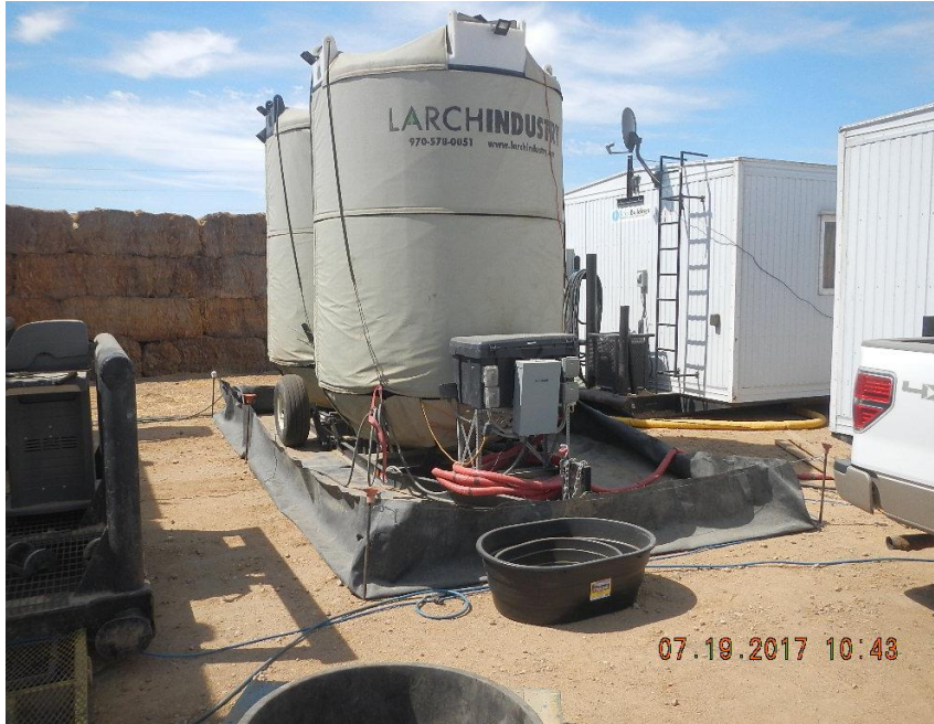
Photo 5 Septic and potable water with secondary containment from north