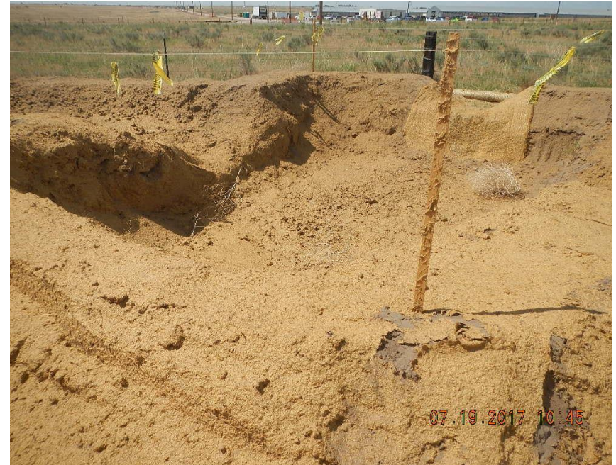
Photo 6 Sediment retention and hydro mulch on southwest corner of location from north