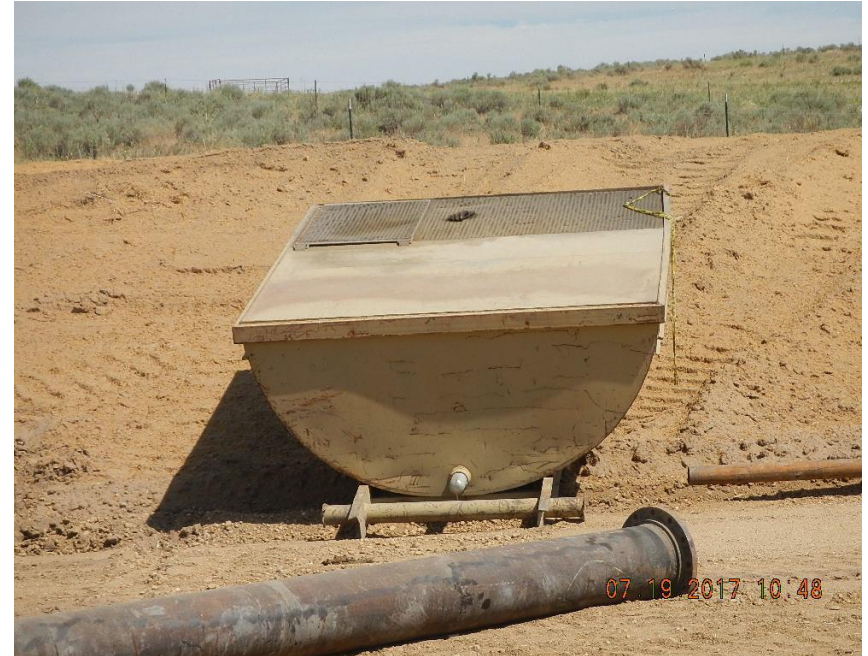
Photo 8 Cement cleanout apparatus.