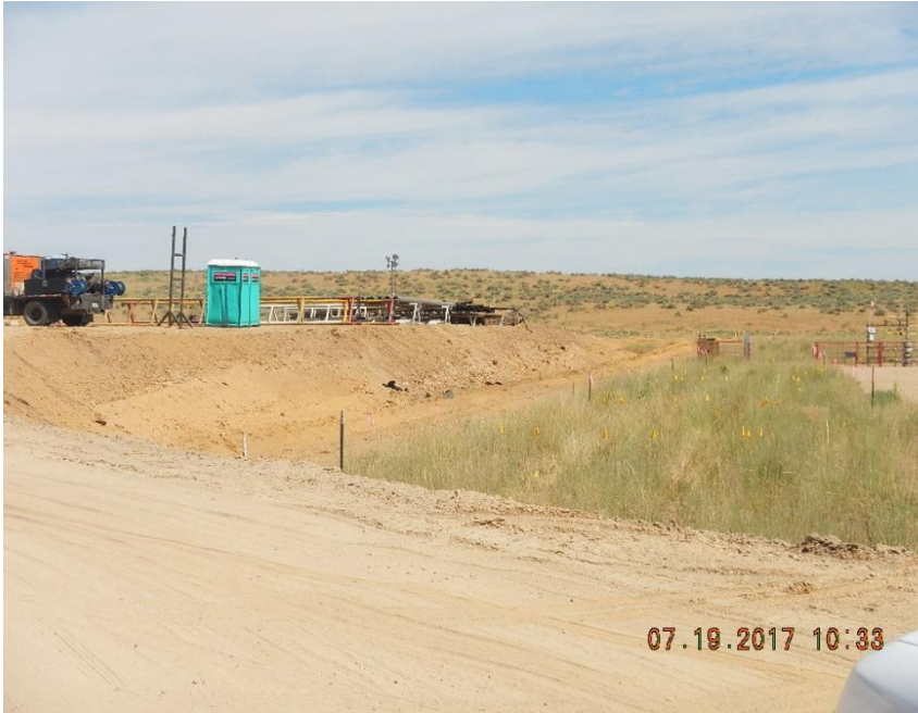
Photo 3 Fill and ditch on east side, photo from the south