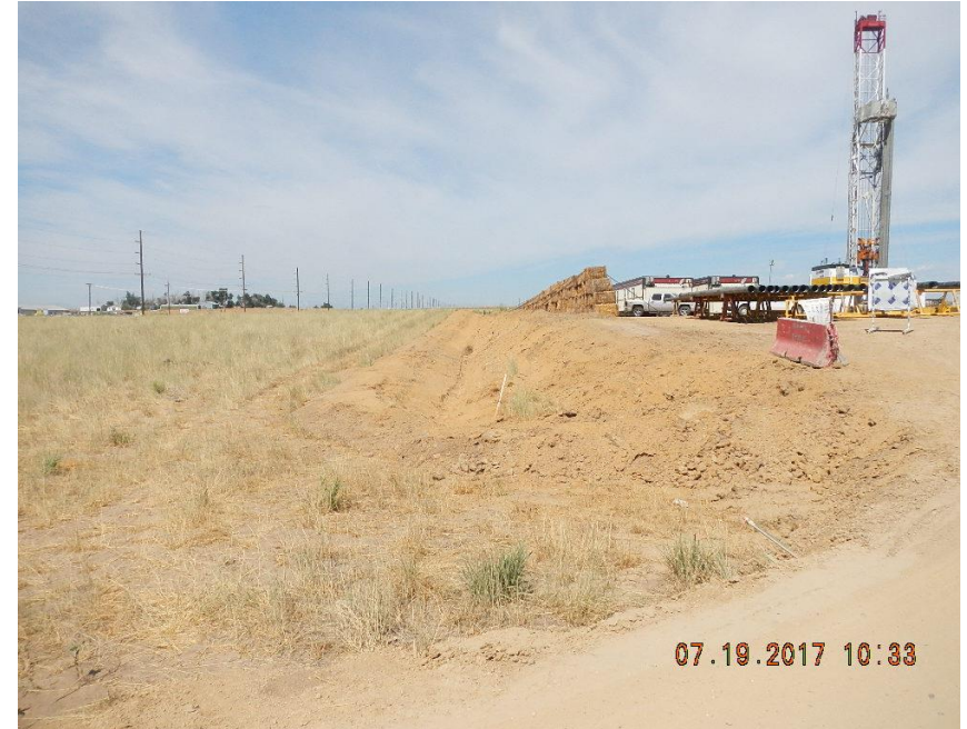
Photo 2 Ditch and hydro mulch at entrance from east