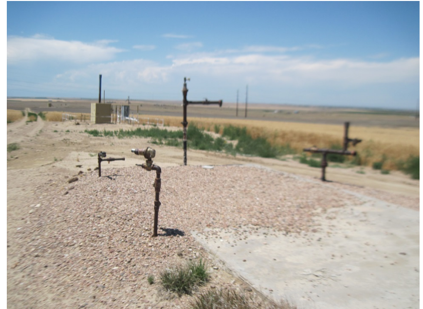
4 RISERS AT WELLHEAD NOT MARKED