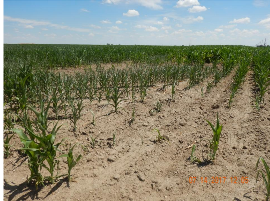
Photo 2: Photo taken from the battery location. Photo shows crop establishment is sparse and stunted when compared to the adjacent reference area.