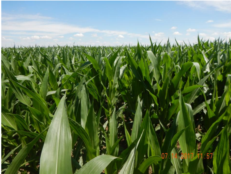
Photo 1: Photo taken from the well location, facing south. Photo shows vegetation over the reclamation area. Crop is uniform in distribution and height. Crop height is 6 feet in height or greater.