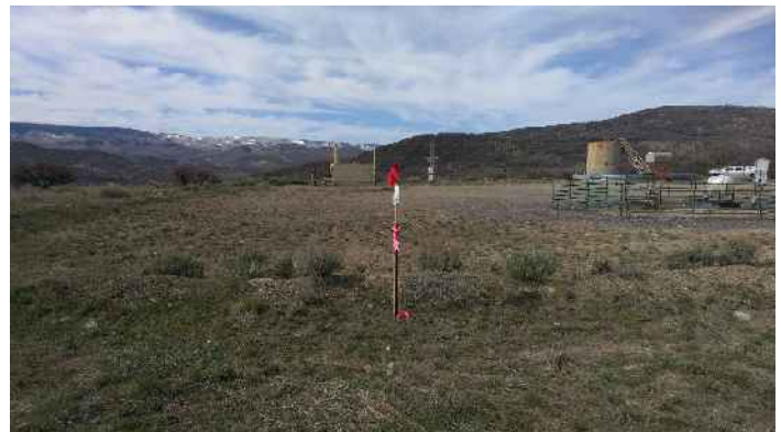
WELL LOCATION LOOKING WEST 4/18/2017