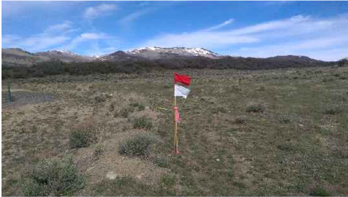
WELL LOCATION LOOKING NORTH 4/18/2017