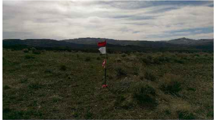
WELL LOCATION LOOKING SOUTH 4/18/2017