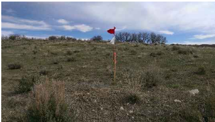
WELL LOCATION LOOKING EAST 4/18/2017