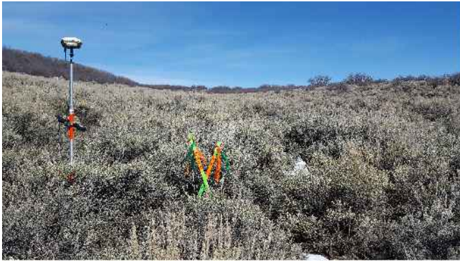
REFERENCE AREA LOOKING NORTH 3/17/2017