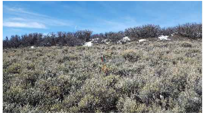
REFERENCE AREA LOOKING WEST 3/17/2017

REFERENCE AREA CENTER STAKE (DO NOT DISTURB) LATITUDE (NAD 83) NORTH 39.302881 DEG. LONGITUDE (NAD 83) WEST 107.722938 DEG.