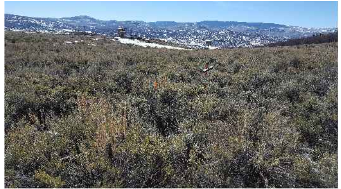
REFERENCE AREA LOOKING SOUTH 3/17/2017