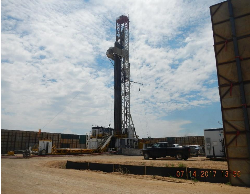
Photo 5 Rig from entrance from north east