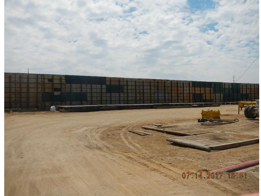
Photo 6 casing storage along south wall