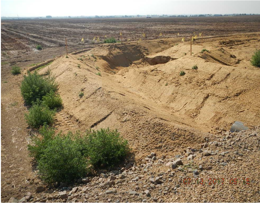
Photo 3 Storm water BMP's on northeast corner of location.