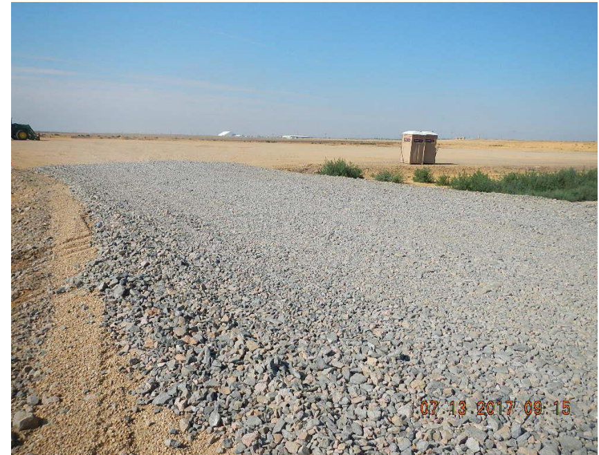
Photo 2 Entrance track pad from northeast