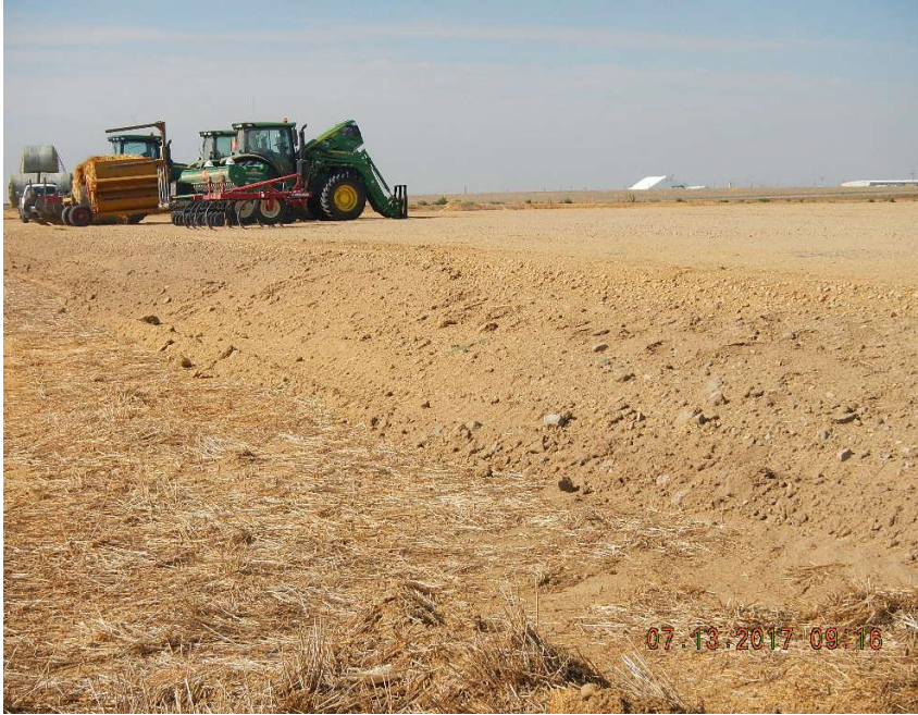
Photo 5 Cross section of fill from east approximate 4 ft thick