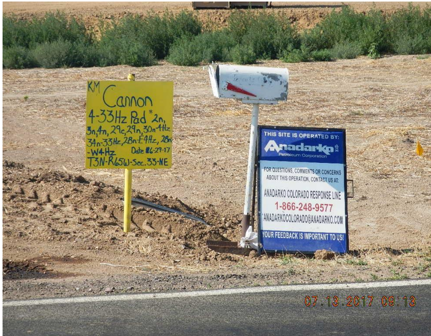
Photo 1 Location signage from north