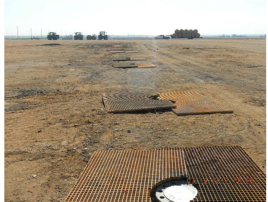
Photo 8 All wells from west side.