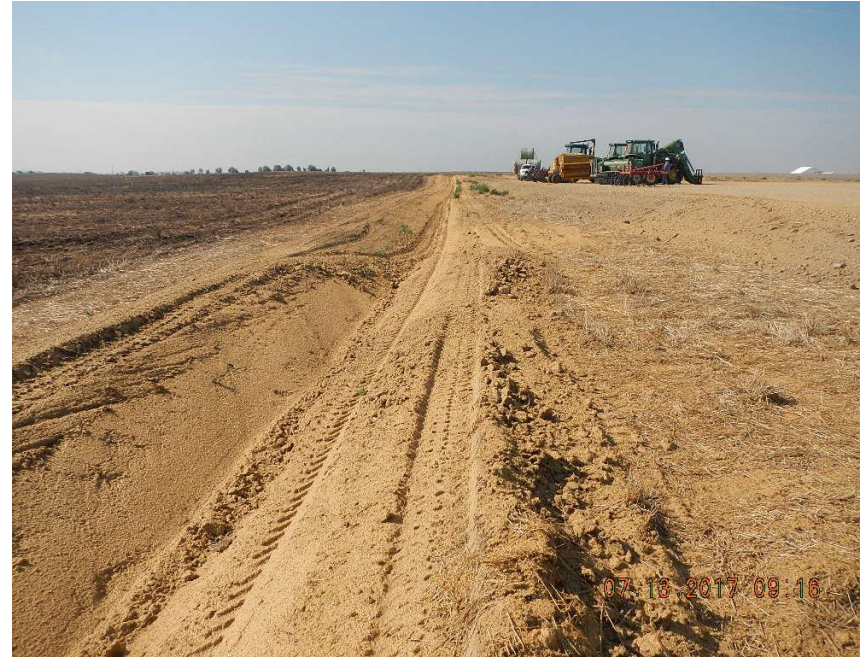
Photo 4 Ditch along east side of location from north