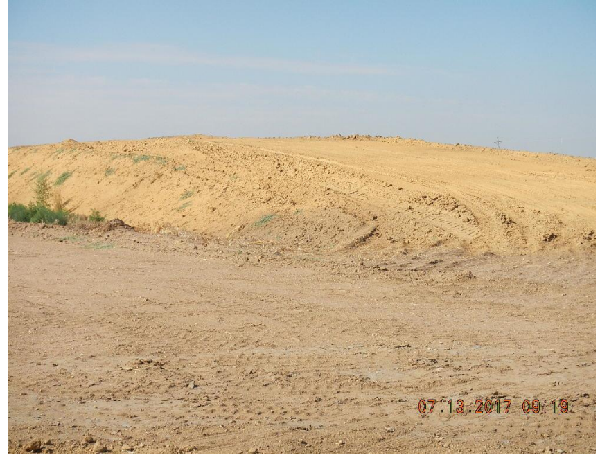
Photo 6 Top soil berm. NE corner GPS 40.18864, -140.67531 SW corner GPS 40.18750, -104.67548, approx. 15 ft thick