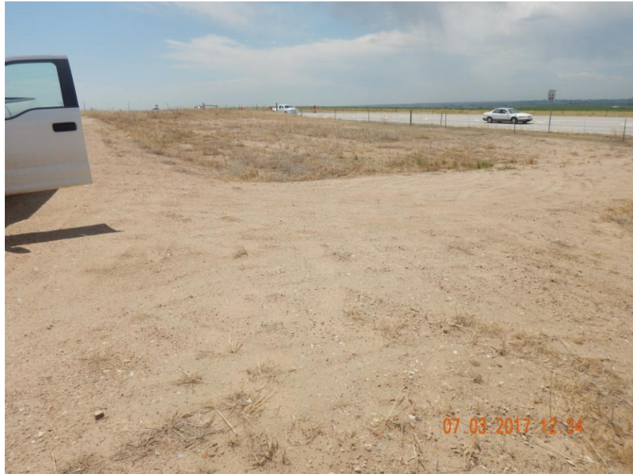
Photo 3: Photo taken from the battery location, facing southwest. Battery location has had facilities removed (except meter shed), however no other reclamation work appears to have been conducted .