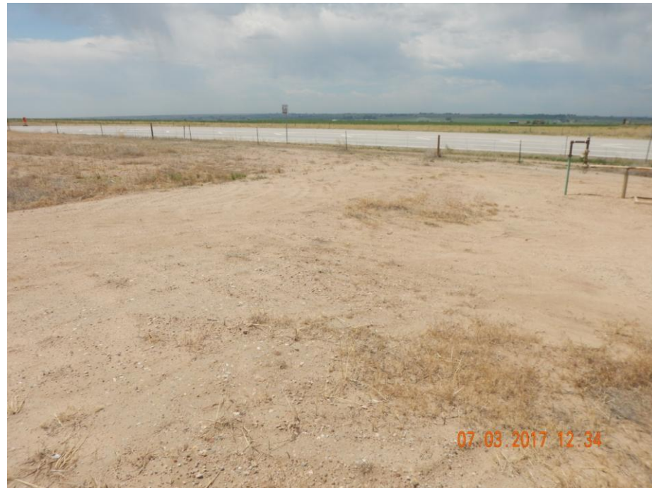
Photo 2: Photo taken from the battery location, facing west. Battery location has had facilities removed (except meter shed), however no other reclamation work appears to have been conducted