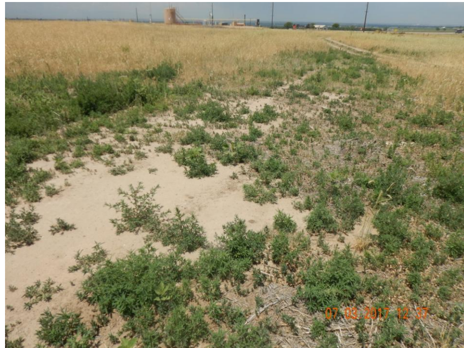
Photo 6: Photo taken from the well location facing northwest. Photo shows well does not appear to reflect the adjacent reference area (see photo 7), and remains unvegetated in areas, or with weedy undesirable plant species establishing.