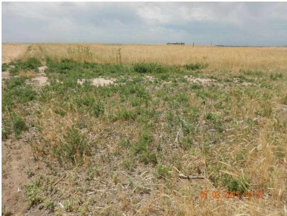
Photo 5: Photo taken from the well location facing west. Photo shows well does not appear to reflect the adjacent reference area (see photo 7 ), and remains unvegetated in areas, or with weedy undesirable plant species establishing.