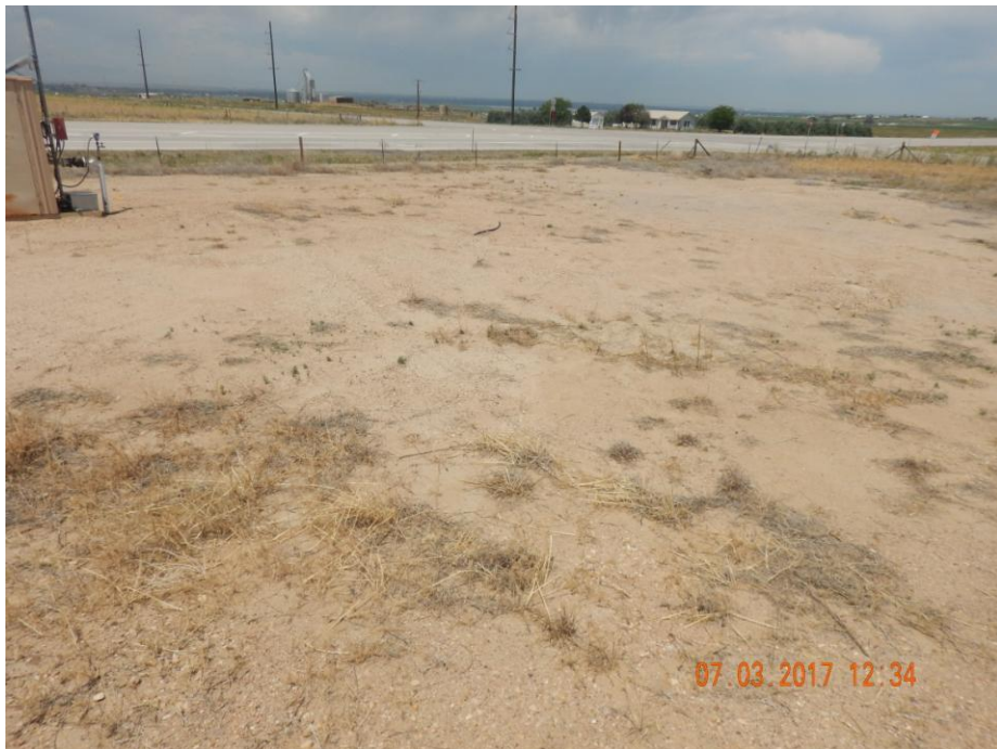
Photo 1: Photo taken from the battery location, facing northwest. Battery location has had facilities removed (except meter shed), however no other reclamation work appears to have been conducted