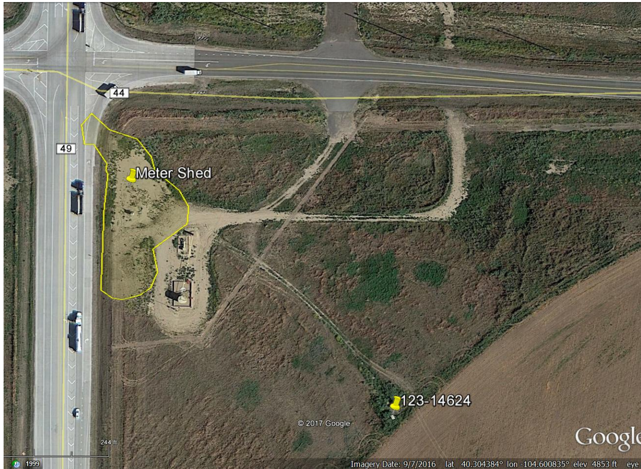
Photo 9: Current aerial imagery (2016). Photo shows that an additional tank battery facility (Broomfield battery) has been constructed, and that little reclamation work appears to have been conducted at the Freedom battery.