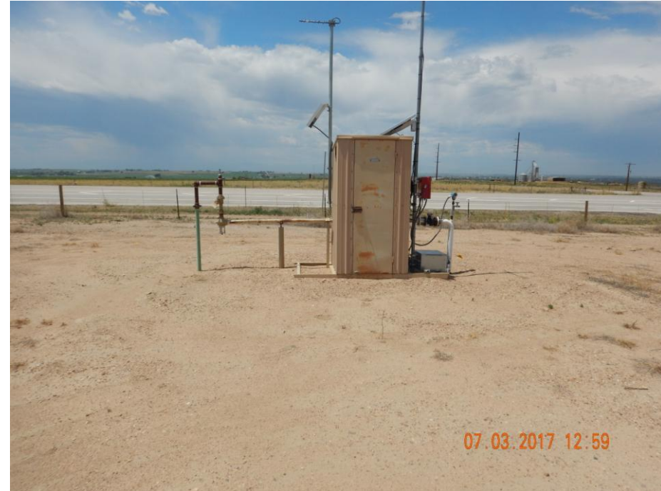
Photo 4: Photo taken from the battery location. Photo shows meter shed remaining on location. "Freedom Two C" was written on the inside of the door.