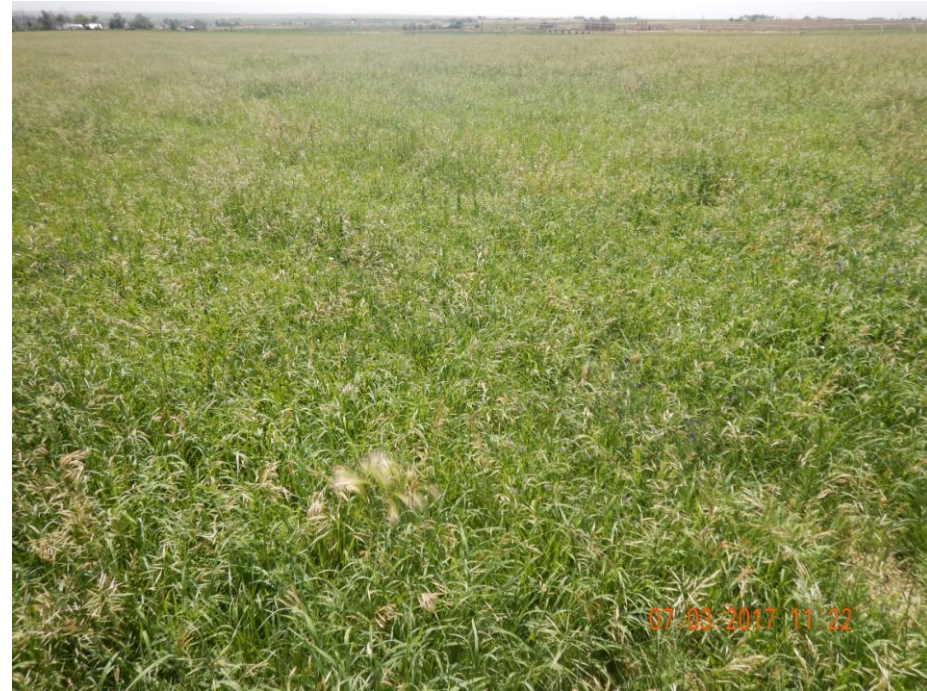
Photo 6: Photo taken from the adjacent reference area. Reference area is a irrigated hay meadow composed predominantly of perennial grass.