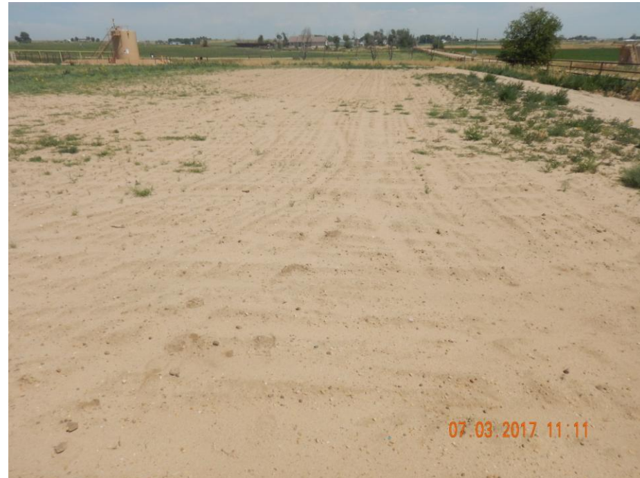
Photo 2: Photo taken from the battery location southeast of the well, facing north. Photo shows battery location remains bare and exposed soil. Battery requires stabilization.