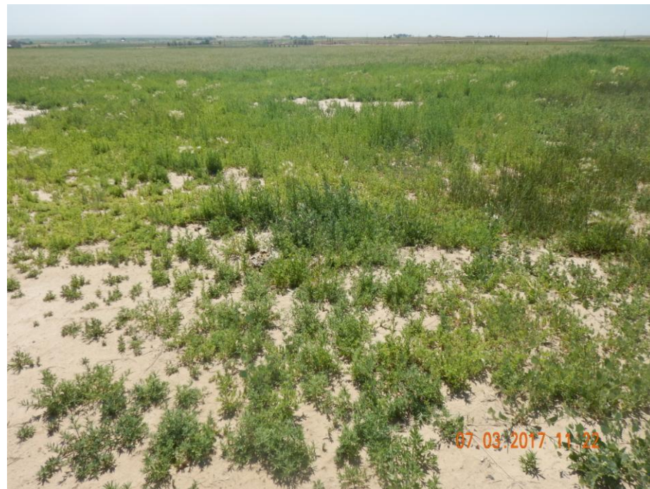
Photo 4: Photo taken from the well location, facing northeast. Photo shows vegetation over the reclamation area has not achieved a uniform cover and does not appear to be progressing to 80% cover to that of the reference.