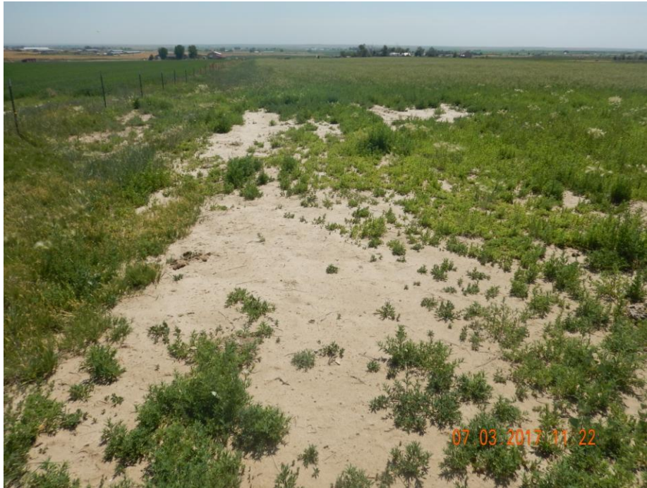
Photo 5: Photo taken from the well location, facing east. Photo shows vegetation over the reclamation area has not achieved a uniform cover and does not appear to be progressing to 80% cover to that of the reference.