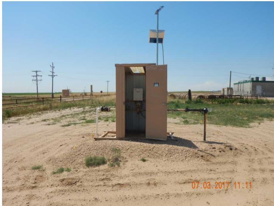
Photo 1: Photo taken from the battery location southeast of the well, facing south. Photo show meter shed remains on location.