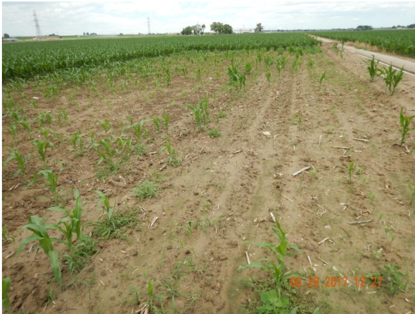
Photo 1. Photo taken from the southern well location, facing North. Disturbance area (~45' x 100') is not reflective of reference vegetative crop conditions, as the crop height and density are negatively affected.