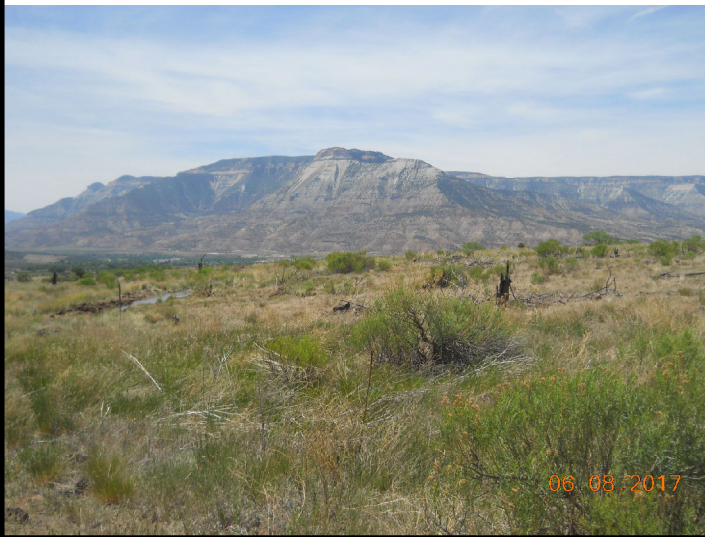
BMC F Looking West