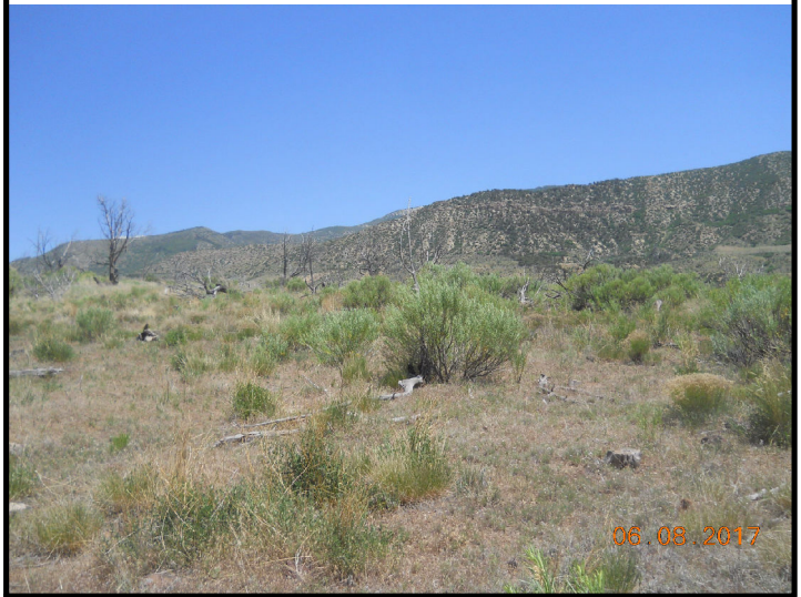
BMC F Looking East