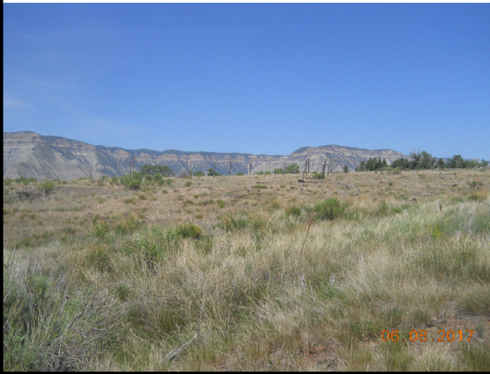
BMC F Looking North