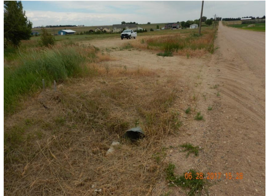
Photo 3. Photo taken from the western entrance of the battery location where a culvert remains, facing East. Other culverts are still in place but may need to remain for an access point to a road that appears to be used by the surface owner. Refer to the Photo 1.