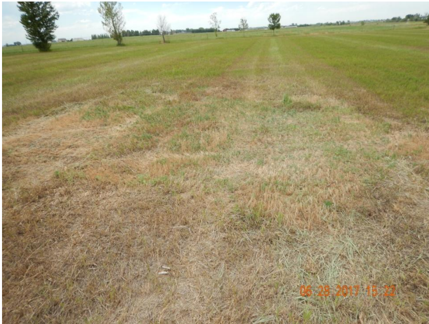
Photo 4. Photo taken from the approximate well location, facing North. Well location and the portion of the access road that traveled west off the main access road appears representative of reference areas, except for a 10' x 10' area.