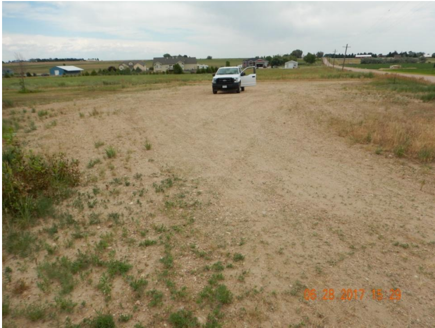
Photo 2. Photo taken from the western battery location, facing East. Battery location has not been reclaimed per Rule 1004.