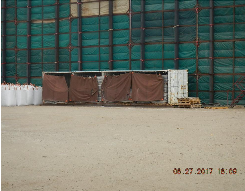
Photo 5 Chemical storage in covered conex with curtain wall on south side of drilling pad from the north