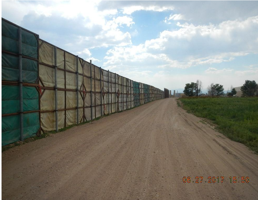
Photo 3 Sound wall along access road on south side of location from east.