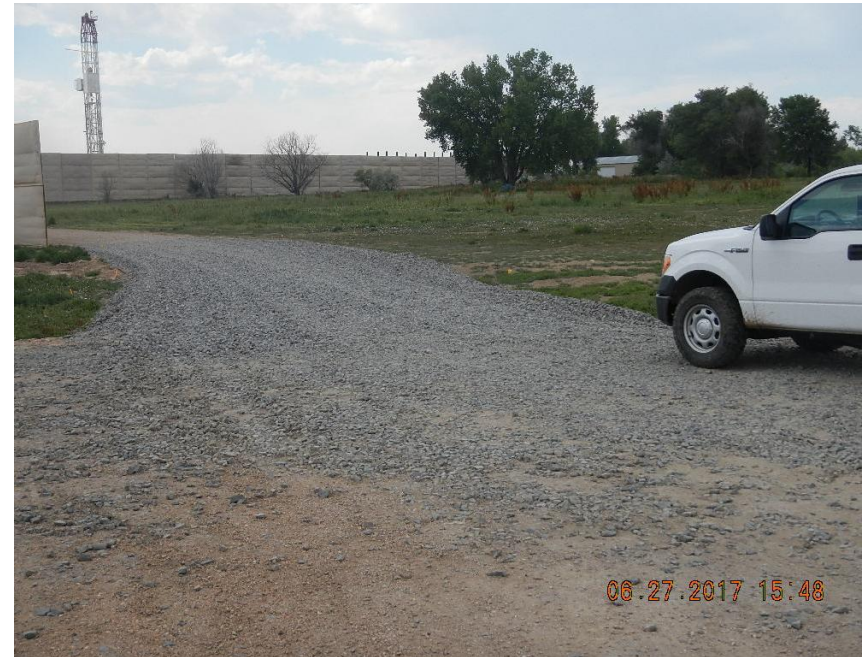
Photo 2 Track pad at entrance from east