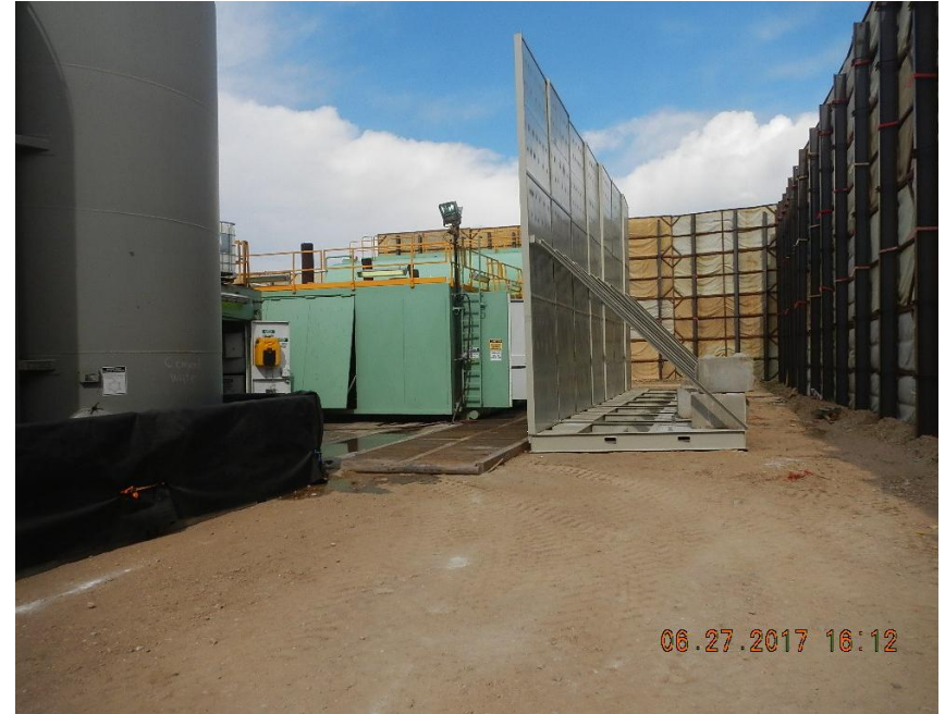
Photo 6 Interior sound suppression panel next to generators from west