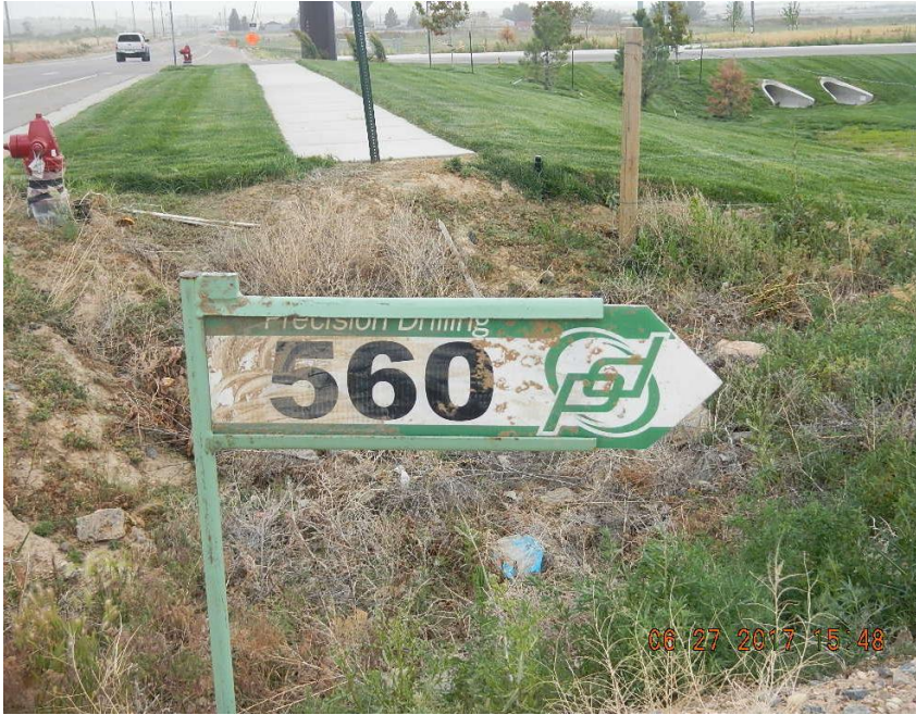
Photo 1 Rig Signage at County Road 21 from east