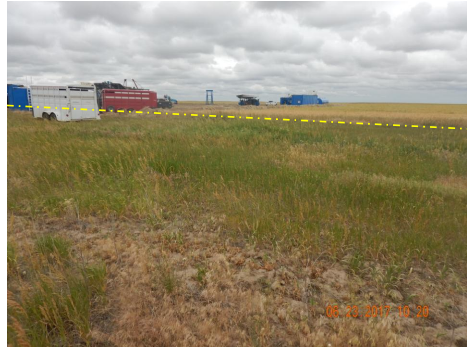
Photo 18: Photo taken from the southeast of the location, facing north. Yellow line indicates the approximate border between the North and Southern ½ of section 30. Washington County Assessor indicated that the North half of section 30 is owned by the surface owners listed in the 2A, however the southwest ¼ of section 30 is listed under a surface owner not on the 2A. It appears operator is parking equipment/disturbing a separate surface owner's property. This issue is being forwarded to OGLA