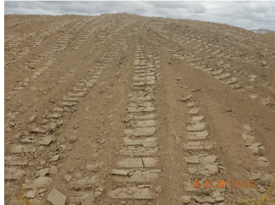
Photo 4: Photo taken from the west end of the location. Photo shows topsoil piles have been insufficiently tracked.