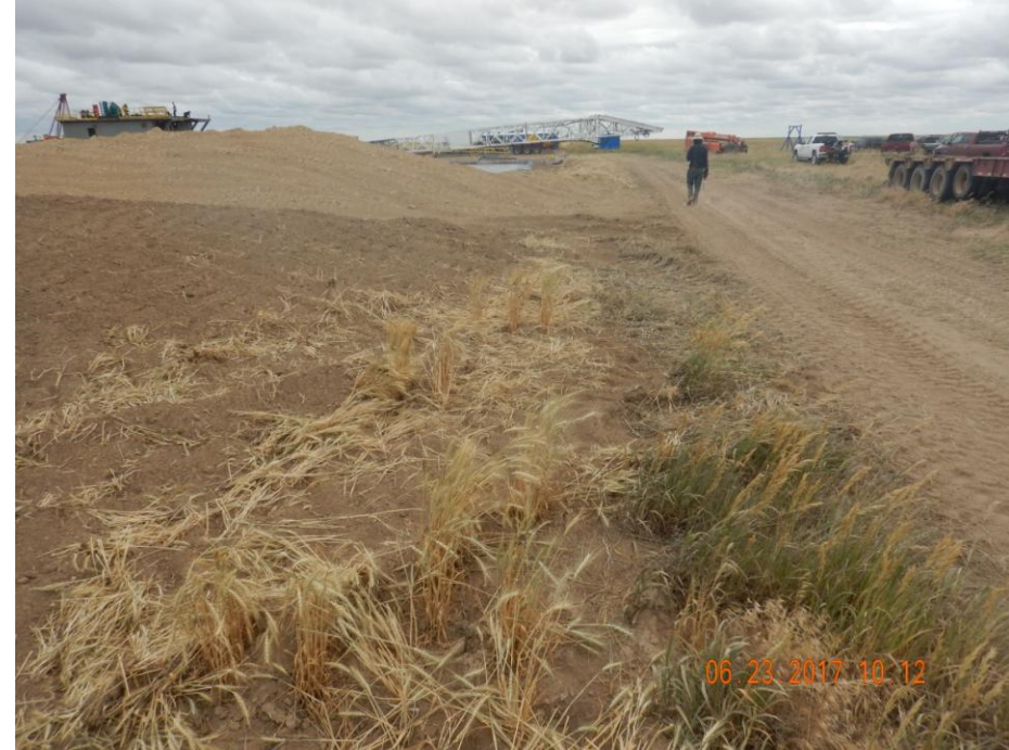
Photo 2: Photo taken from the southwest end of the location, facing east.