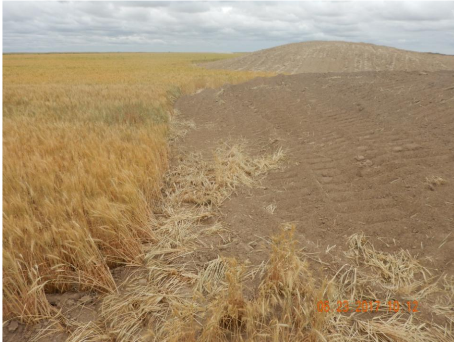
Photo 1: Photo taken from the southwest end of the location, facing north. Photo shows topsoil stockpiles on the west end of the location. Photo also shows perimeter stormwater and sediment BMP controls have not been implemented.