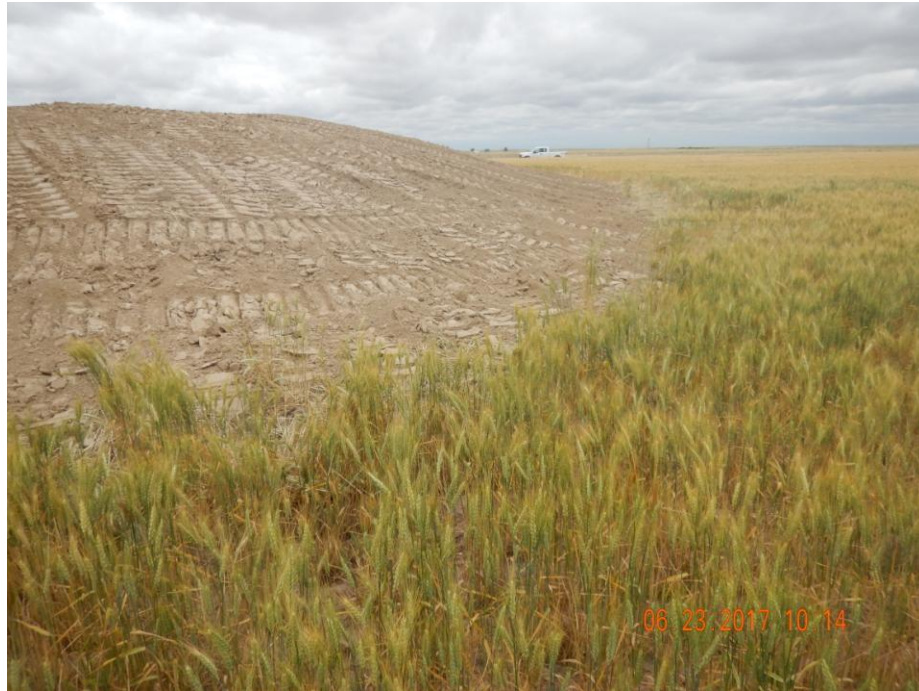
Photo 5: Photo taken from the northwest end of the location, facing south. Photo shows topsoil stockpiles on the west end of the location . Photo also shows perimeter stormwater and sediment BMP controls have not been implemented.