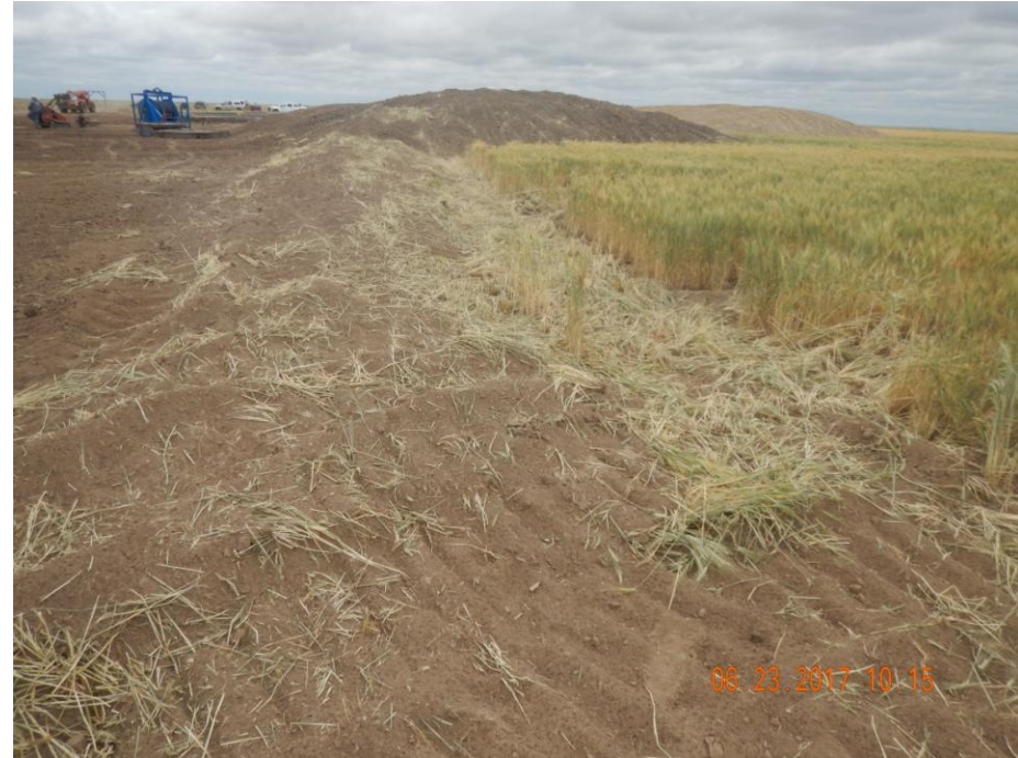
Photo 8: Photo taken from the north end of the location, facing south. Photo shows perimeter stormwater and sediment BMP controls have not been implemented.