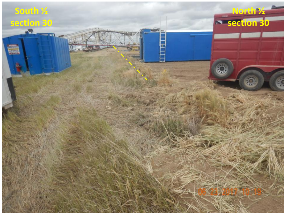
Photo 15: Photo taken from the southeast end of the location, facing west. Photo shows equipment being stored off location. Access road (yellow line) appears to straddle the North and Southern 1/2 of section 30. Washington County Assessor indicated that the North half of section 30 is owned by the surface owners listed in the 2A, however the southwest 1/4 of section 30 is listed under a surface owner not on the 2A. It appears operator is parking equipment/disturbing a separate surface owner's property. This issue is being forwarded to OGLA