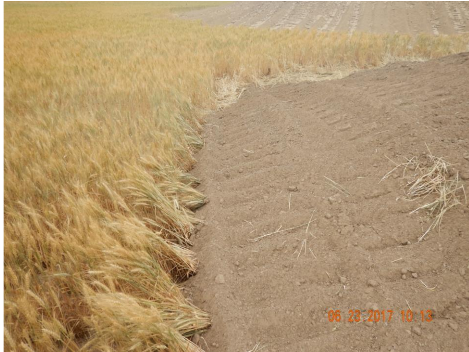
Photo 3: Photo taken from the west end of the location. Photo shows topsoil stockpiles on the west end of the location. Photo also shows perimeter stormwater and sediment BMP controls have not been implemented.