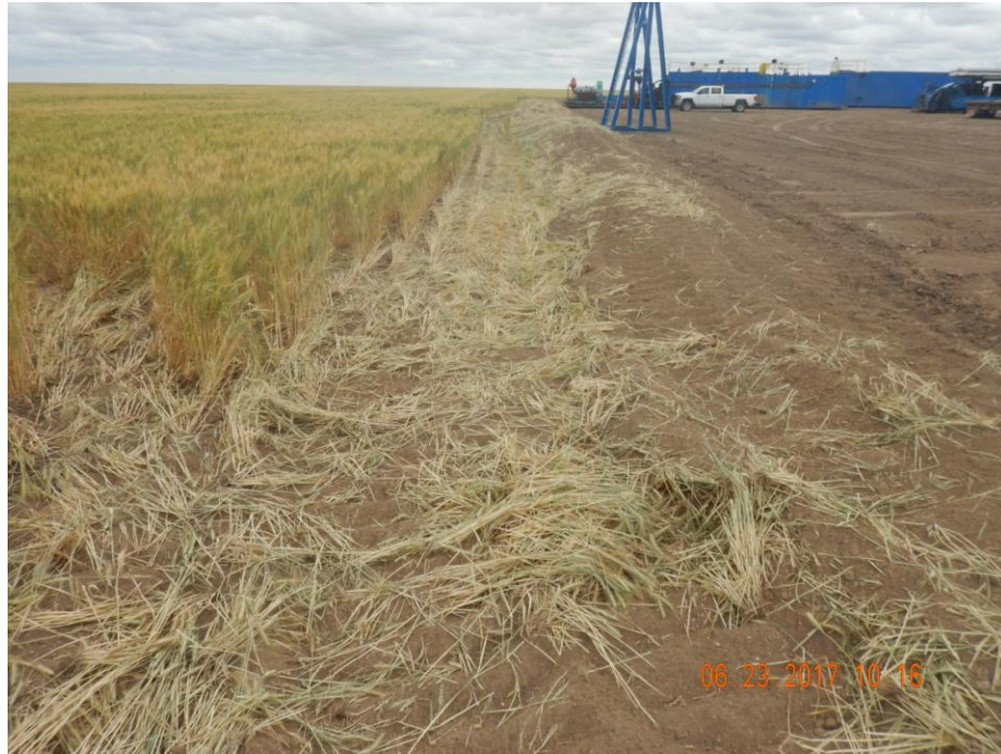
Photo 9: Photo taken from the north end of the location, facing east. Photo shows berm that appears to be sufficiently consolidated.