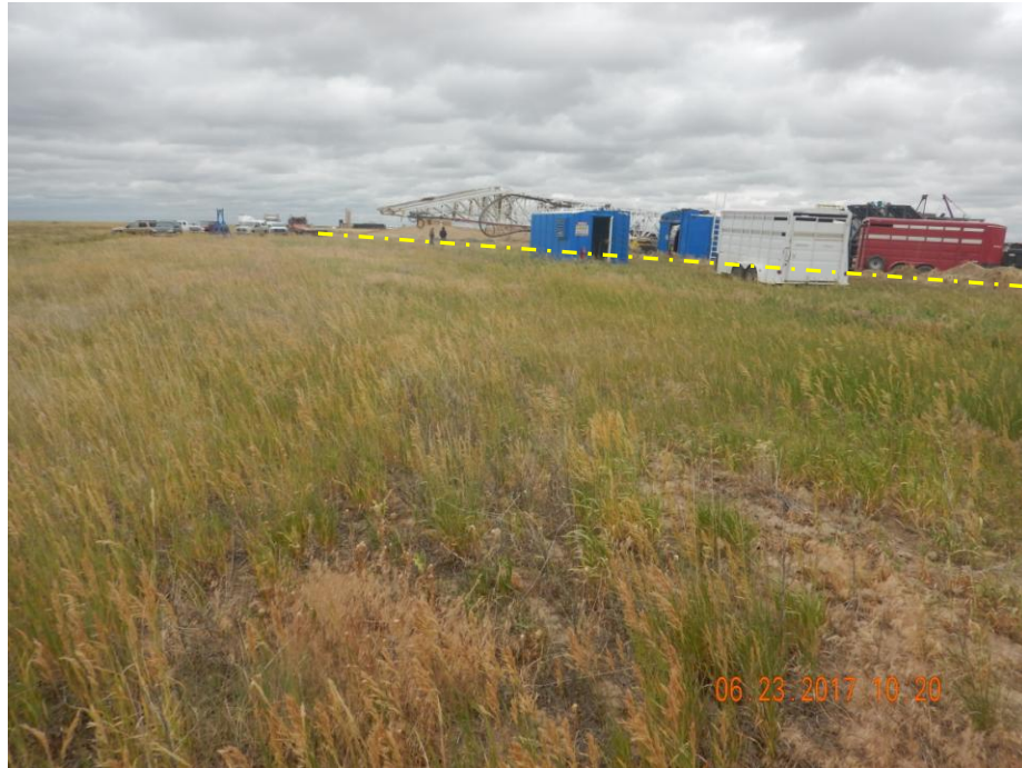
Photo 17: Photo taken from the southeast of the location, facing north west. Photo shows equipment and vehicles parked off location. Yellow line indicates the approximate border between the North and Southern ½ of section 30. Washington County Assessor indicated that the North half of section 30 is owned by the surface owners listed in the 2A, however the southwest ¼ of section 30 is listed under a surface owner not on the 2A. It appears operator is parking equipment/disturbing a separate surface owner's property. This issue is being forwarded to OGLA