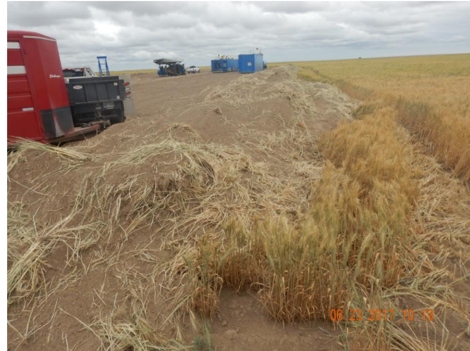
Photo 14: Photo taken from the southeast end of the location, facing north. Photo shows berm constructed on the eastern perimeter of the location. Berm has not been constructed with good engineering practices; berm has not been sufficiently consolidated and not in proper functioning conduction.