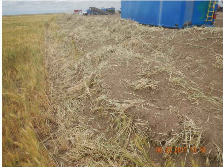
Photo 13: Photo taken from the north end of the location, facing south. Photo shows berm constructed on the eastern perimeter of the location. Berm has not been constructed with good engineering practices; berm has not been sufficiently consolidated and not in proper functioning conduction.