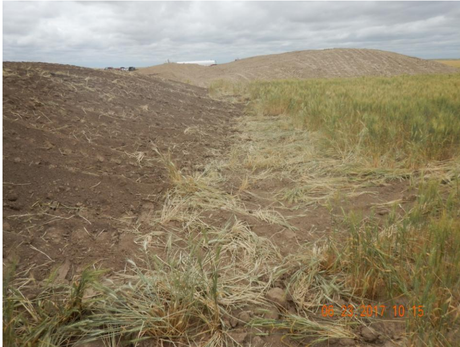
Photo 7: Photo taken from the north end of the location, facing southwest. Photo shows perimeter stormwater and sediment BMP controls have not been implemented.