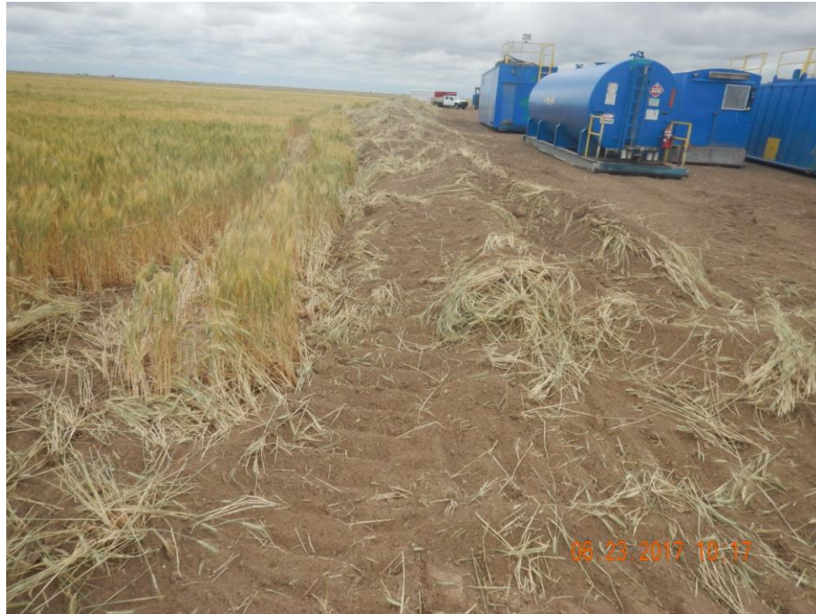
Photo 11: Photo taken from the northeast end of the location, facing south. Photo shows berm constructed on the eastern perimeter of the location. Berm has not been constructed with good engineering practices; berm has not been sufficiently consolidated and not in proper functioning conduction.