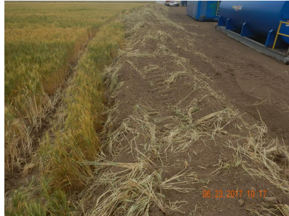
Photo 12: Photo taken from the northeast end of the location, facing south. Photo shows berm constructed on the eastern perimeter of the location. Berm has not been constructed with good engineering practices; berm has not been sufficiently consolidated and not in proper functioning conduction.