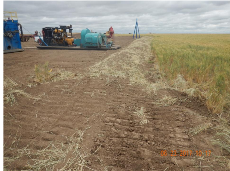
Photo 10: Photo taken from the northeast end of the location, facing west. Photo shows berm that appears to be sufficiently consolidated.