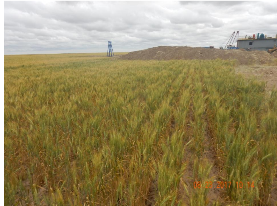
Photo 6: Photo taken from the northwest end of the location, facing east. Photo shows perimeter stormwater and sediment BMP controls have not been implemented.