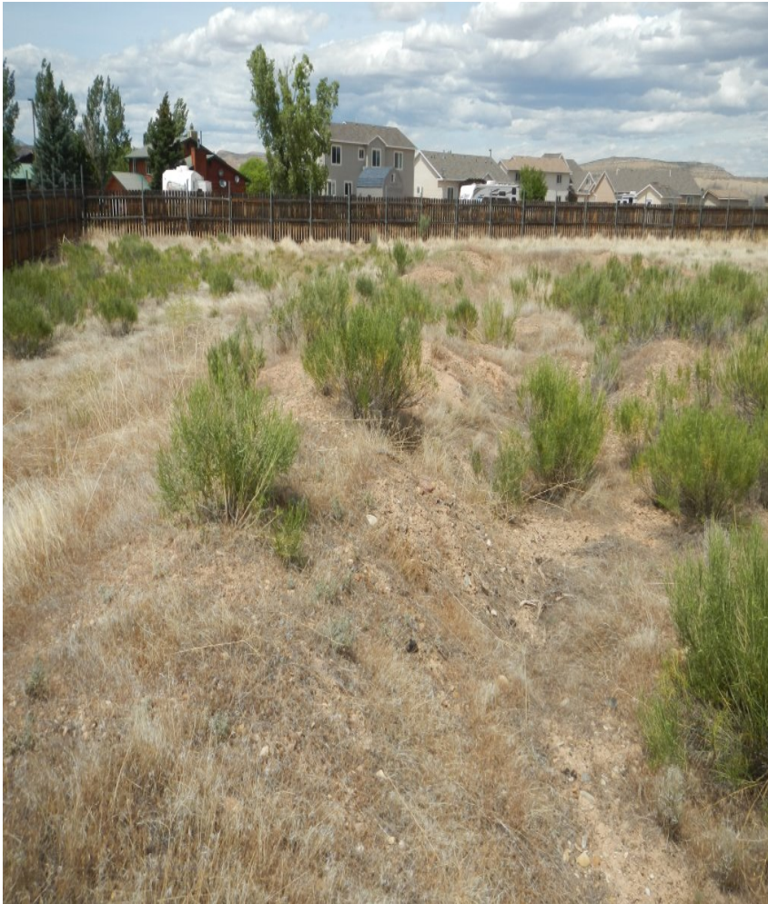
Photo#13: Bermed area that may have housed Tanks in NW corner of Location