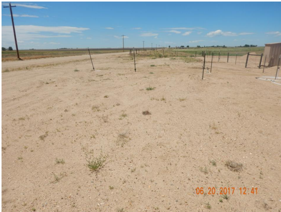
Photo 7: Photo taken from the battery location, facing west. Photo shows stakes for active monitoring wells. Active remediation project on battery in process.