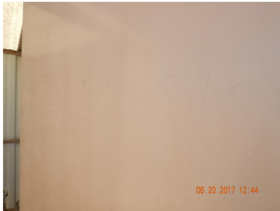
Photo 10: Photo of the inside door of the meter shed. Becker 5-1 , 15, written on door.