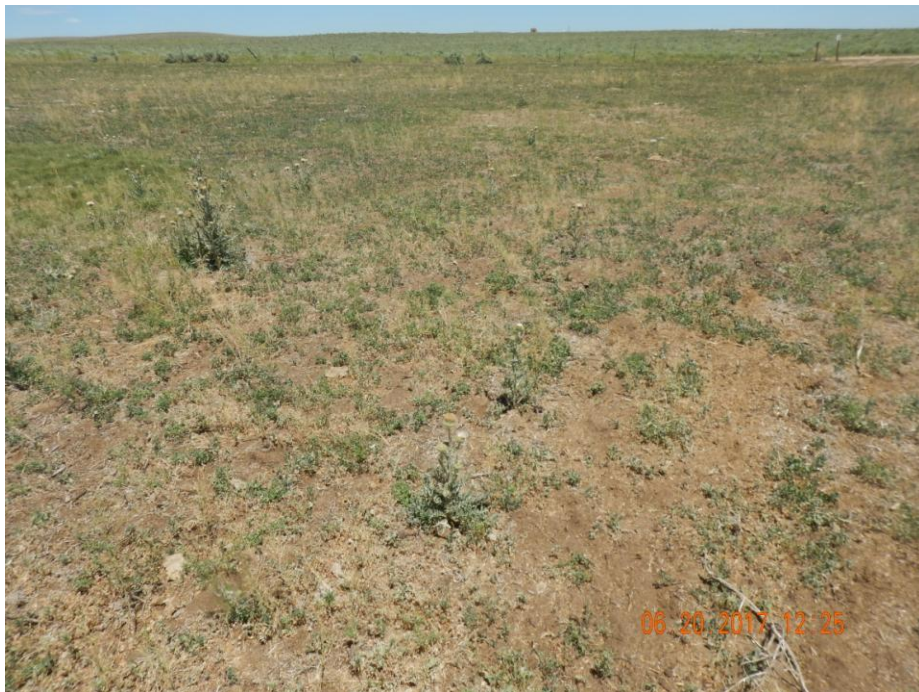
Photo 1: Photo taken from the well location, facing north. Photo shows vegetation over the reclamation area.