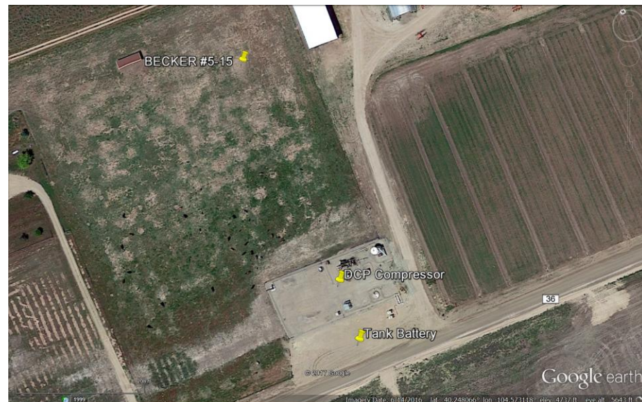
Photo 6: Current (2016) aerial imagery. Photo shows facilities, except for the two meter sheds, have been removed. Note DCP operates a compressor station to the immediate north end of the PDC Becker 5-1 tank battery.