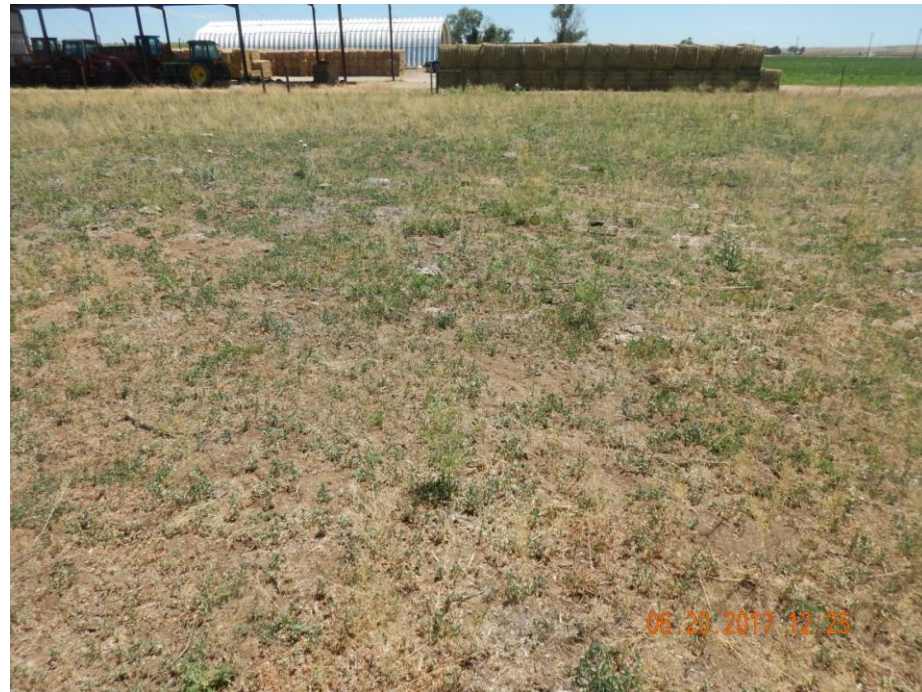
Photo 2: Photo taken from the well location, facing east. Photo shows vegetation over the reclamation area.