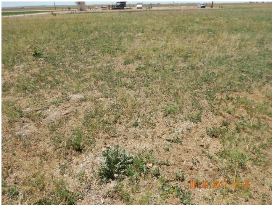
Photo 3: Photo taken from the well location, facing south. Photo shows vegetation over the reclamation area.