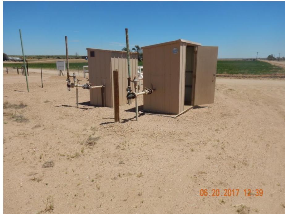
Photo 8: Photo taken from the battery location, facing east. Photo shows two (2) meter sheds remaining. These need to be removed per reclamation requirements, and per the May 2, 2017 Flowline/Pipeline/Riser NTO