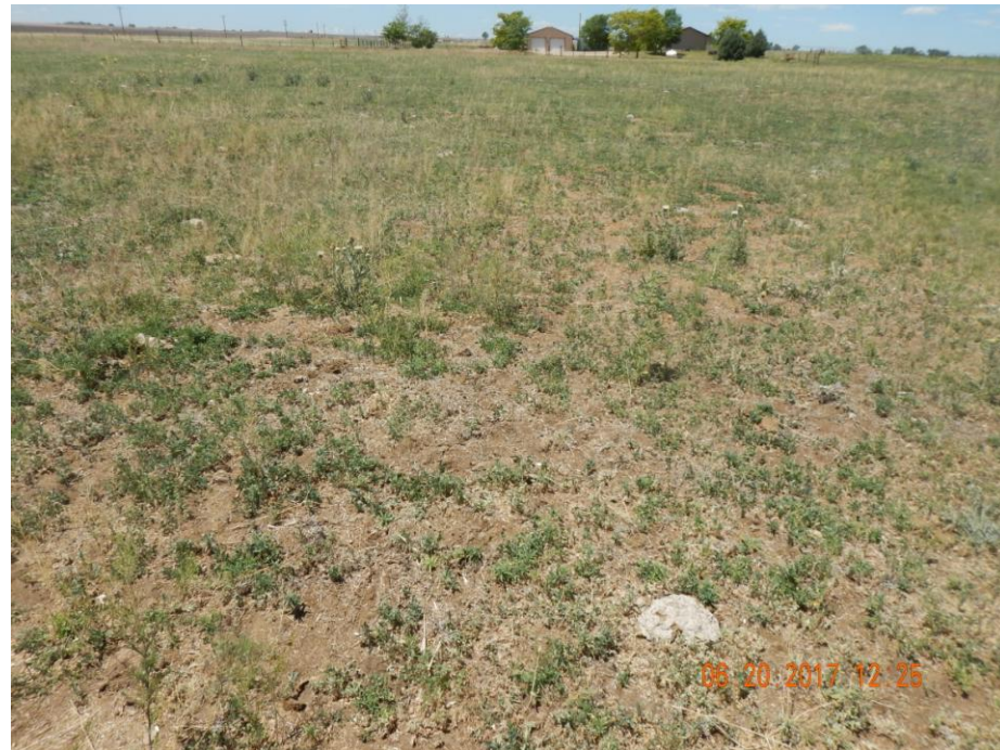
Photo 4: Photo taken from the well location, facing west. Photo shows vegetation over the reclamation area.