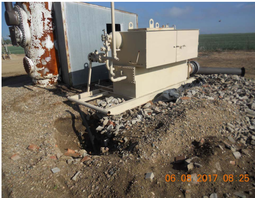
Photo 17. Looking NW at used separator, heater treater and poly line