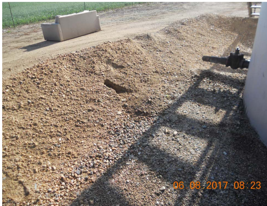
Photo 7. Animal burrow in berm.