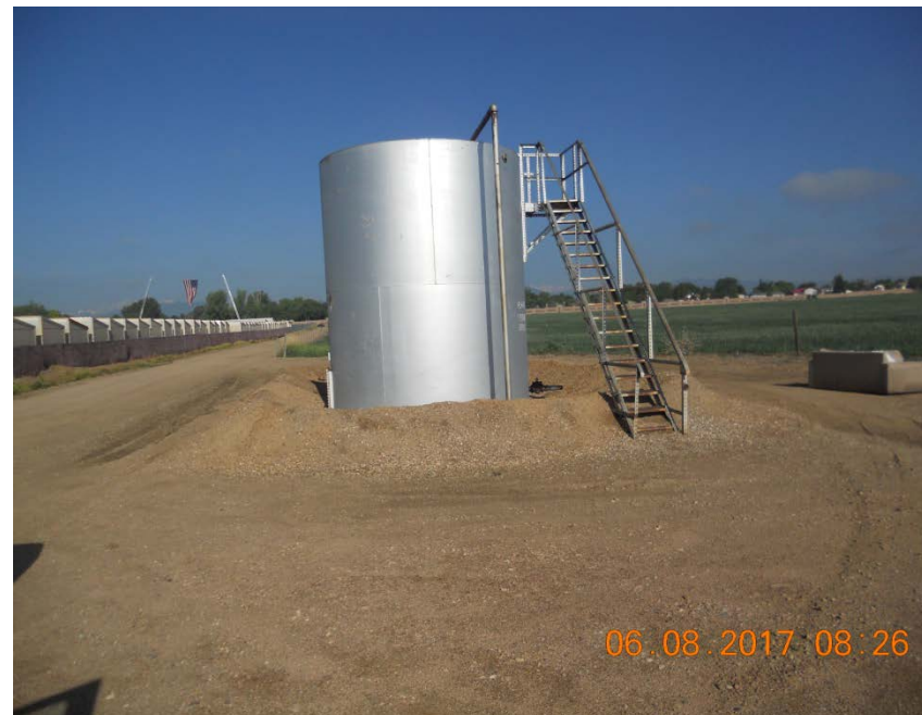
Photo 18. Looking west at production tank. Note Hwy 287 in background