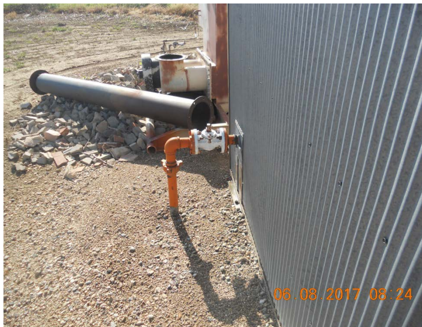
Photo 9. Gas sales riser on north side of treater shed. Valve in closed position