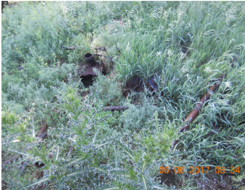
Photo 23. Misc debris in grass east on volume pot. Piping and rig anchors can be visualized.