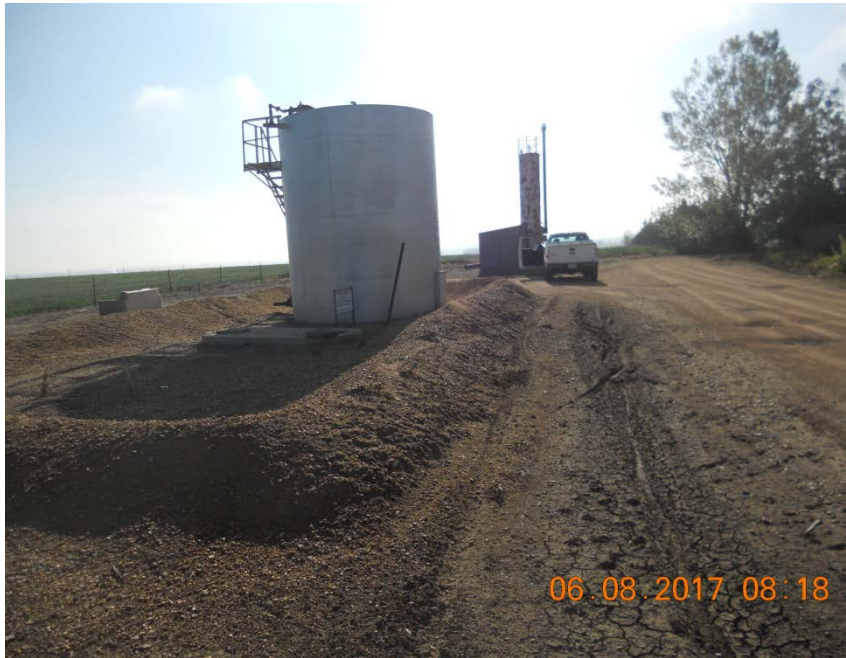
Photo 1. Tank battery looking east. Note tanks are visible from Hwy 287 are not painted as required. No NFPA label on oil tank.