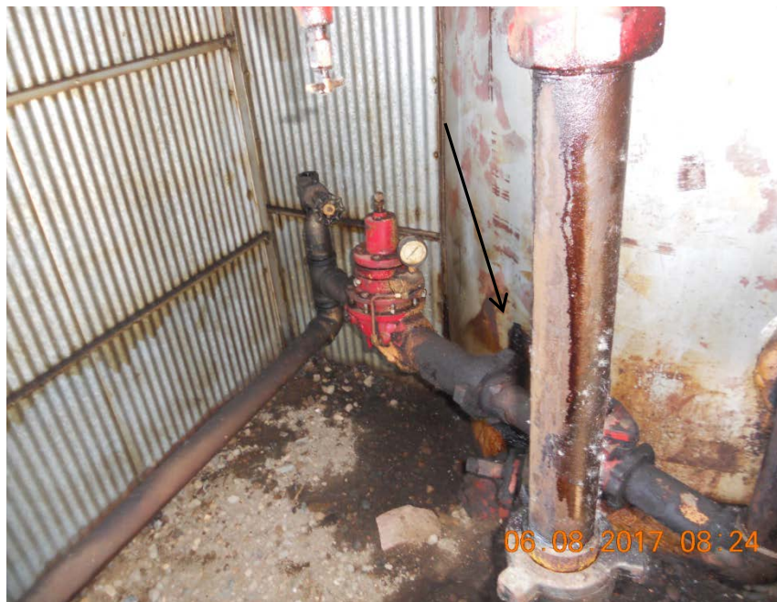
Photo 13. Second seep in treater wall