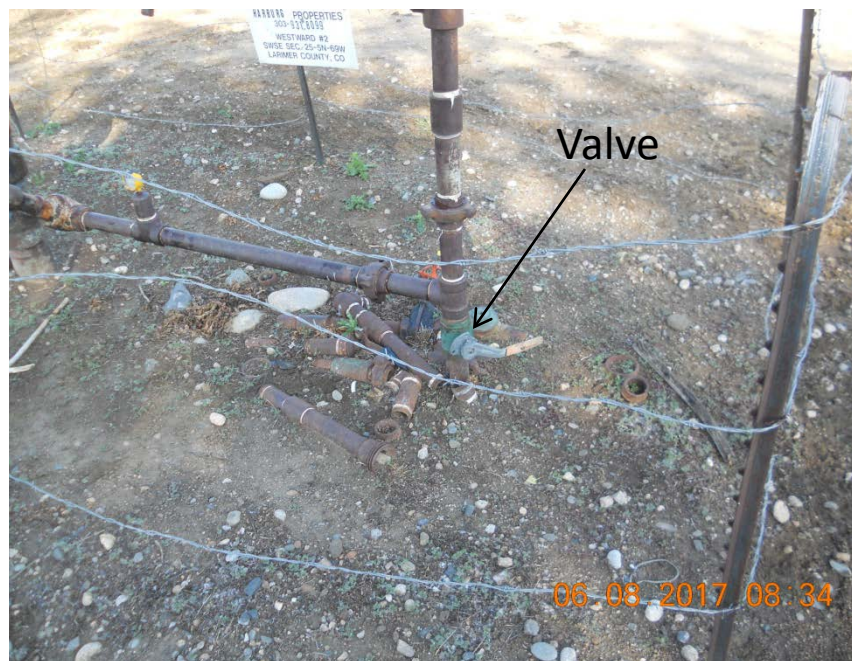
Photo 21. Misc fittings at wellhead. Note closed flowline valve.