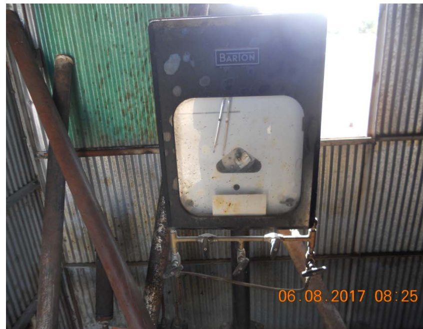
Photo 14. No chart to indicate gas sales