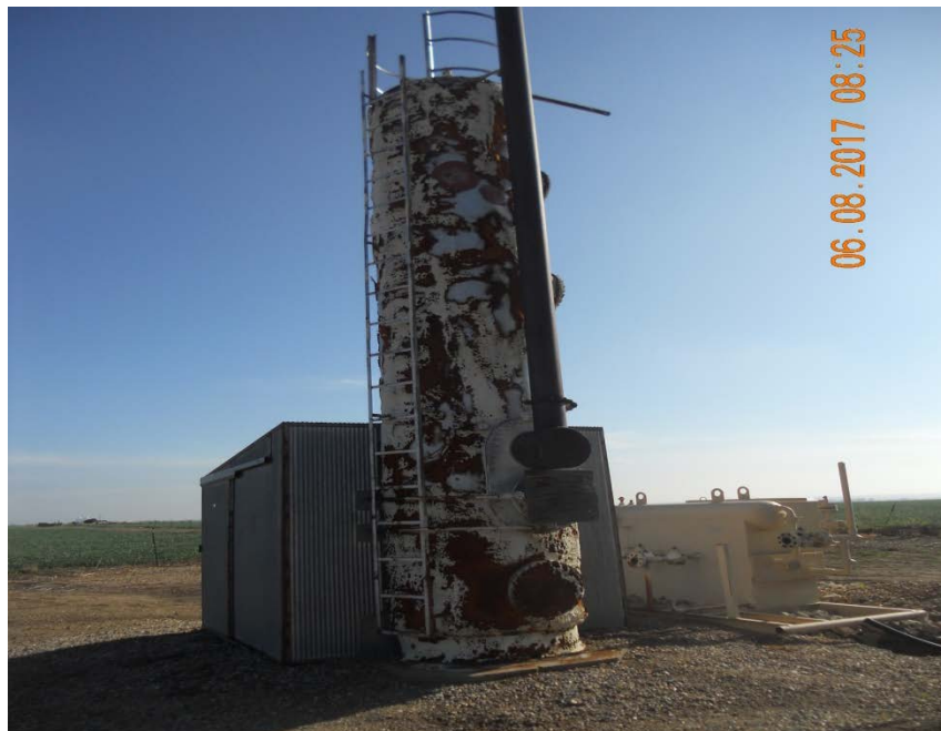
Photo 15. Vertical heater treater with insulation coming off. Unused horizontal separator