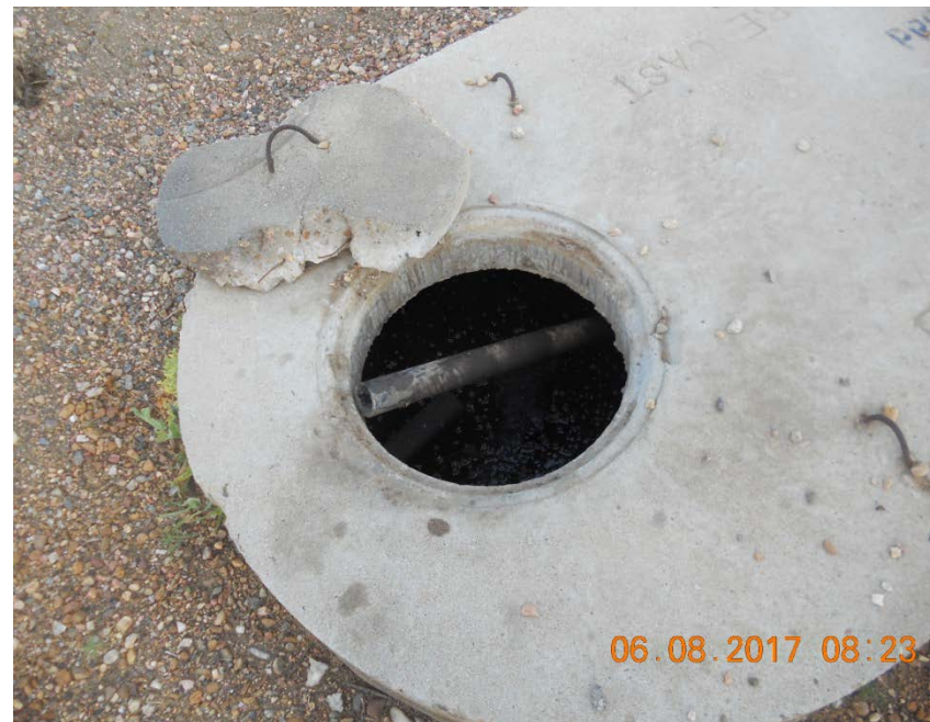
Photo 6. Open vault oily substance on water