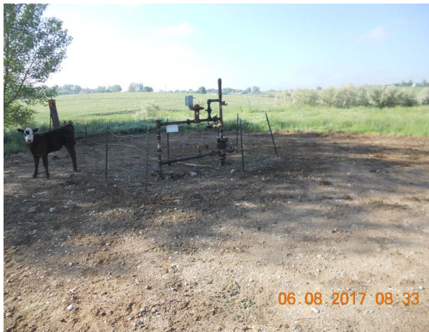
Photo 19. Looking south at wellhead