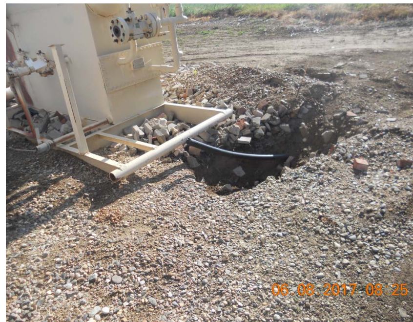
Photo 16. Unmarked 2" poly line stubbed out on south side of unused separator