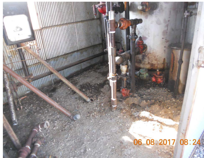
Photo 10. Stained soil in treater shed