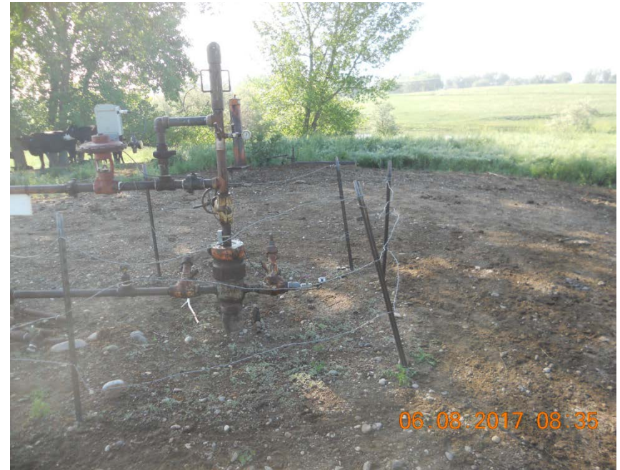
Photo 24. Wellhead looking east. Fencing is not appropriate for livestock on site