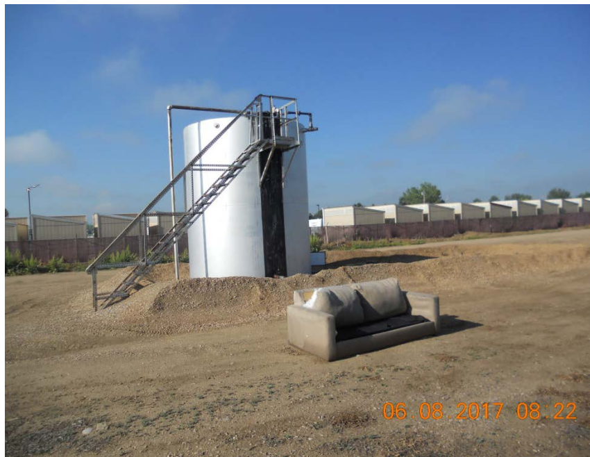
Photo 5. Tank painted silver. Debris on location.