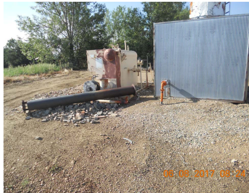
Photo 8. Unused separator at vertical heater treater