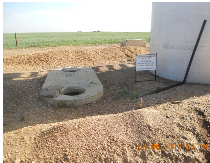
Photo 4. Signage for water vault not readily visible