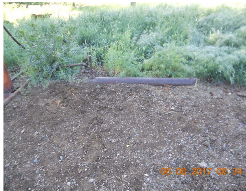
Photo 22. Unused gas volume pot to east of wellhead. Attempted to determine if discarded or plumbed in. Unable to move assume it is plumbed in