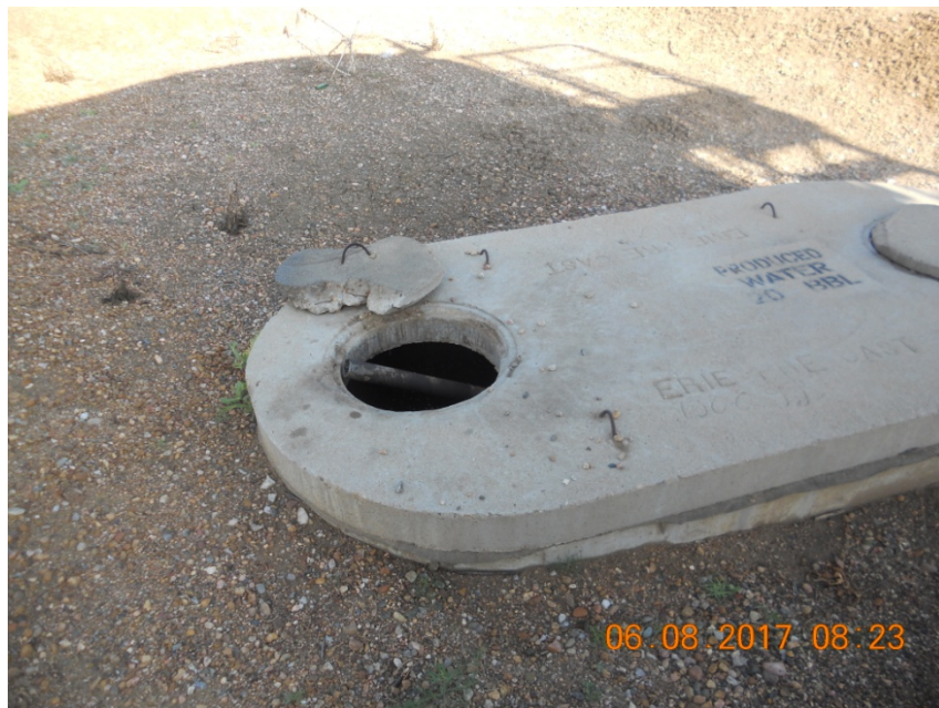
Photo 3. No NFPA label on water vault. Contents and capacity stenciled on top, but not readily visible from outside of berm