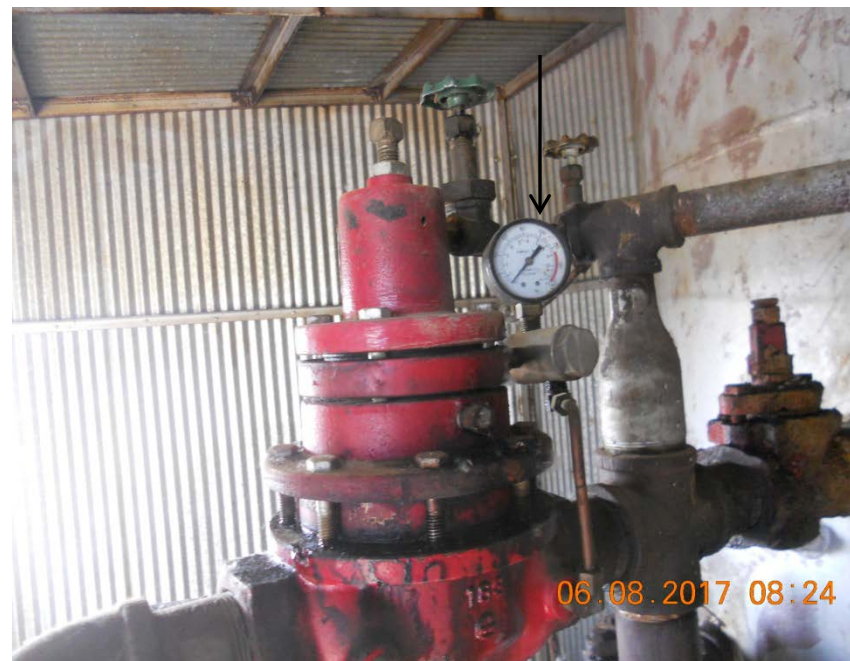
Photo 12. Gauge indicates no pressure on treater