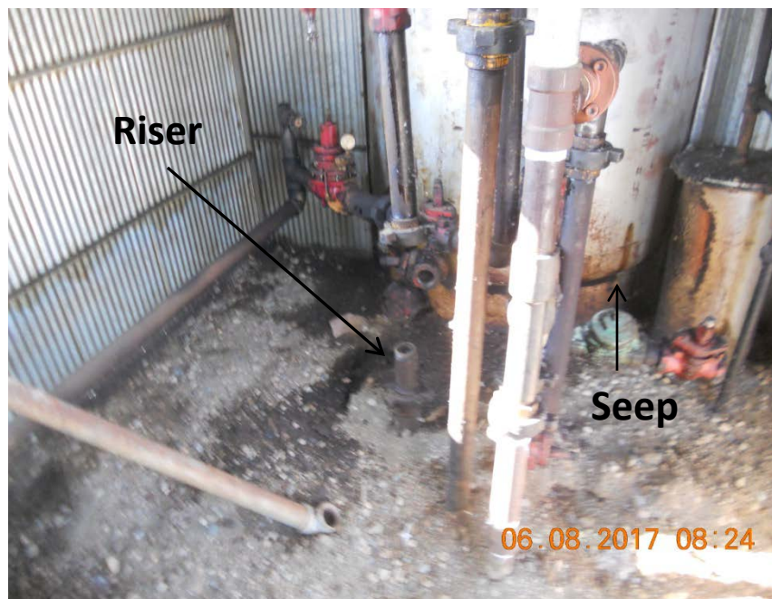
Photo 11. Stained soil and abandoned unmarked uncapped 3" riser in treater shed . Seep in treater wall.