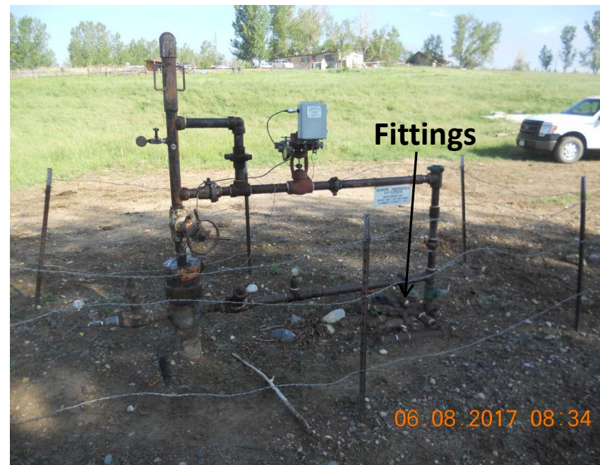
Photo 20. Looking west at wellhead. Note misc fittings at wellhead