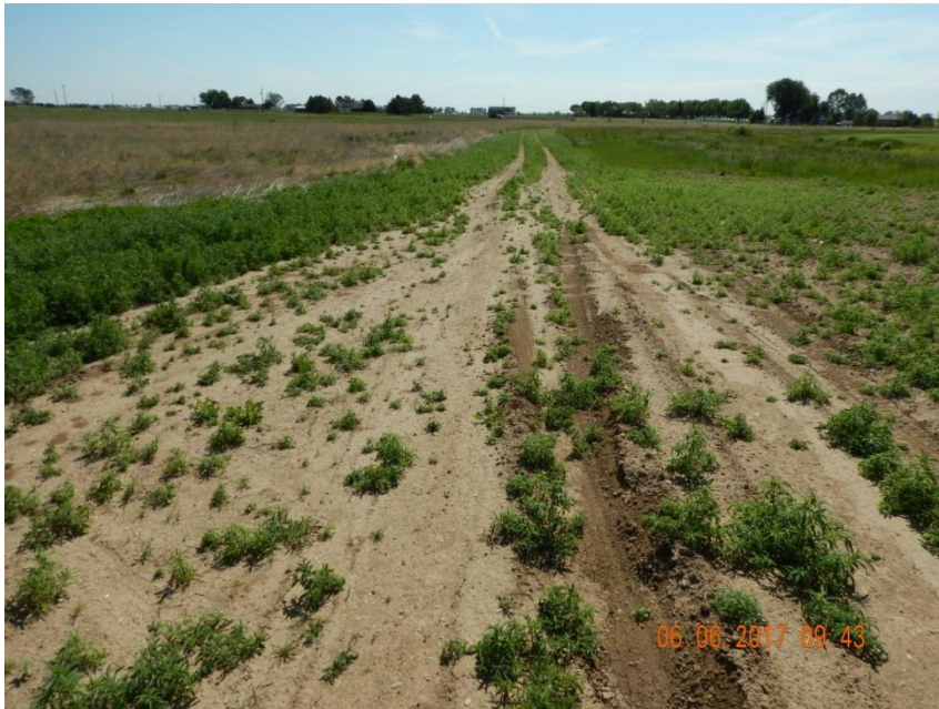
Photo 3. Photo taken from the well location along the access road, facing East. Access road is evident and does not appear final reclamation activities have been performed based on the lack of grass species and the abundance of weedy annuals, mostly Kochia.