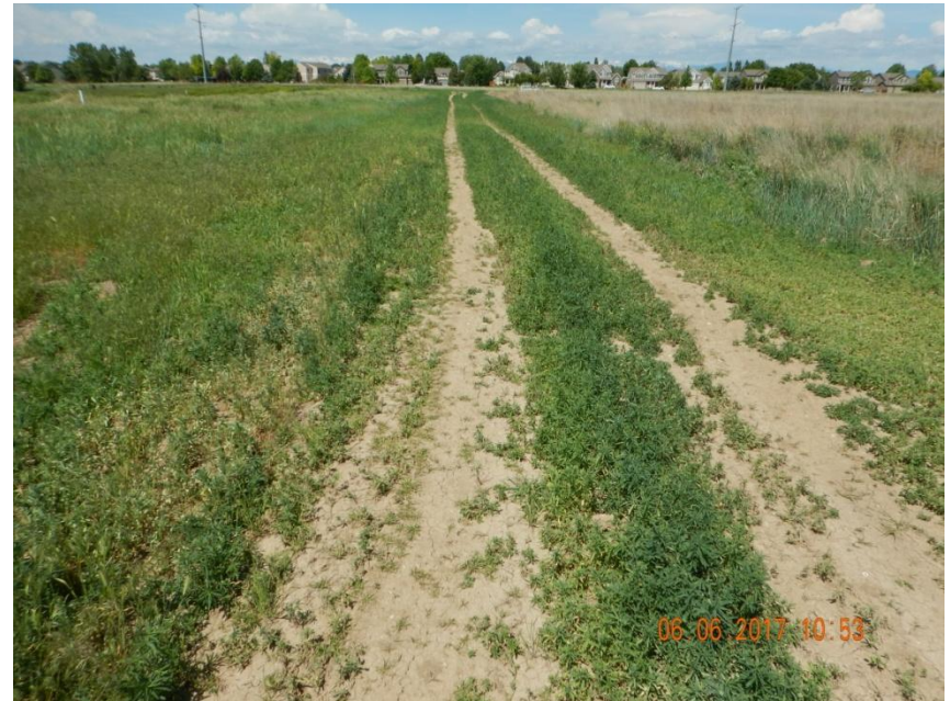
Photo 4. Photo taken from the eastern access road, facing West towards the well location. Access road is evident and does not appear final reclamation activities have been performed based on the lack of grass species and the abundance of weedy annuals, mostly Kochia.