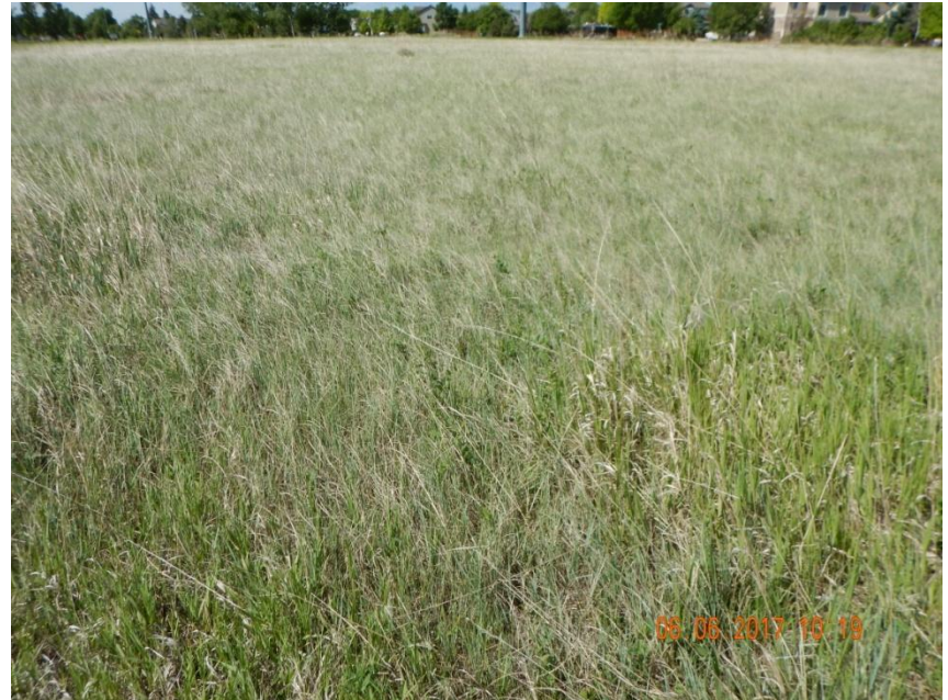
Photo 8. Reference photo taken south of the well location illustrating Smooth Brome ( Bromus inermis ) and Western wheatgrass ( Pascopyrum smithii ).