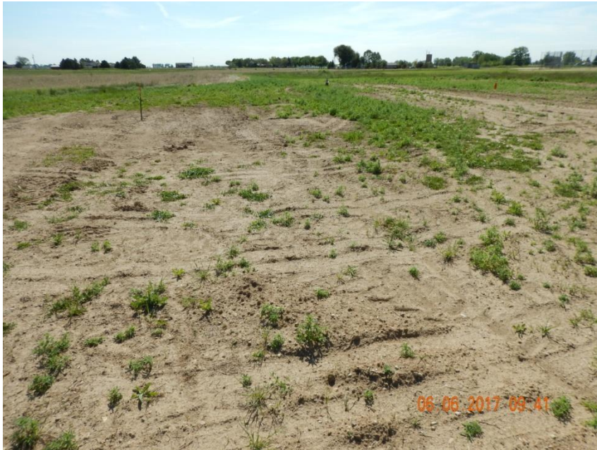
Photo 1. Photo taken from the northern well location, facing East. Does not appear final reclamation activities have been performed based on the lack of grass species and the abundance of weedy annuals, mostly Kochia.