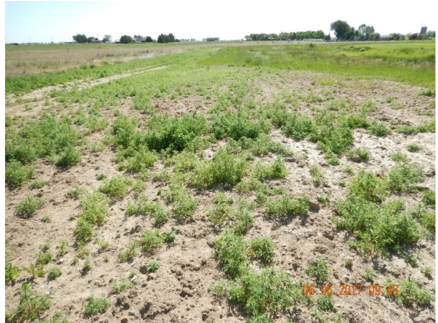
Photo 2. Photo taken from the southern well location, facing East. Does not appear final reclamation activities have been performed based on the lack of grass species and the abundance of weedy annuals, mostly Kochia.