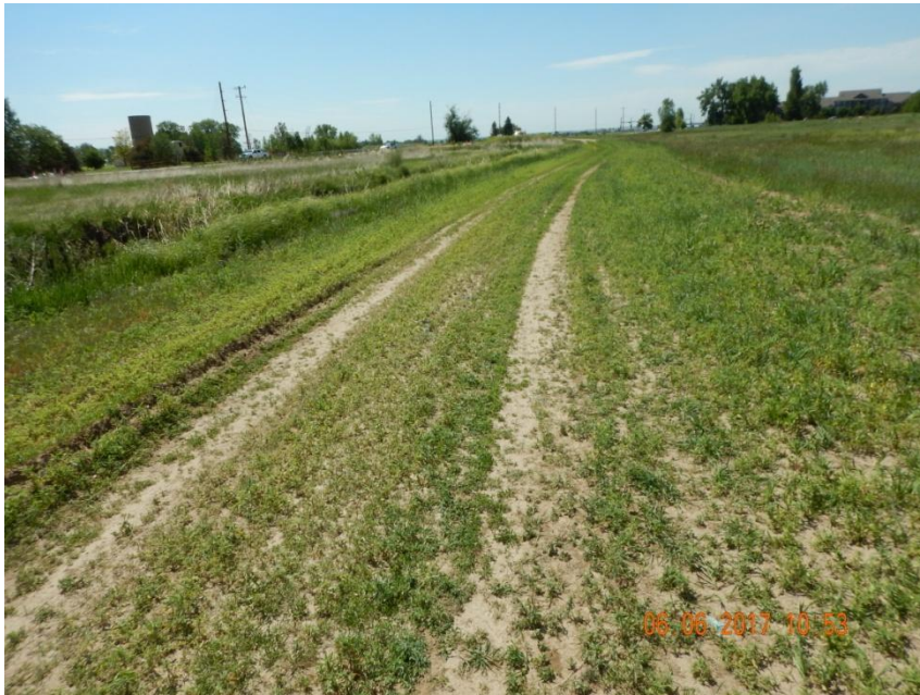
Photo 5. Photo taken from the previous photo location, facing South. Access road is evident and does not appear final reclamation activities have been performed based on the lack of grass species and the abundance of weedy annuals, mostly Kochia.