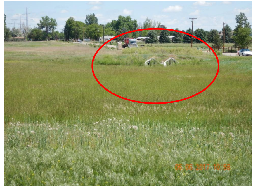
Photo 6. Photo taken of the access road entrance off CR 1. Culverts remain at location and have not been removed per Rule 1004.