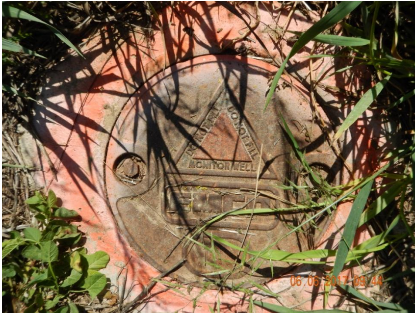
Photo 7. Photo taken of a monitoring well on the well location. It is unclear whether all monitoring wells have been properly plugged.