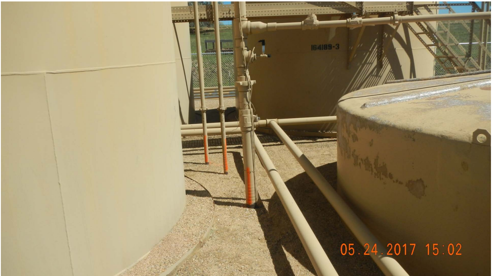
Risers at tanks.