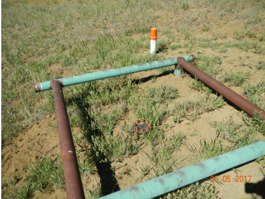
Photo 7: View of unknown equipment on the northern edge of the project area.