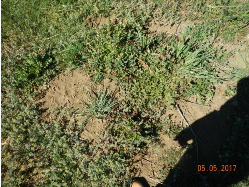
Photo 3: View of musk thistles ( Carduus nutans ) and weedy area in the southwestern portion of the project area.