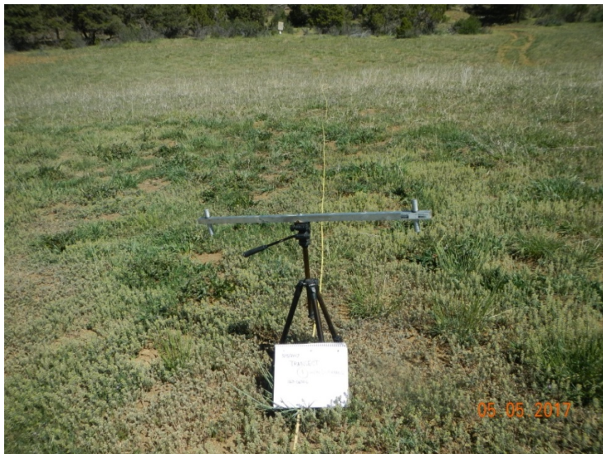
Photo 5: View of the beginning of Transect 1-within the project area facing northward.