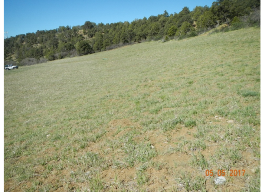
Photo 2: View of the northern portion of the project area from the northeastern corner facing westward. Revegetation is largely comprised of grasses such as smooth brome ( Bromus inermis ) and western wheatgrass ( Pascopyrum smithii ).