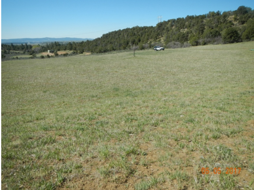
Photo 1: View of the project area from the northeastern corner facing center.