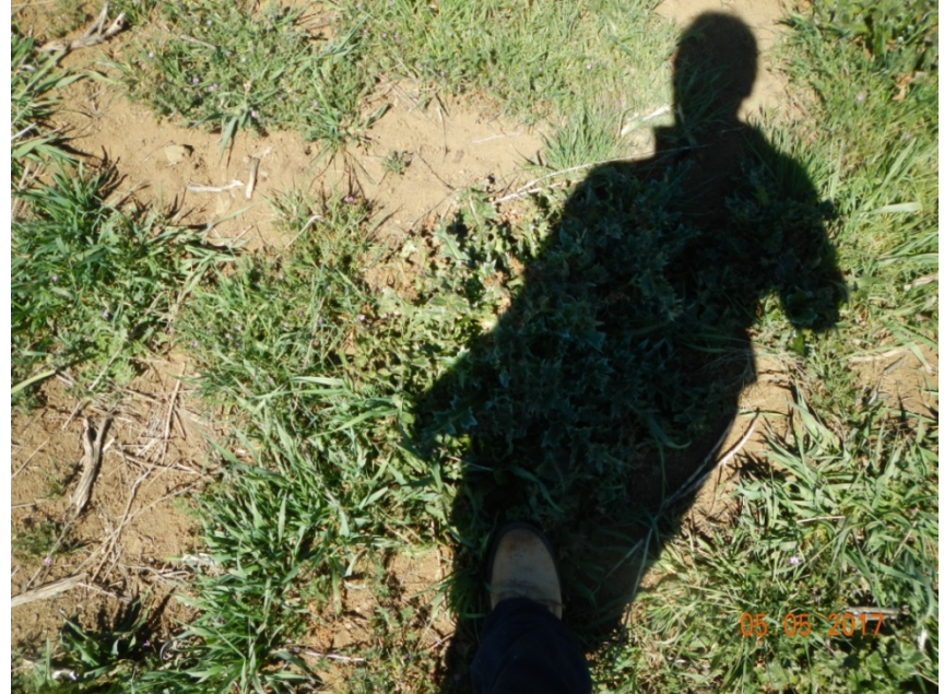
Photo 4: Another view of musk thistles and weedy vegetation in the southwestern portion of the project area.