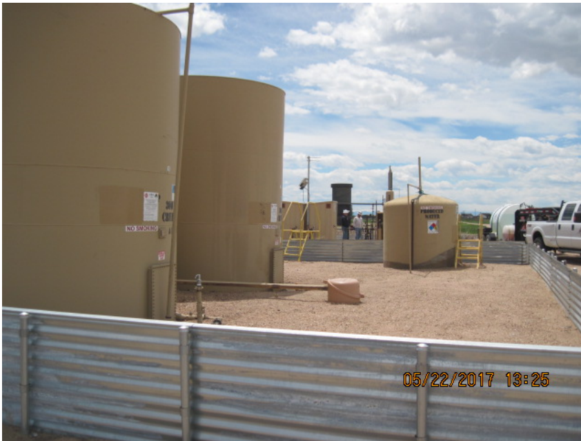
Kammarzell 5-16 battery