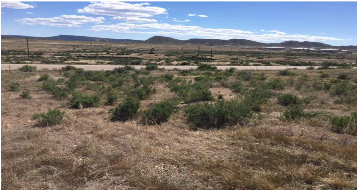
Pipe clean up by the road. South of the location.