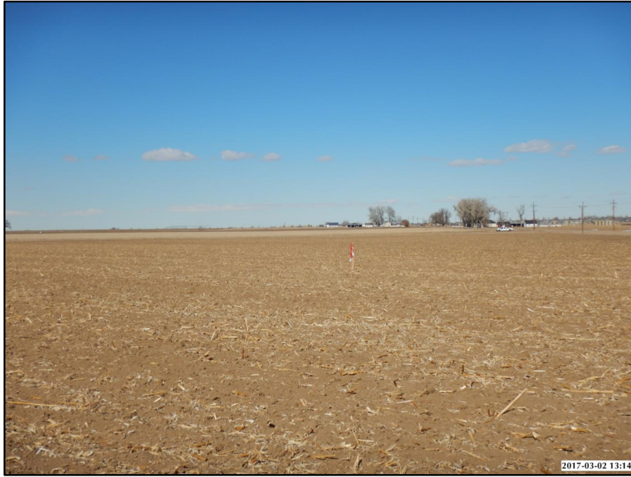
PICTURE OF FALKEN 9-11 PAD WELL PAD LOCATION - CAMERA ANGLE NORTH