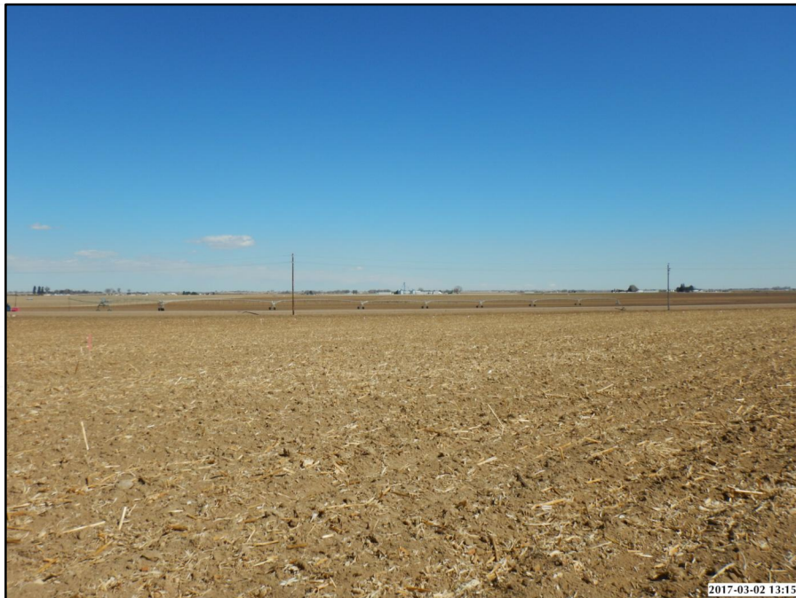
PICTURE OF FALKEN 9-11 PAD WELL PAD LOCATION - CAMERA ANGLE EAST