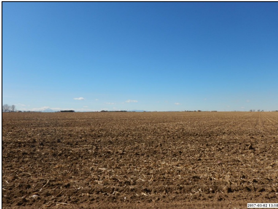
PICTURE OF FALKEN 9-11 PAD WELL PAD LOCATION - CAMERA ANGLE WEST