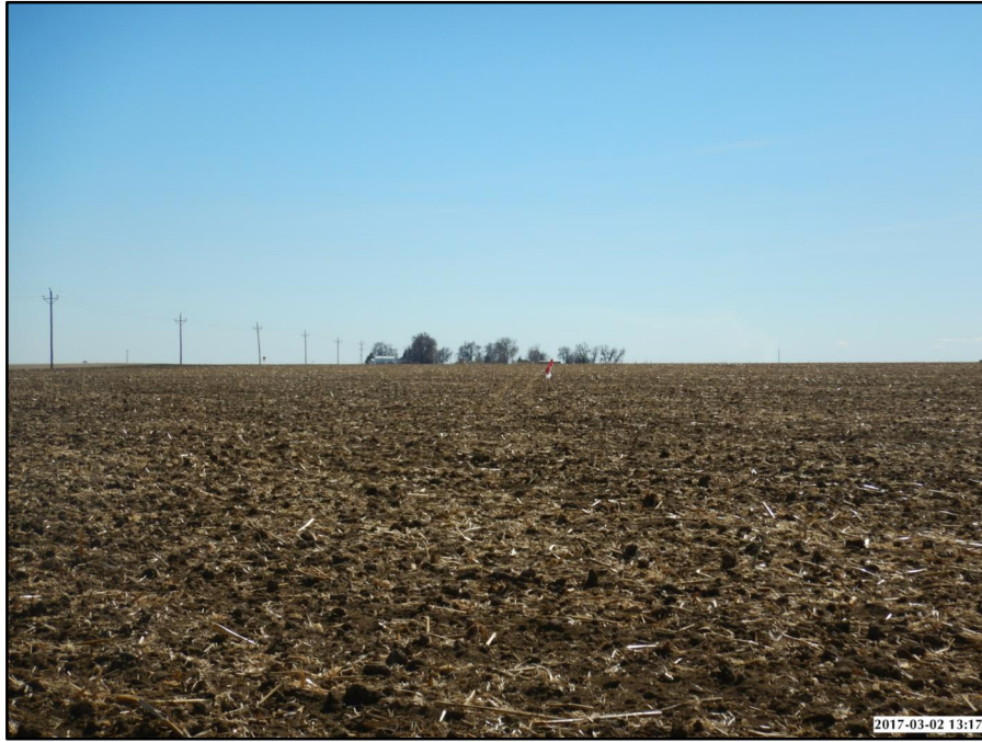
PICTURE OF FALKEN 9-11 PAD WELL PAD LOCATION - CAMERA ANGLE SOUTH