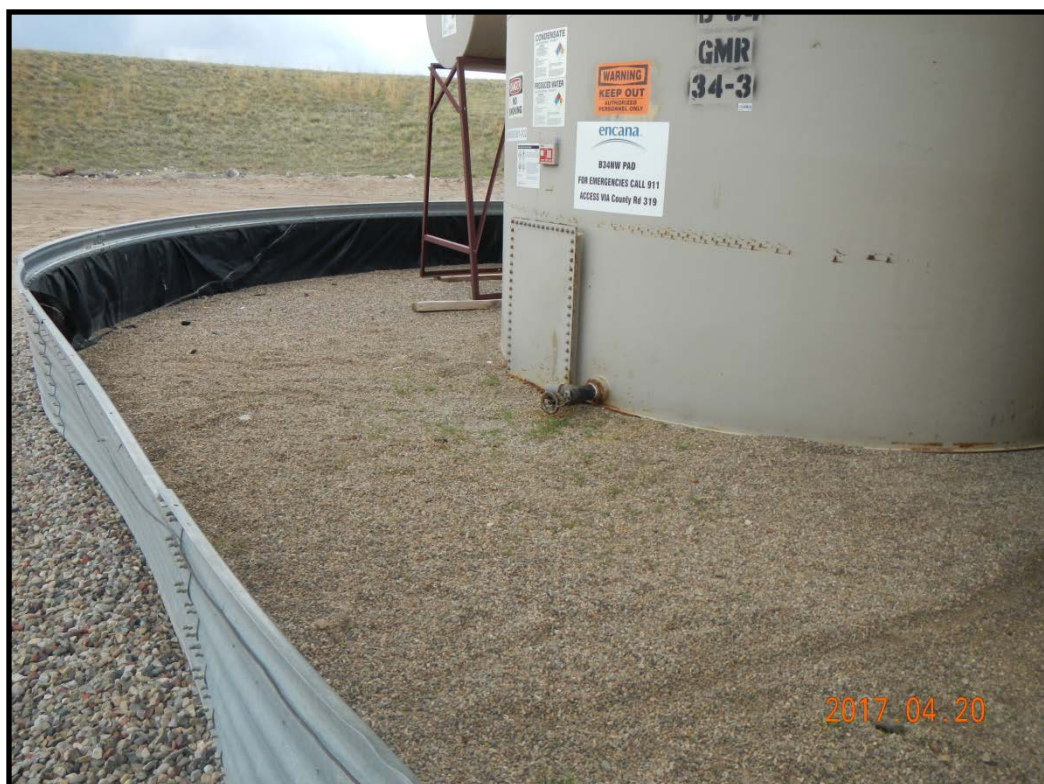
No signs of staining within the secondary containment.