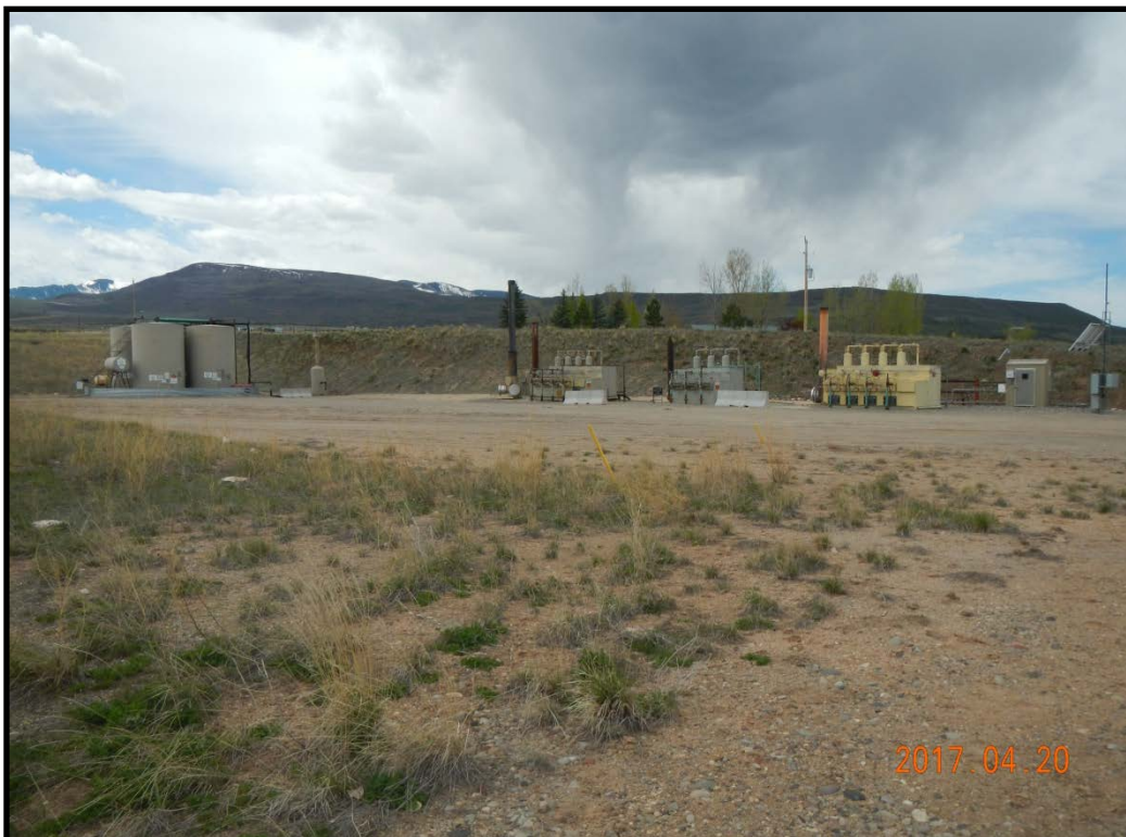
Facilities on Pad Location ID #335102) – Separators, tanks, meter house. Looking southwest. No staining, no junk, good housekeeping.