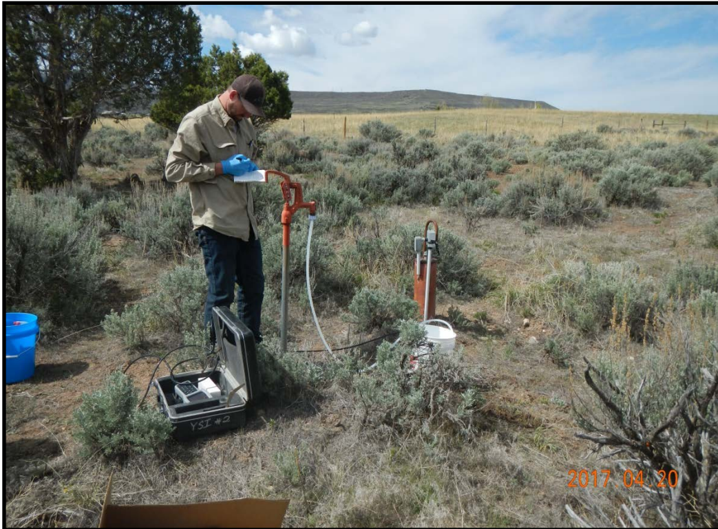
Taking samples from the water well. Looking northwest. Distance from the water well to closest Encana well on Location #335102 is about 600 feet.