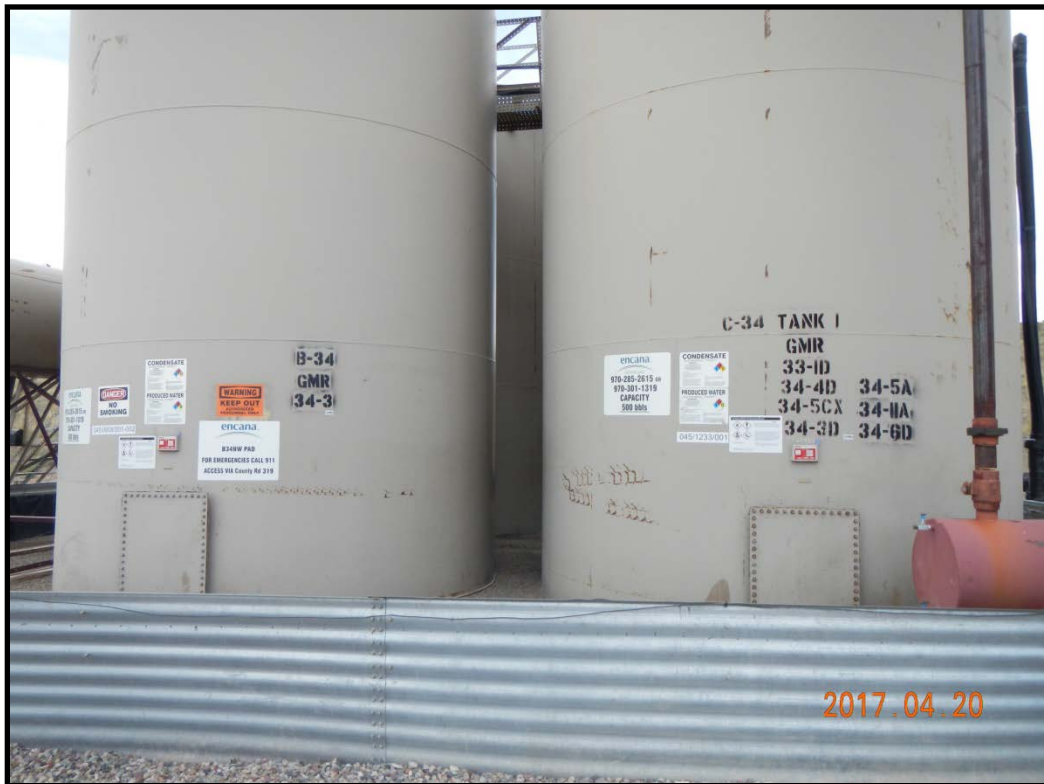
Four Condensate/Produced Water tanks (500 bbls each). Signs in place. Lined secondary containment.