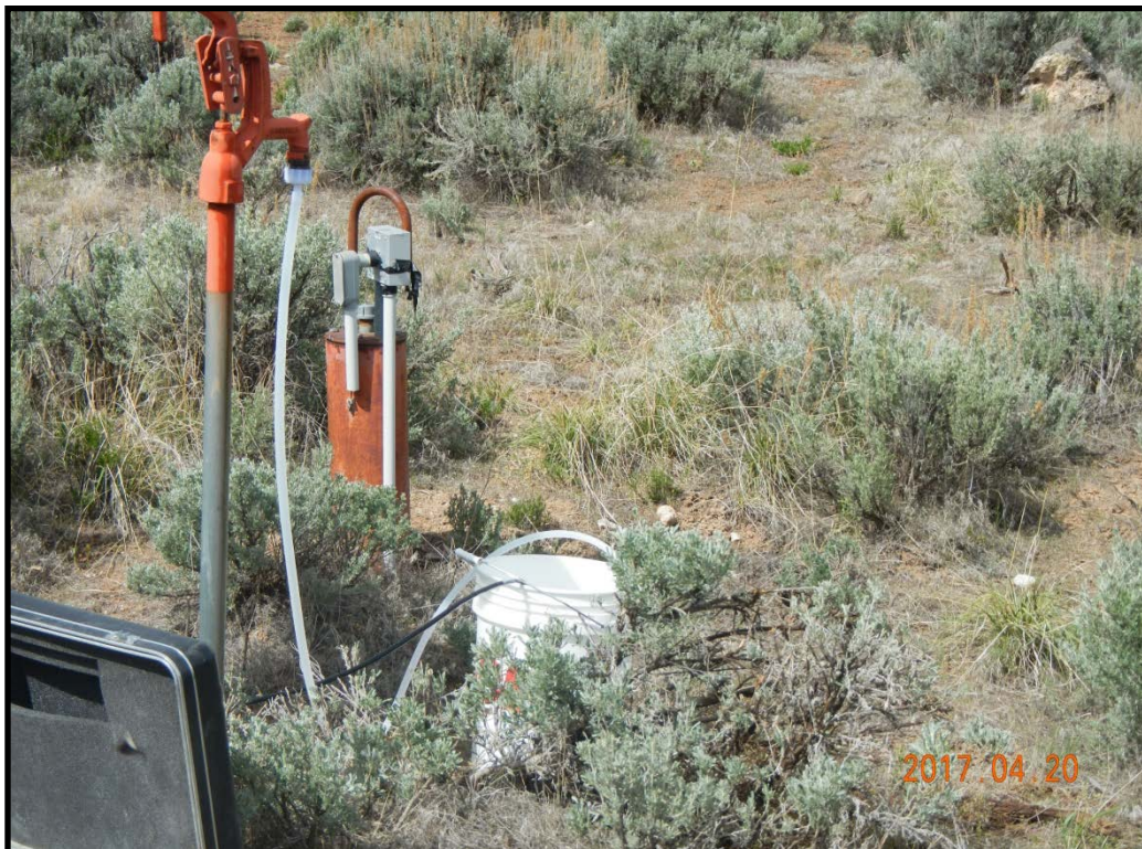
Water well close-up