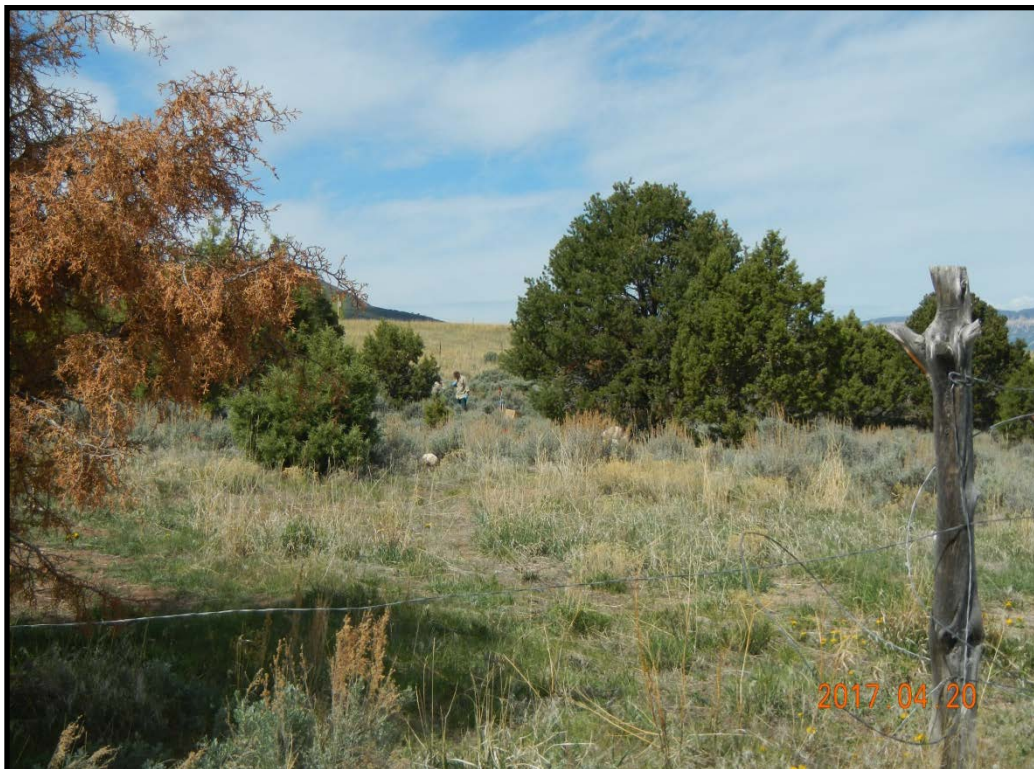
Water well Permit #36551 ((1999). Well was perforated to a depth of 160 feet. Looking west from the same location of photo above.