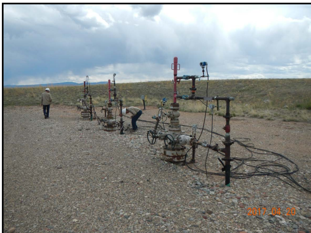
Inspecting well heads. Bradenhead pressure zero on all wells. No staining observed. Looking east-southeast.