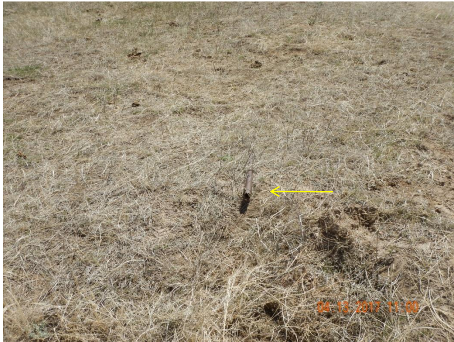
Photo 3: Photo taken from the east end of where the concrete pumping unit remains. Photo shows pipe still remaining and sticking out of the ground. This will need to be removed.