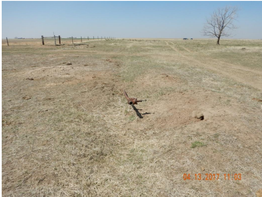
Photo 5: Photo taken from the east of the concrete pumping unit. Photo shows pipe remaining and sticking out of ground. Likely gathering/flow line. This needs to be removed and area reclaimed.