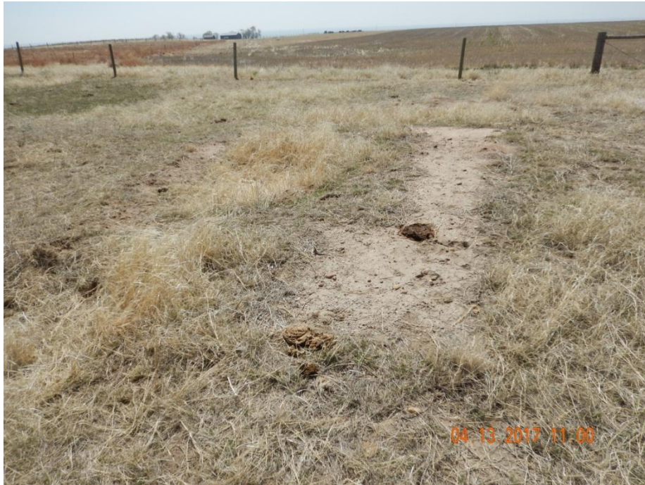
Photo 1: Photo taking from the concrete pumping unit, facing south. This needs to be removed and the area reclaimed.