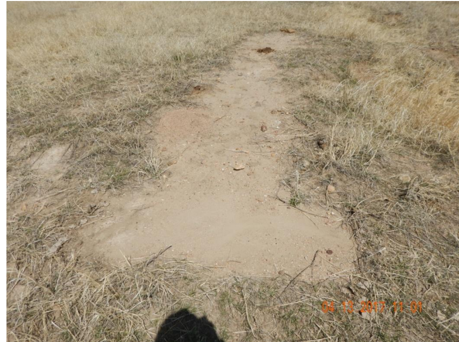
Photo 2: Photo taking from the concrete pumping unit, facing south. Photo shows that a thin layer of soil has accumulated on top of unit, after a little scraping the concrete base was evident. This needs to be removed and the area reclaimed.