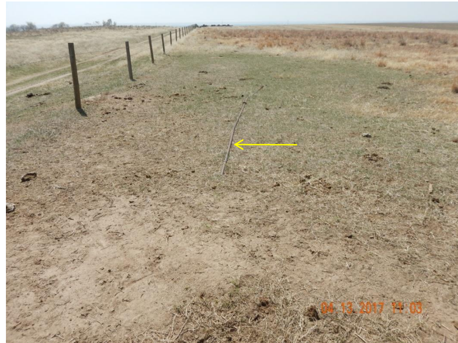
Photo 4: Photo taken from the fence corner east of the concrete pumping unit, facing south. Photo shows pipe still remaining and sticking out of the ground. This will need to be removed.