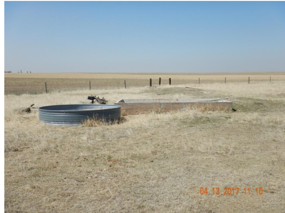
Photo 6: Photo taken from the north end of the location, facing west. Photo shows additional concrete structures remaining in the immediate area. Tank likely surface owners, it is unclear if the concrete structures area related to the O&G location. Surface owner appears to be storing equipment/debris in area.